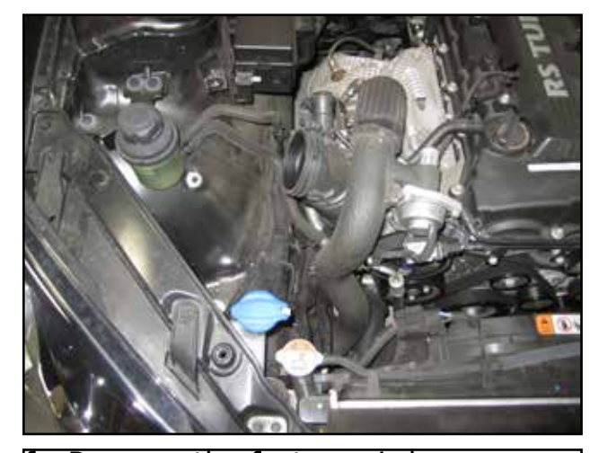
f. Remove the factory air box.