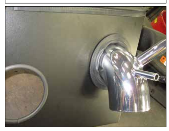
Place intake tube (B) through the hole in the heat shield (O) as shown.