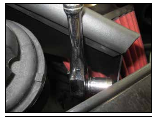
r. Now tighten the two OEM M6 bolts.