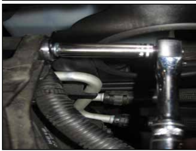
p. Now tighten the front M6 bolt installed in step n.