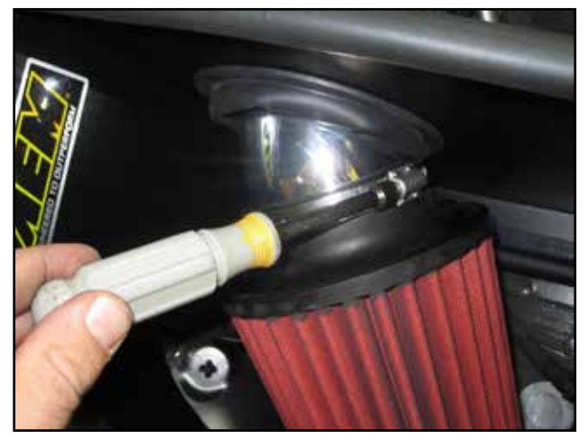
t. Align the filter and tube then tighten hose clamps (F) and (I).