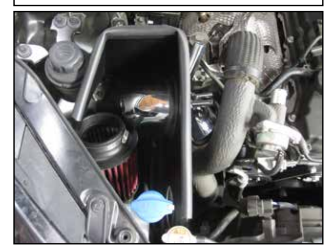
k. Set heat shield (O) and intake tube(B) in place.