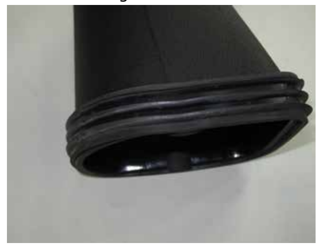
Install the OEM rubber gasket on the AEM scoop adapter (A)

a. When installing the intake system, do not completely tighten the hose clamps or mounting hardware until instructed to do so.