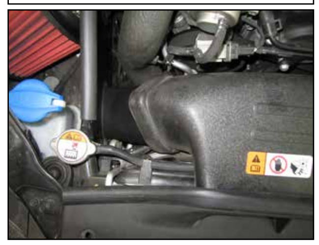
v. Install the scoop and adapter as shown.