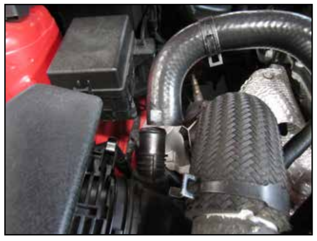
a. Remove the recirculation hose on the OEM intake pipe.