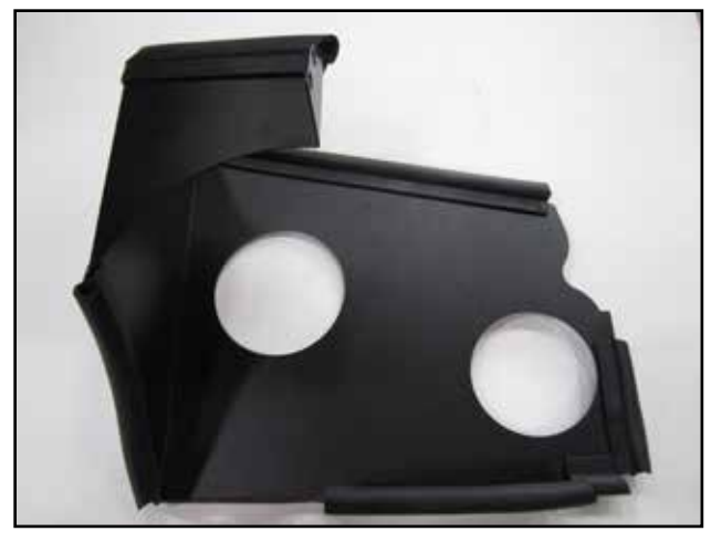
f. Install the edge trim (J) & (N) on the outer edges of the heat shield as shown.