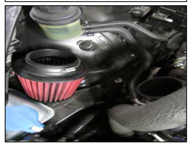
h. Place filter (E) and hose clamp (F) in the engine bay as shown.