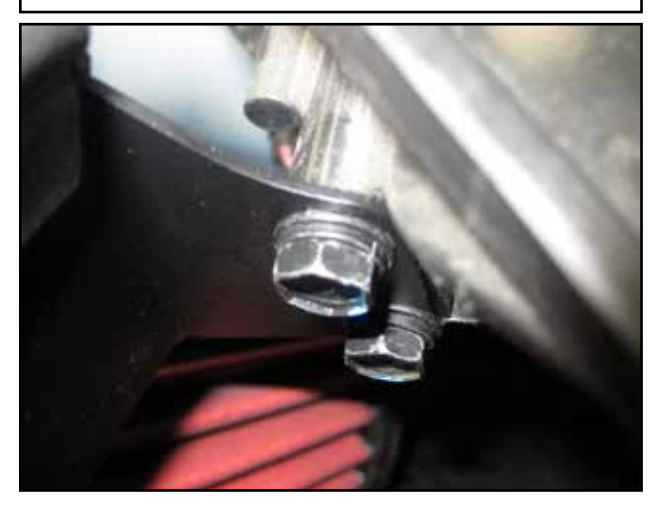
q. Reinstall the OEM M6 bolts in the factory mounting bracket location.