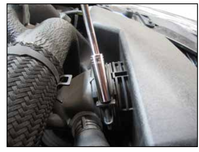
b. Loosen the hose clamp on the intake pipe.