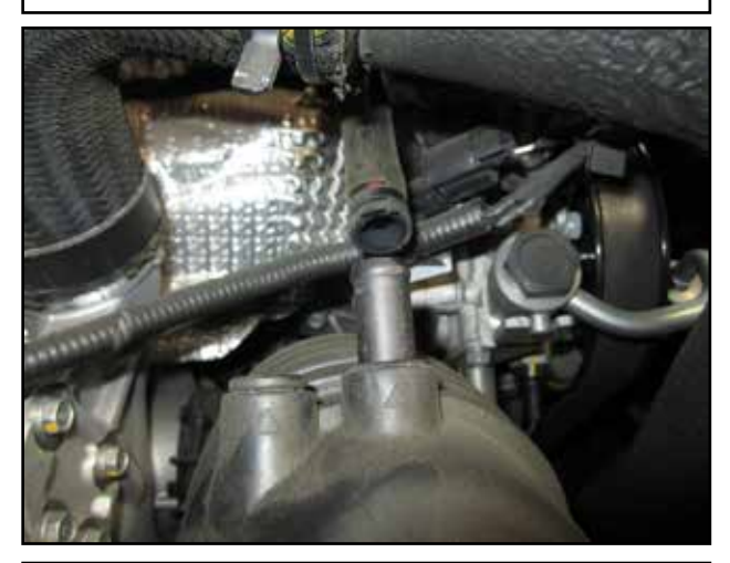
g. Release the clips on the two PCV hoses (Manual Trans) and disconnect the hoses from the intake tube. (Automatic shown)