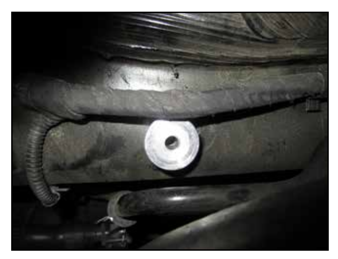
e. Set provided spacer (L) in place. Position the spacer in the indicated location.