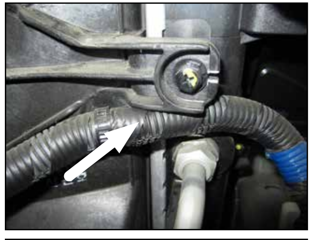
Remove the bolt on the fan shroud.