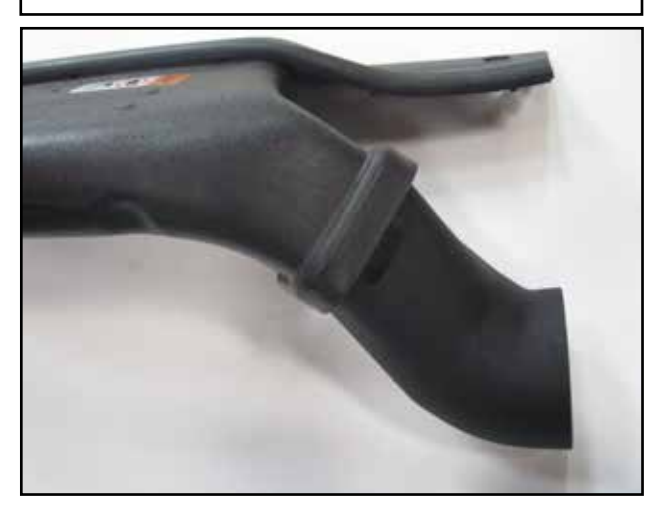
u. Install the AEM scoop adapter (A) into the OEM ducting.