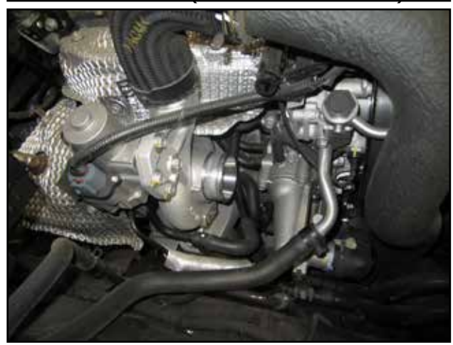
Remove the intake tube from the engine bay.