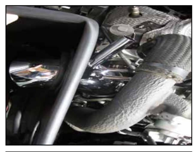
Install intake tube (B) into coupler (H) .