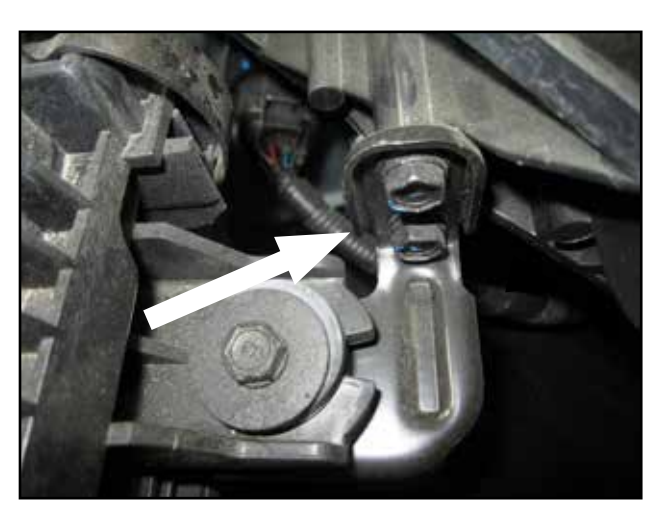
c. Loosen & remove the two M6 bolts securing the air box bracket that secures the air box bracket to the radiator core support.