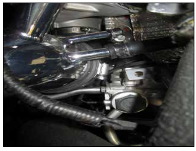
s. Reconnect the PCV hoses and fasten with the OEM spring clamps.