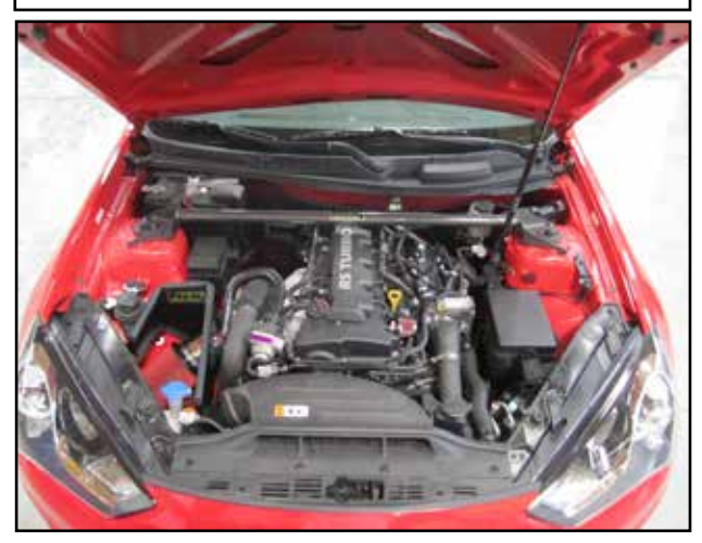
w. Reinstall the four clips used to secure the OEM air duct and re install the recirculation hose on AEM intake tube.