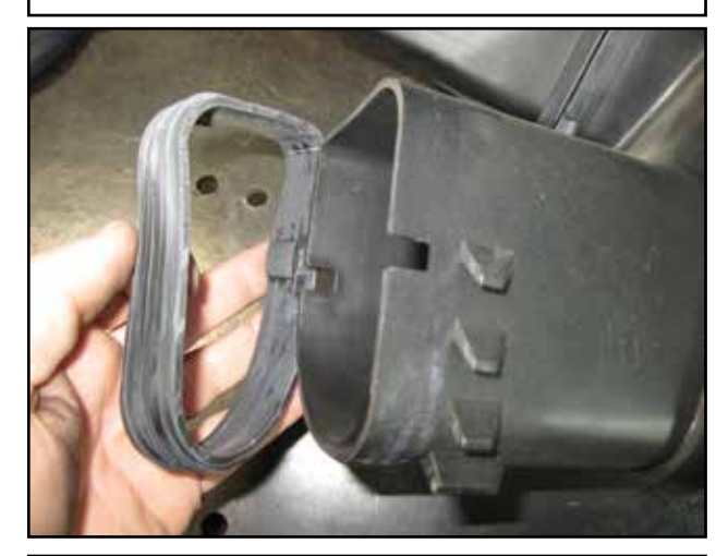
j. Remove the seal from the air box.