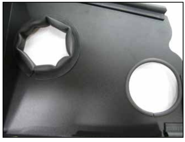
g. Install edge trim (C) and (D) on the two large holes as shown.