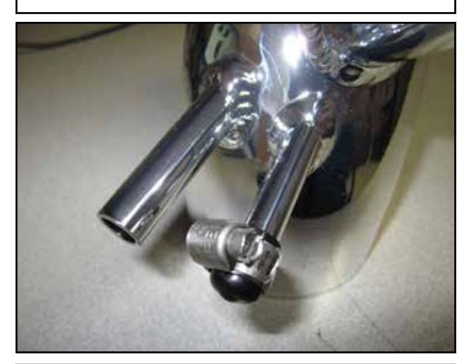
i. For automatic cars use the provided cap (R) and hose clamp (S) to cap off the vent tube.