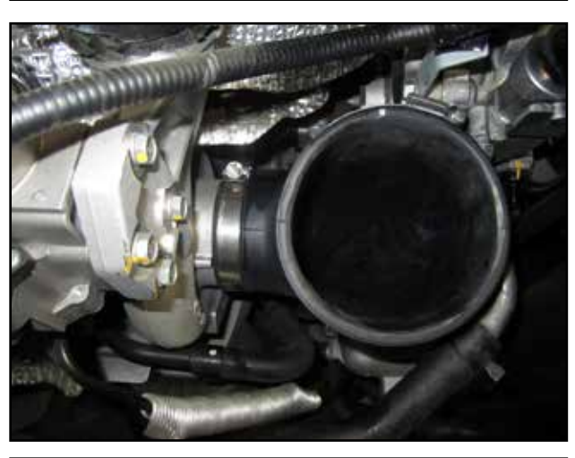
d. Install the coupler (H) onto the Turbo inlet using the provided hose clamps (G) and (I).