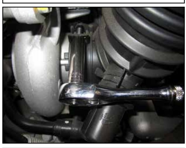
h. Loosen the hose clamp securing the stock tube onto the turbo inlet.