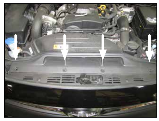
e. Remove the four clips securing the scoop and set scoop aside for use with the AEM intake system.