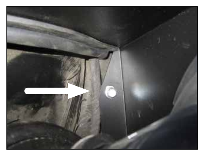
m. Install the M6 Bolt (M) and washer (Q) onto the bottom of the heat shield. Do not fully tighten at this time.