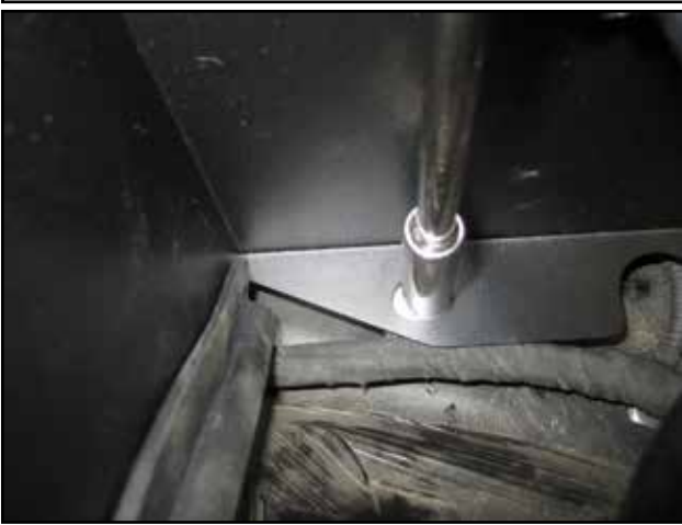
Now tighten the lower M6 (M) bolt. installed in step m.