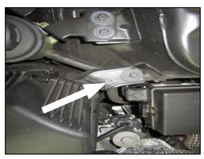
d. Remove the M6 bolt holding the airbox in place.