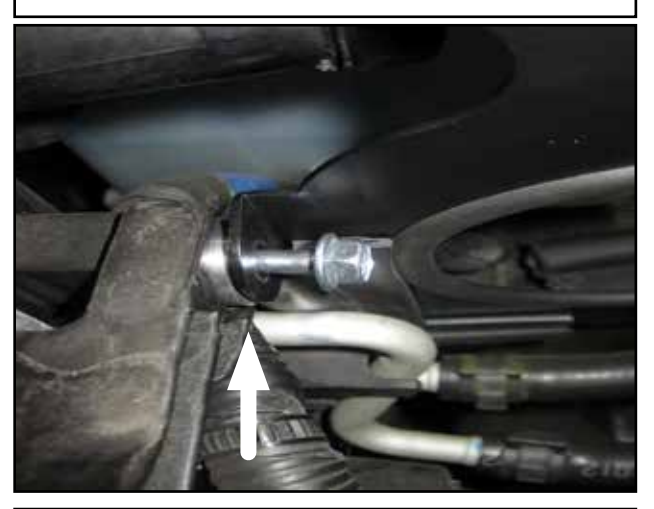
n. Install the mounting block (K) and M6 bolt (M) into the front mounting tab. Do not fully tighten at this time.