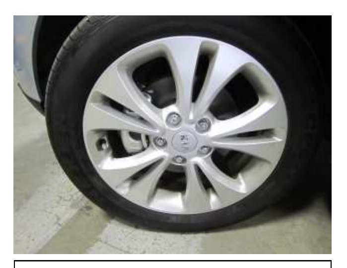
e. Raise the drivers side wheel and secure the vehicle with proper safety equipment. Remove the drivers side front wheel.