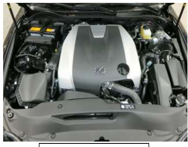
o. Factory air induction system.