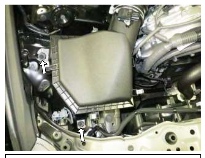
f. Loosen and remove the two M6 bolts indicated.

g. Loosen the hose clamp and slide the stock tube off the throttle. Remove the stock intake system.