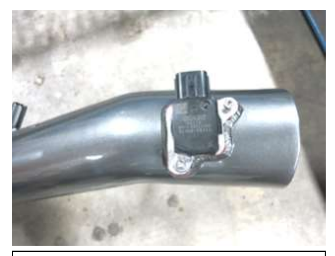
a. Reinstall the MAF sensor into the AEM tube and fasten using the provided bolts(07733).

a. When installing the intake system, do not completely tighten the hose clamps or mounting hardware until instructed to do so.