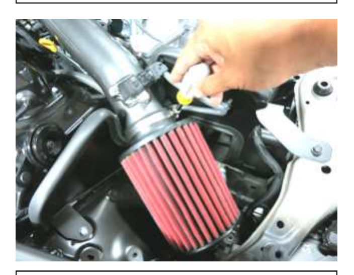
j. Install the AEM filter onto the inlet end of the tube. Adjust for clearance and secure down with the provided hose clamp(9452).

h. Align the mounting bracket as shown. Fasten the M8 bolt installed from step 3c using a 13mm wrench.