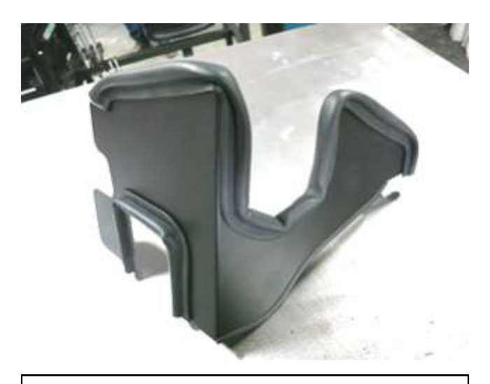
d. Install the 3 provided edge trim pieces onto the AEM heat shield as shown.

c. Loosely install the provided M8 bolt(1-2066) and washer(559960) into the threaded hole located on the engine block.