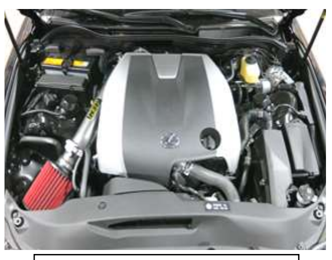
p. Finished installation of AEM Intake System.