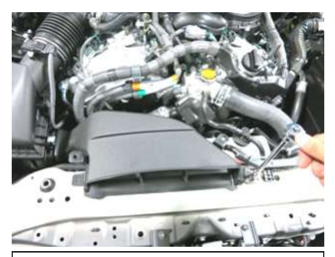
c. Use a 10mm socket to remove the M6 bolt securing the fresh air inlet duct. Detach the air duct from the lower airbox and set aside.

a. Lift up on the engine cover to loosen and carefully set it aside.