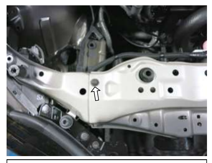
b. Remove the indicated bolt using a 10mm socket. Set this bolt aside for use with the AEM heat shield installation.