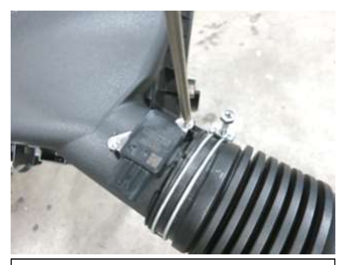
h. Use a Philips screwdriver to remove the MAF sensor from the stock intake tube.