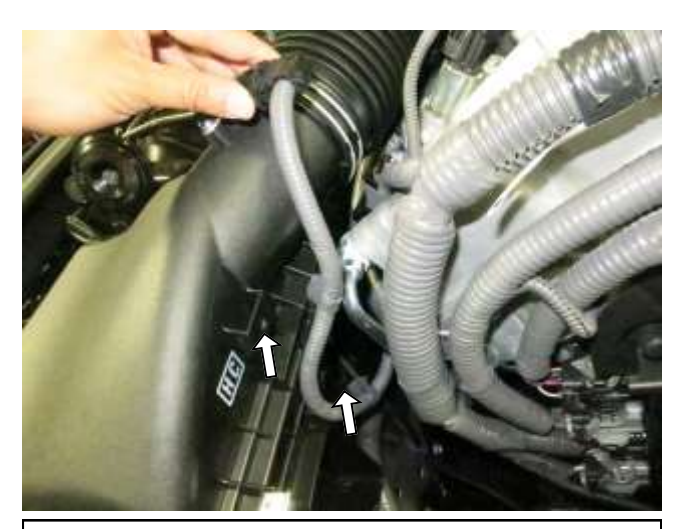
d. Disconnect the two tree mount clips securing the MAF harness to the stock airbox. Unclip the harness from the MAF sensor as shown.

b. Depress the 8 plastic clips indicated and remove the plastic upper fascia.