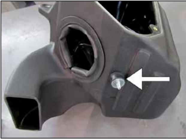
f. Install the supplied rubber mount (1228598) into the threaded insert on the front of the airbox.