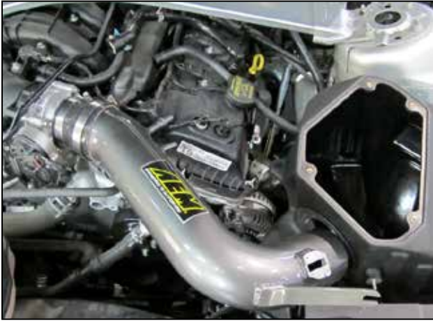
j. Position the intake pipe as shown. Insert the throttle body end of the pipe into the throttle body coupler as far as it will go.