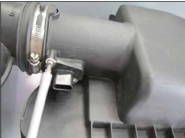
i. Remove the OEM MAF sensor from the OEM airbox and set it aside for future use.