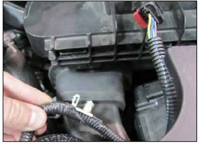
f. Unclip the MAF sensor wire harness from the airbox.