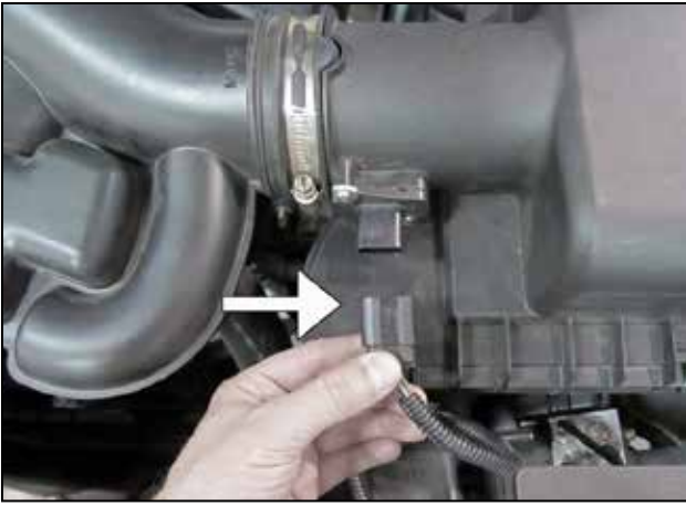
e. Unplug the MAF sensor connector.