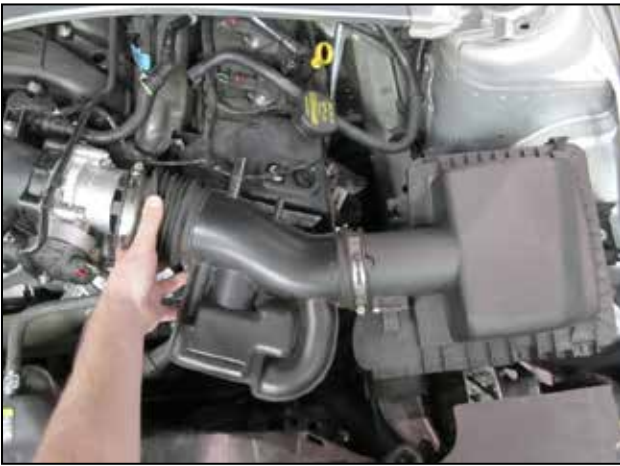
g. Remove the OEM inlet tube off of the throttle body.