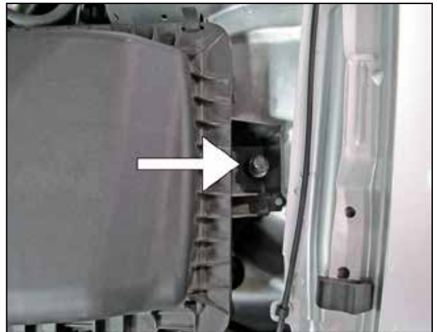
d. Loosen and remove the M6 bolt securing the airbox to the inner fender.