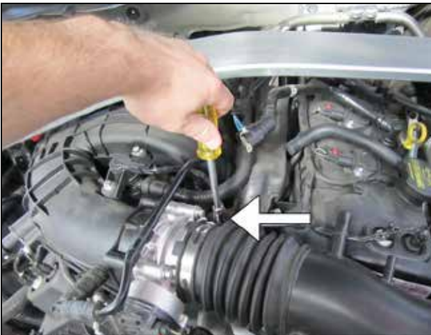
c. Loosen the hose clamp at the throttle body.