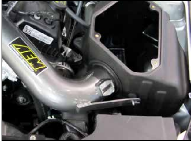
k. Insert the filter end of the intake pipe through the large hole in the airbox.