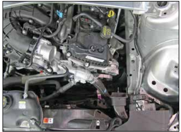
h. Lift up and remove the OEM airbox and intake tube from the vehicle.