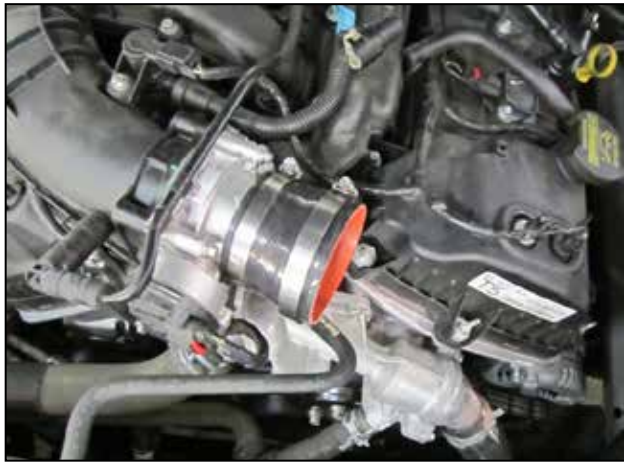
i. Install the throttle body coupler using one #48 hose clamp (9448) and one #56 hose clamp (9456).