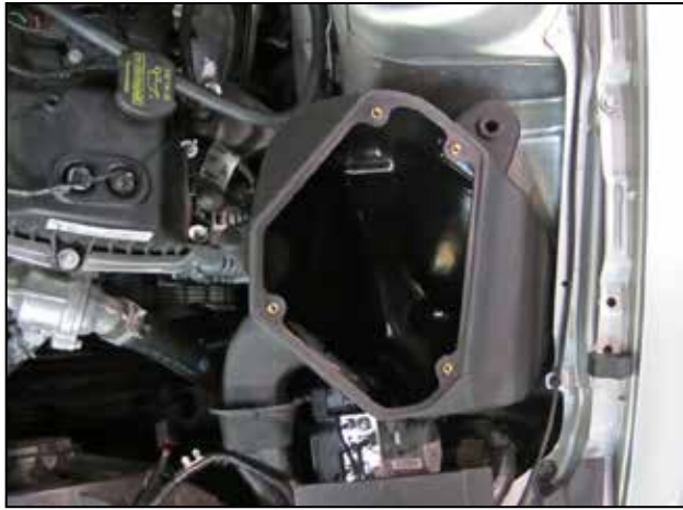
g. Lower the airbox assembly into position as shown. Ensure that the bosses on the bottom of the airbox are properly seated in the grommets that were installed in step 3b.