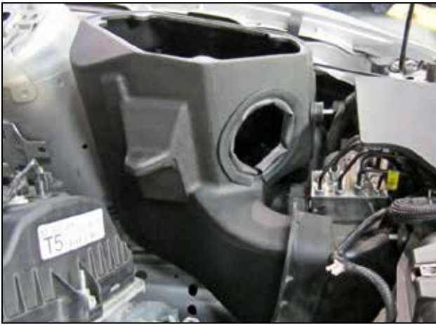
h. Ensure the inlet of the airbox engages the rubber part of the OEM inlet scoop.