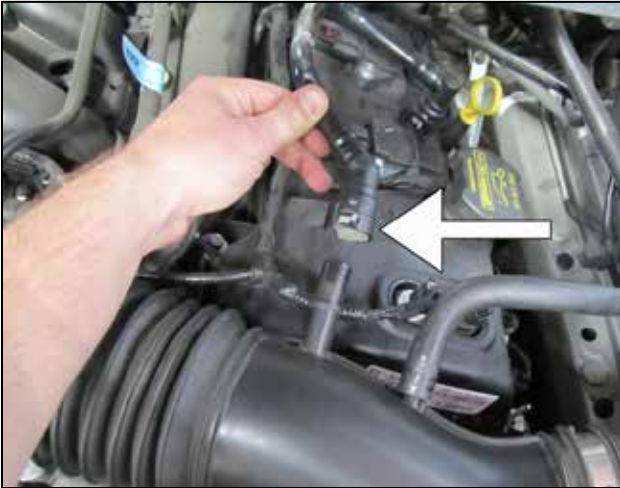
a. Disconnect the crankcase vent line.