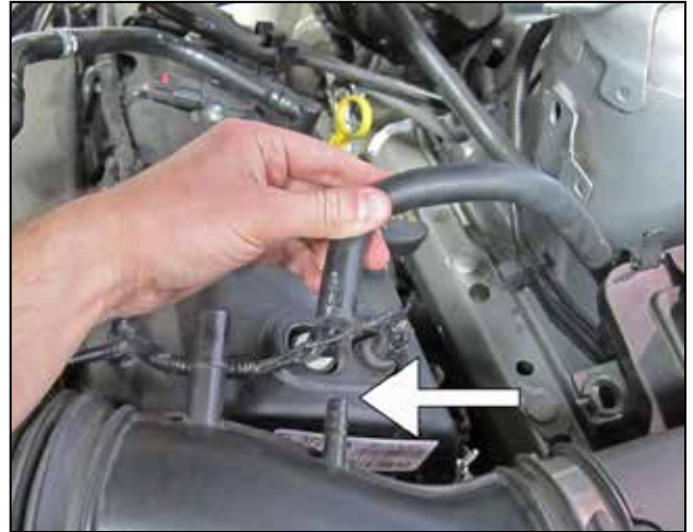
b. Disconnect the brake booster vacuum line.