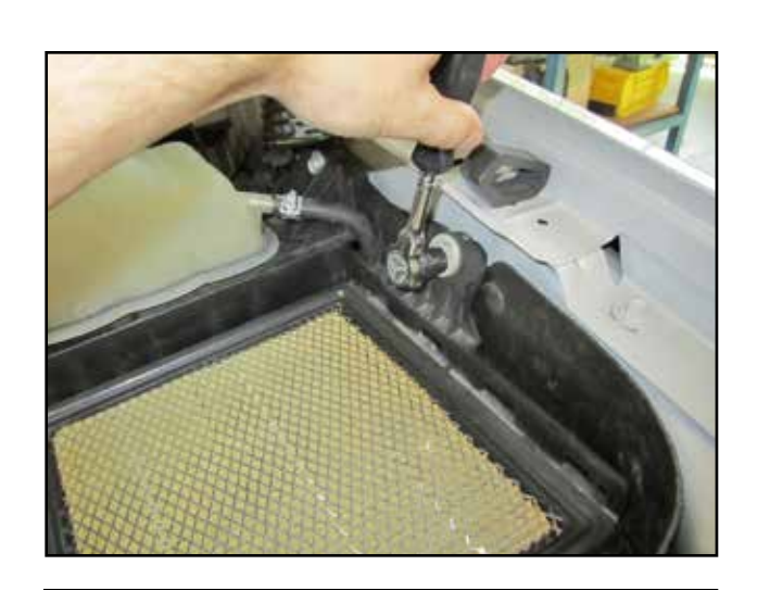
n. Remove the two bolts securing the stock lower air box.