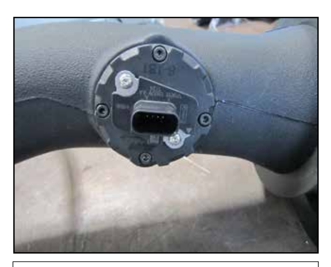
u. For Trucks using a MAF sensor Install the OEM sensor with the supplied M4 bolts (J). Trucks using an intake Air Temp Sensor move to step v.