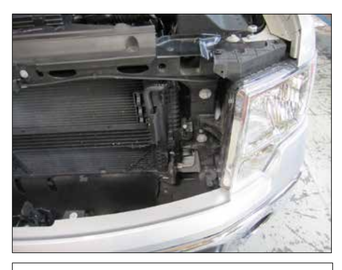
c. Remove the shield.