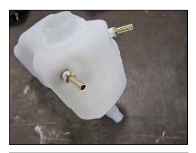
k. Install two brass barbs (S) into the AEM coolant reservoir (U) using thread sealant to seal the threads.