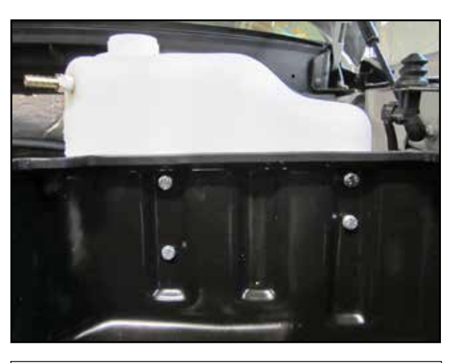
m. Install the AEM reservoir (U) and secure it to the AEM lower air box using the four M6 bolts (N) and washers (M) provided.