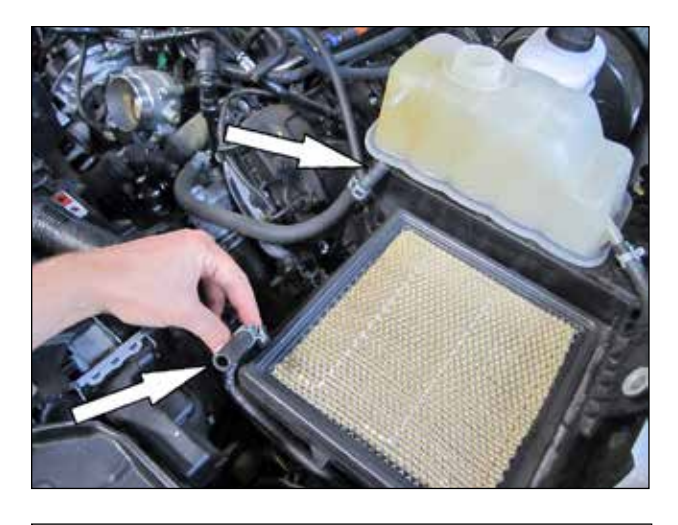
q. Remove the hose from the reservoir, and disconnect the other hose from the radiator.