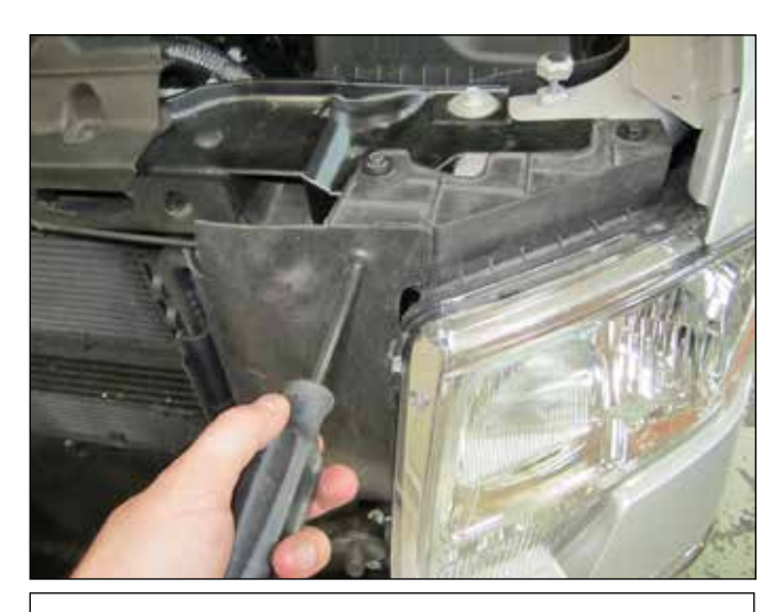
a. Remove the clip securing the shield to the headlight.