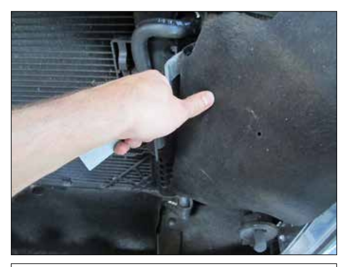
b. Remove two clips securing the shield to the radiator mount.