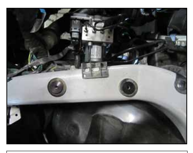
g. Install two barb mounts (L) into the stock rubber air box grommets as shown.