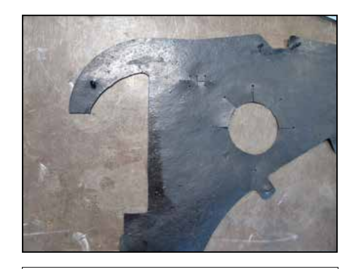
c. Trim the inner fender liner as shown.