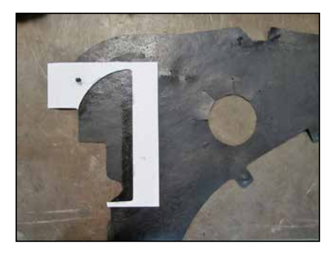
b. Cut out the provided template and line it up on the inner fender liner as shown.

a. When installing the intake system, do not completely tighten the hose clamps or mounting hardware until instructed to do so.