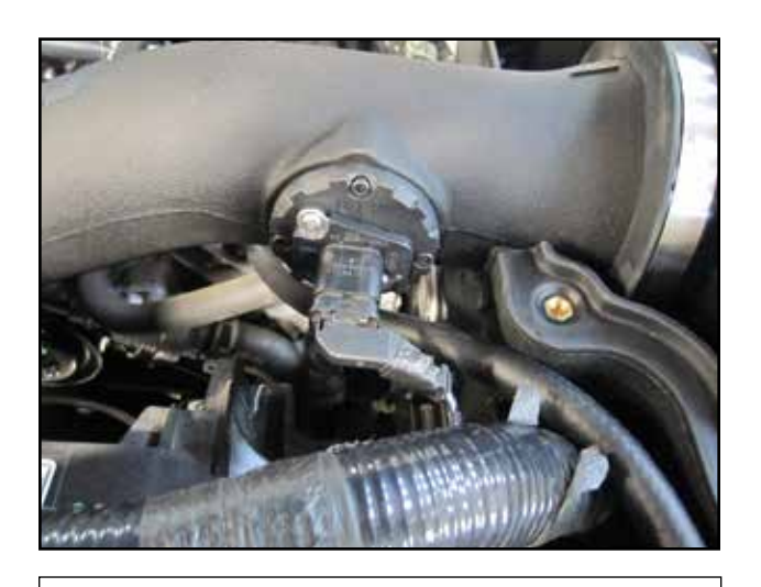
z. Plug in the MAF or IAT sensor.