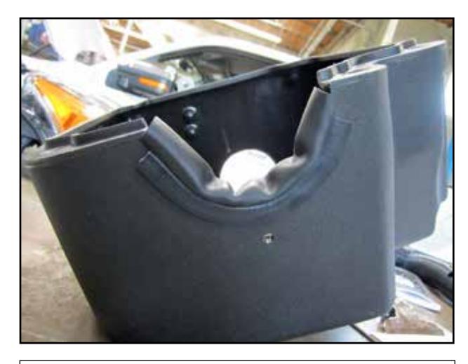
f. Install the provided bulb seal (Y) on the u-shaped hole of the AEM lower air box (V).