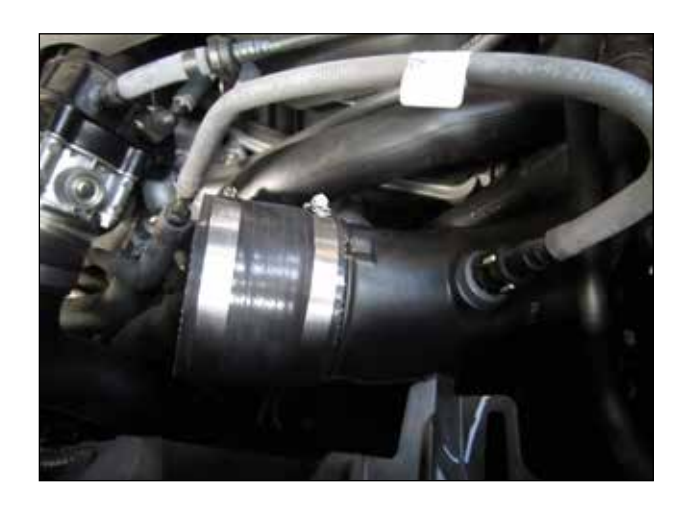
w. Install coupler (R) and the two hose clamps (AB) onto the driver's side turbo inlet tube.