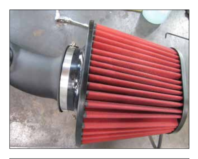
t. Install the filter (R) and #80 clamp (O) onto the filter grommet as shown.