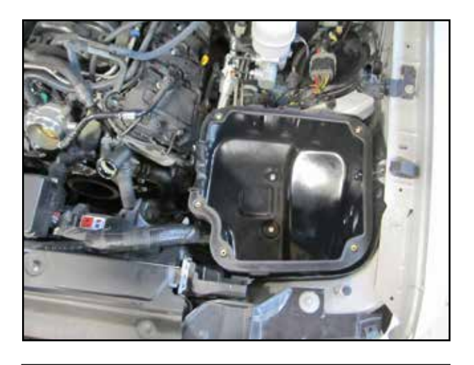
h. Install the AEM lower air box (V) and secure it to the barb mounts with two M6 bolts (N) and washers (M) provided.