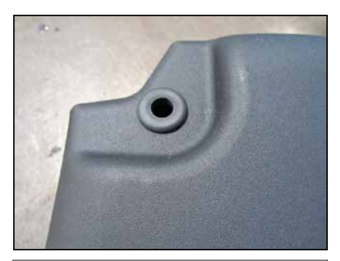
aa. Install the filter minder grommet (E) in the AEM air box lid (W).