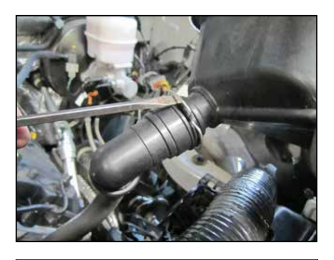
s. Remove the clip from the lower coolant hose fitting.