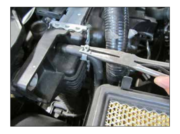
p. Remove spring clamp from the radiator overflow.