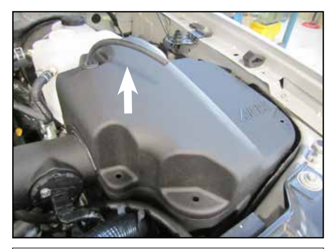
cc. Feed the filter minder hose (T) up through the grommet in the upper air box and place it on top of the lower air box.