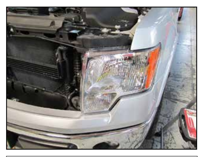
ff. Plug in the three connectors from the headlight assembly and reinstall the headlight. Secure it with the three bolts removed in step 2k.