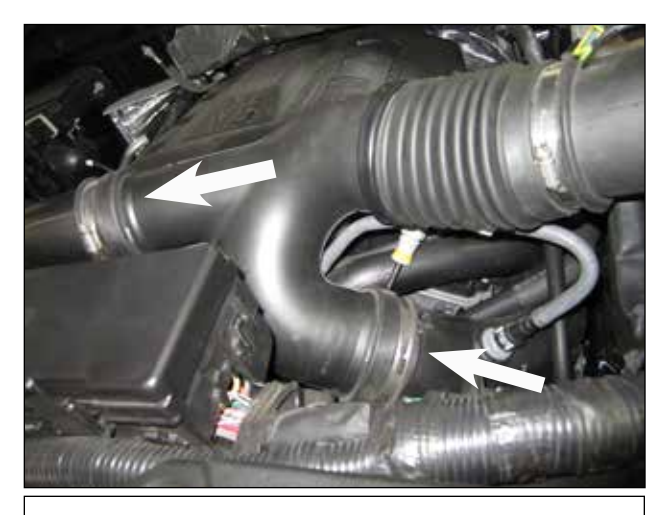
e. Loosen the clamp at the throttle body.