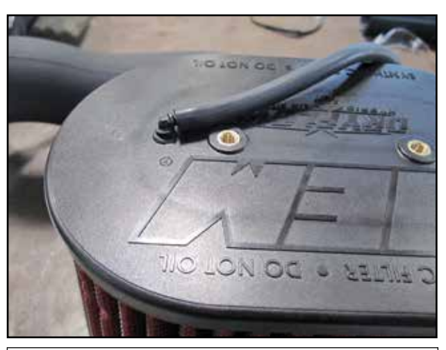
s. Install the supplied 1/8" grommet (AF), barb (AA), and hose (T).