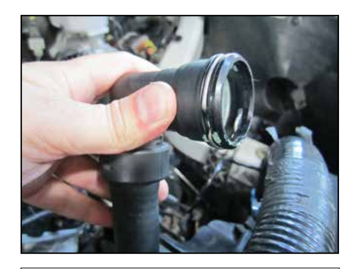
u. Reinstall the clip on the coolant hose fitting.