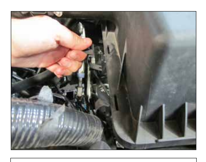
g. Disconnect the clips holding the air box together.