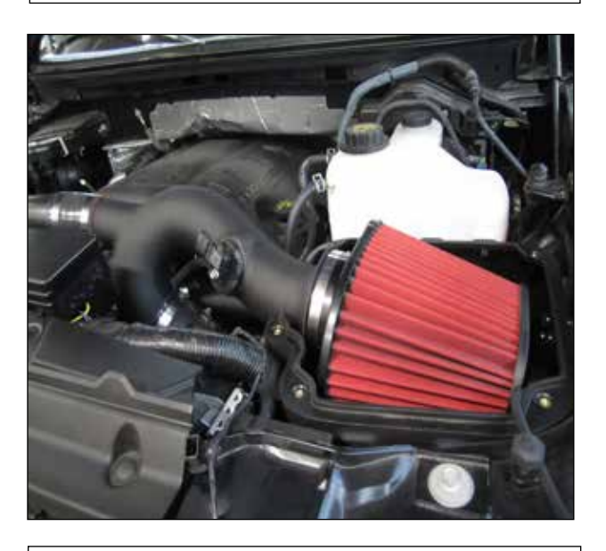
y. Install the pipe assembly as shown and tighten the clamps.