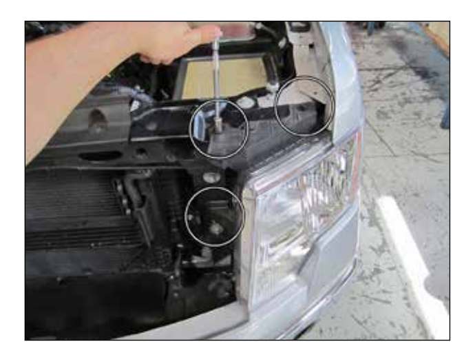
k. Remove the three bolts securing the left headlight.