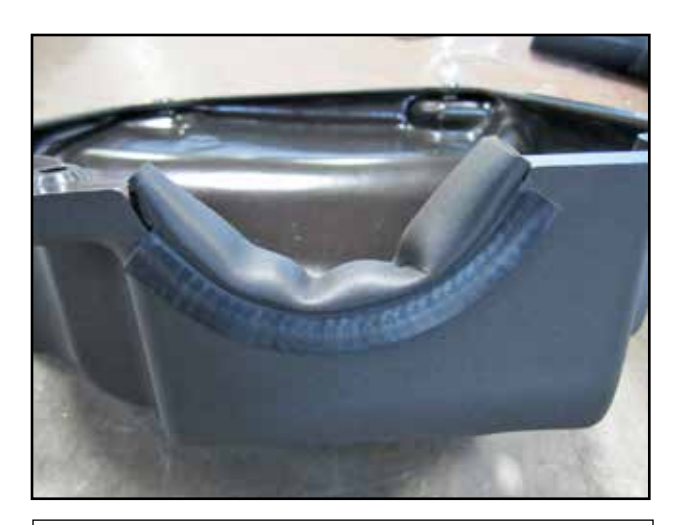
bb. Install the bulb seal (X) and (Y) around the U-shaped opening on the AEM air box.