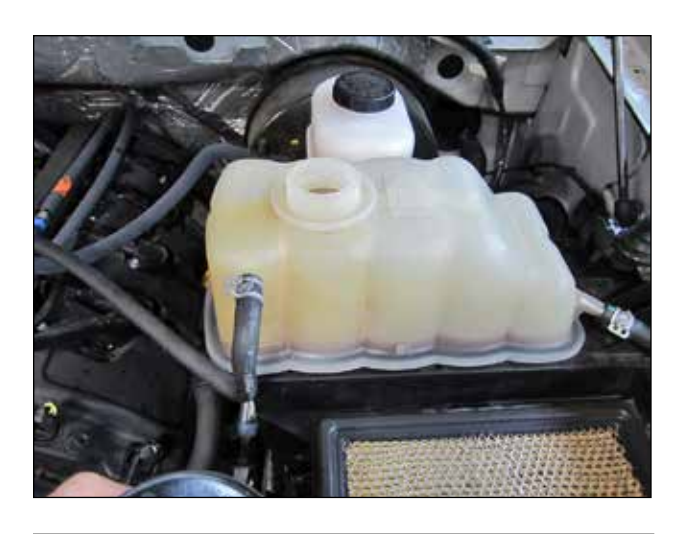
I. Remove the coolant cap.