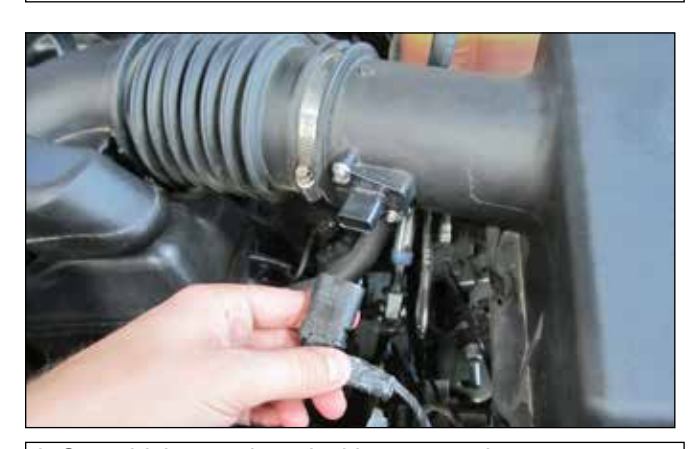
d. On vehicles equipped with a mass air sensor, release the red locking tab and then disconnect the mass air sensor electrical connection. On vehicles equipped with a tempature sensor, disconnect the electrical connection and then unhook the wiring harness from the stud.