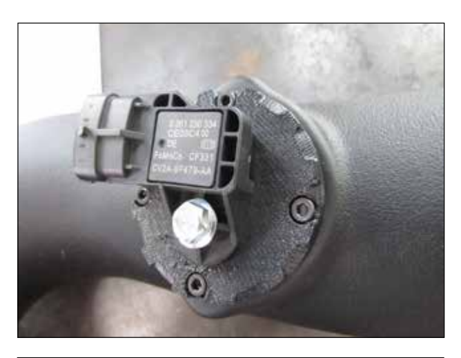
v. For Trucks using a IAT sensor install the OEM sensor with the supplied M6 Bolt (AD).