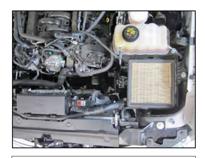
h. Remove the stock intake tube and air box lid.