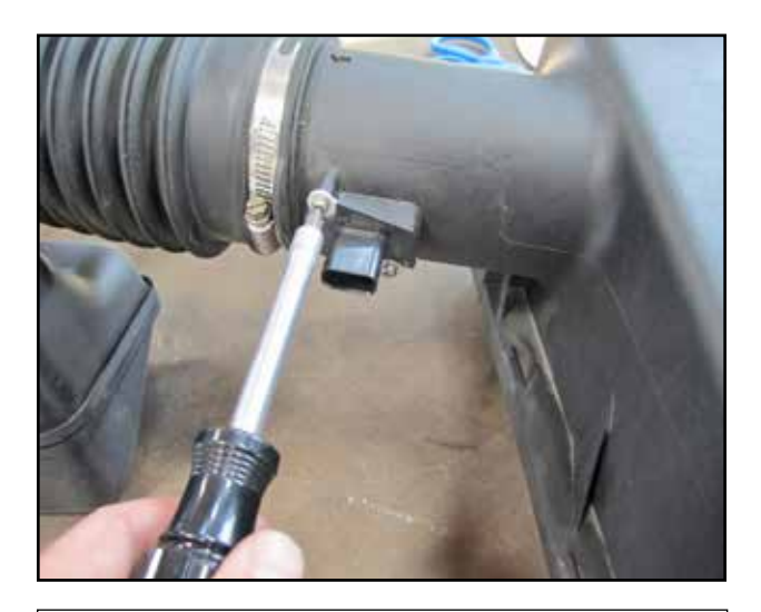
j. Remove the MAF sensor and set it aside for future use.