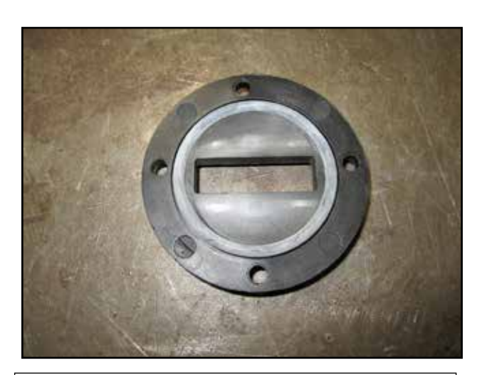
o. Install the O-ring (D) into the AEM MAF or IAT pad (C) or (AE) as shown.