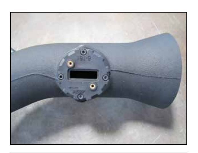
p. Install the AEM MAF or IAT pad onto the inlet tube (P) and secure it with four M4 bolts (I).