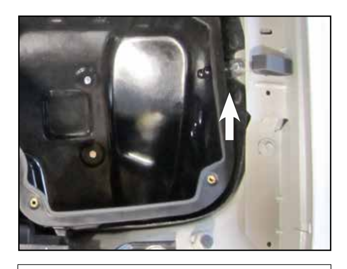
j. Secure the AEM lower air box bracket (H) to the fender support with the provided M8 bolt (K).