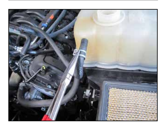
o. Remove spring clamp from the coolant reservoir.