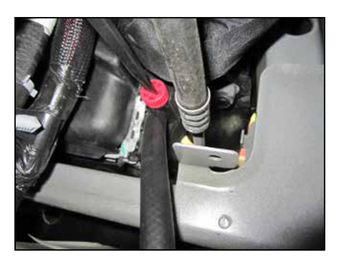
m. Drain 1.5-2 gal of coolant from the drain at the lower right corner of the radiator. Use the supplied 3/8" hose to route the coolant into a clean container to be added back into the system. Remove the hose when done draining, and keep it to be used later.