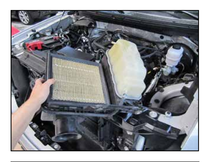
r. Lift the stock coolant reservoir and air box.