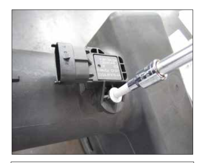
i. Remove the Intake air temp sensor using a 4mm socket to remove the stud holding the sensor. For vehicles using a MAF sensor move on to step J.