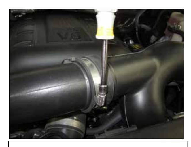
f. Loosen the top clamp on the intake tube.