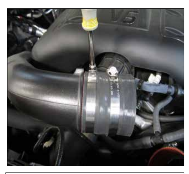
x. Install coupler (Q) and the two hose clamps (Z) onto the passenger side turbo intet tube.