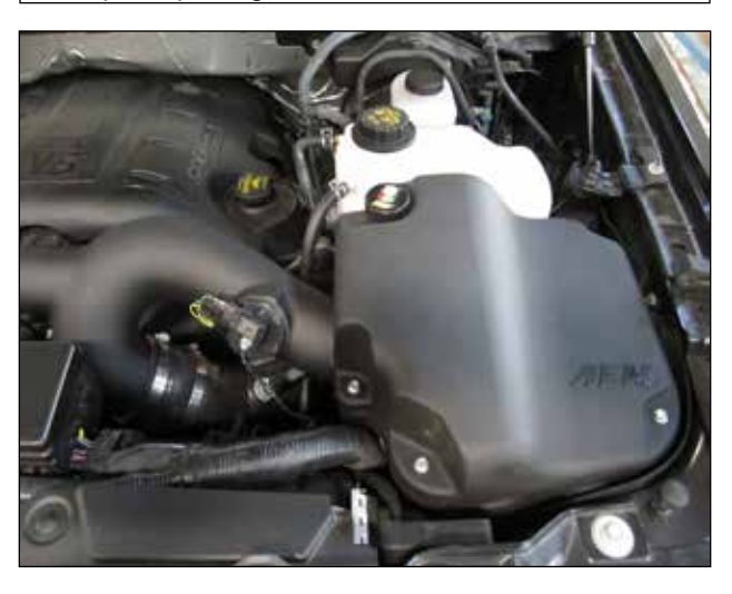
dd. Plug the filter minder hose onto the filter minder(F) and press it into the grommet on the upper air box. Secure the upper air box with the five supplied M6 bolts(G).