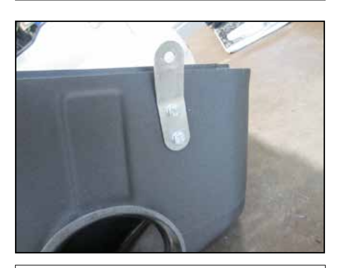
e. Install the bracket (H) using the two M6 bolts (N) on the AEM lower air box (V).