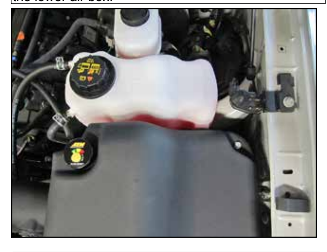
ee. Refill the coolant drained in step 2m and check for leaks, then secure the cap.