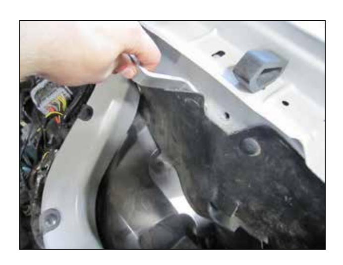
v. Remove six clips and remove the rubber inner fender liner.