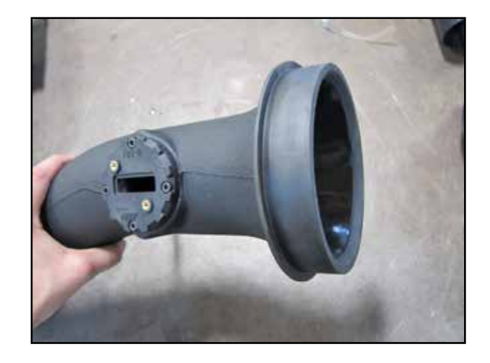
q. Install the filter grommet (B) by stretching it over the end of the inlet tube (P).