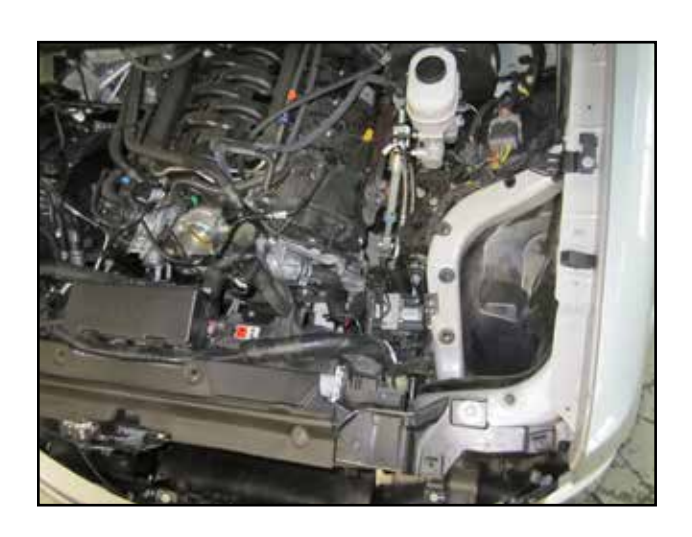
t. Disconnect the coolant hose and remove the stock coolant reservoir and lower air box.