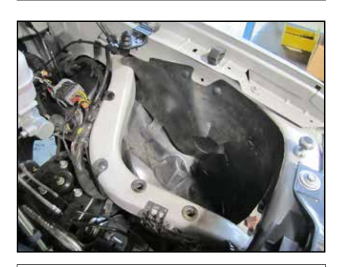
d. Reinstall the inner fender liner.