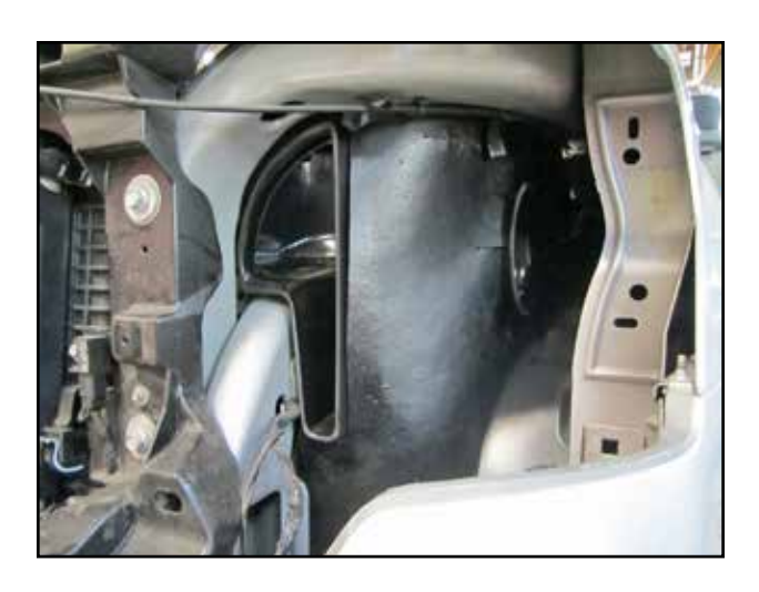
i. Make sure that the side inlet scoop is protruding through the inner fender liner as shown.