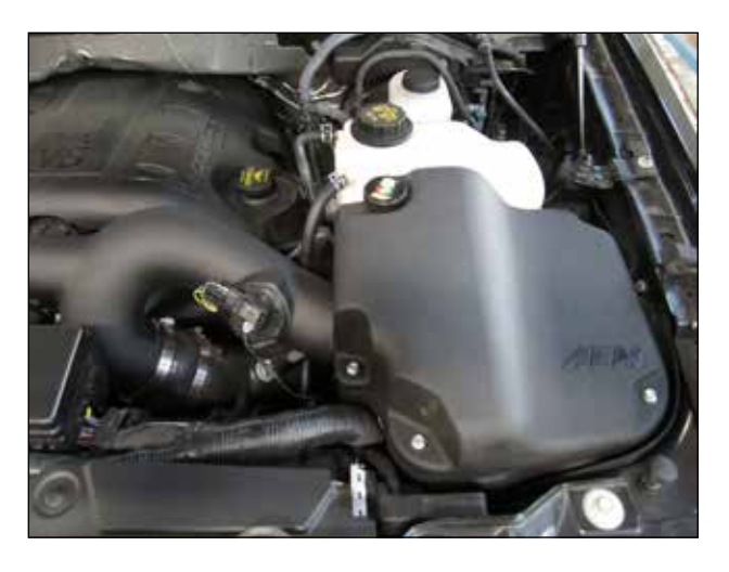
gg. Make a final check for fitment and adjust as necessary. Once the vehicle has warmed up, check for any coolant leaks.