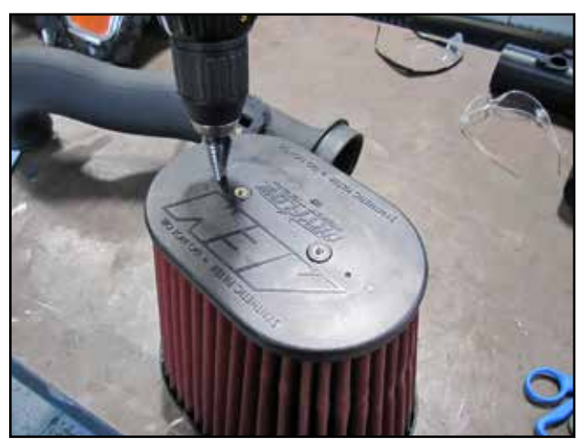
r. Drill a ¼" diameter hole in the filter cap at one of the dimple locations, be sure to remove any plastic shavings from the inside of the filter.