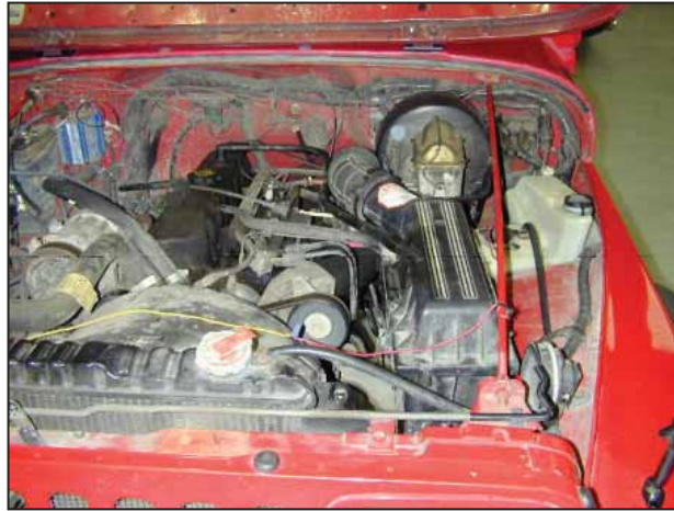
Factory air box system installed