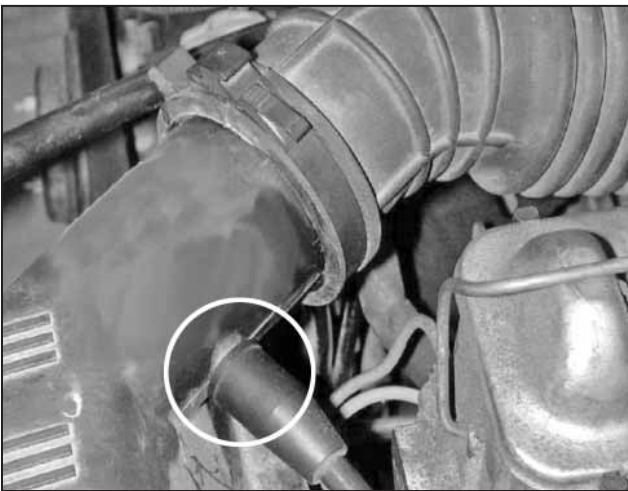
c. Disconnect the charcoal canister breather hose from the air filter housing.