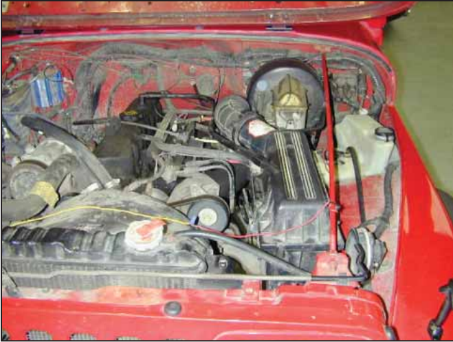
a. Factory air box system installed.