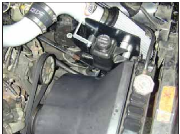
AEM® intake system installed with Power Steering