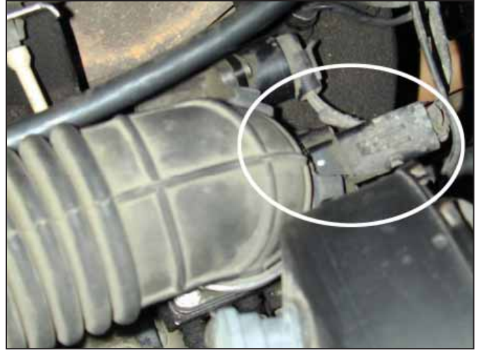
b. Loosen the plastic hose clamps on the rubber intake tube attached to the throttle body. Do this by pulling the two plastic tabs on the hose clamp apart. Disconnect the intake tube from the throttle body.