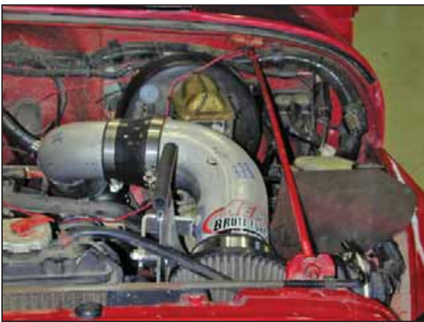
AEM® intake system installed without Power Steering