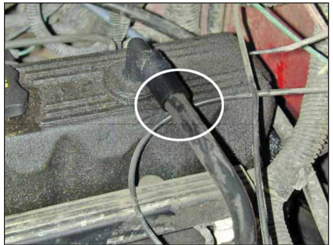
d. Remove the breather hose connecting the valve cover to the air filter housing.