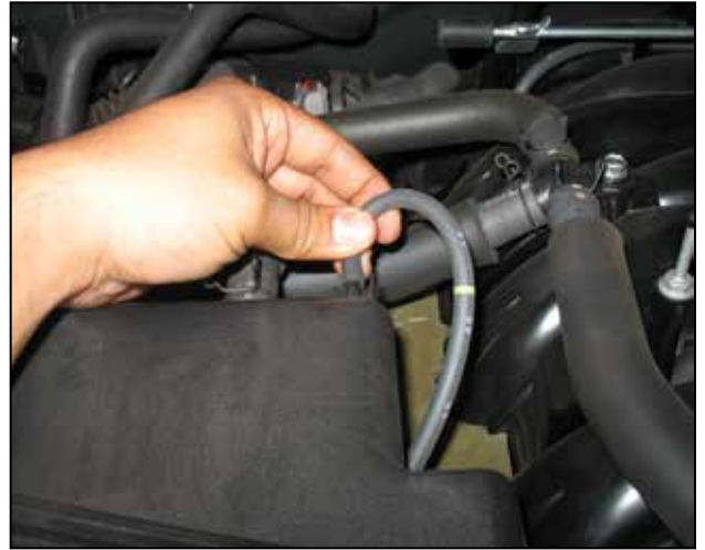
b. Remove the small hose located on the back of the inlet resonator.