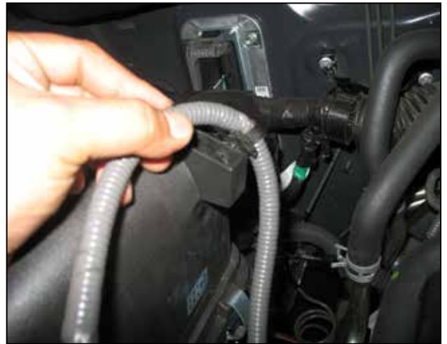
d. Release the zip tie from the airbox lid. Unplug the wire harness plug from the mass air flow sensor.