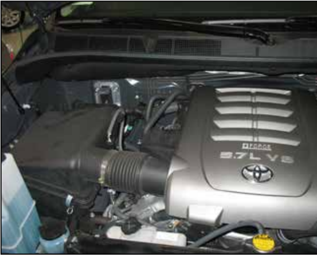
a. Factory airbox system installed.