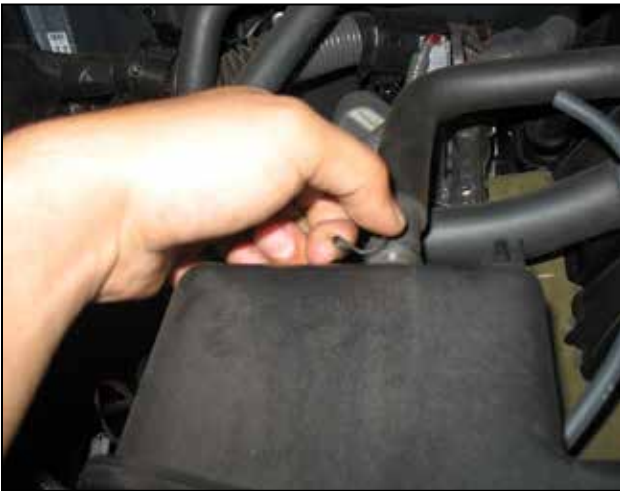
c. Pinch the hose clamp, and remove the larger hose from the inlet resonator.