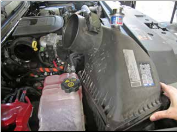
e. Pull up on the stock filter air box starting on the side closer to the engine to “pop” it free from its mounting grommets. Remove the air box assembly from the engine bay.