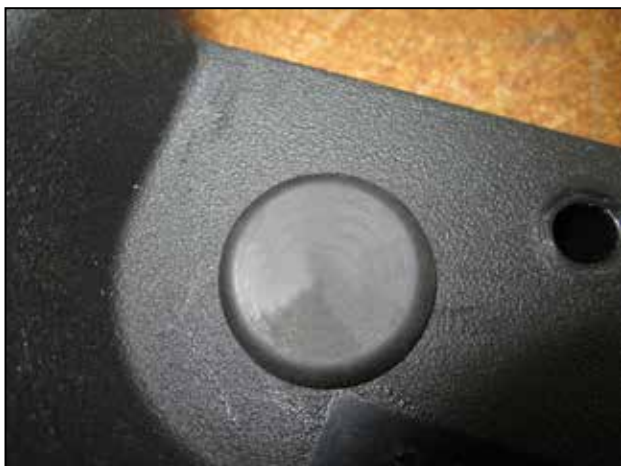
v. Install the plug into the 0.75" hole in the corner of the air box lid as shown.