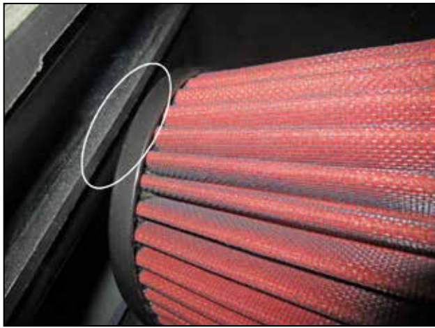
s. Rotate the lower intake tube and filter assembly until the edge of the filter cap lines up with the top edge of the air box opening near the fender as shown.