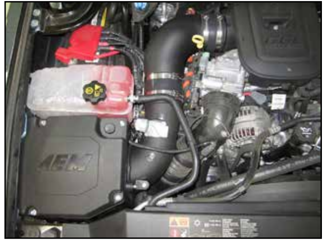
AEM® intake system installed.