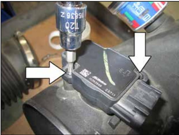
g. Using a T20 Torx bit, remove the 2 screws retaining the MAF sensor to the upper air box lid. Remove the sensor for use with your new AEM® cold air intake. Make sure the O-ring is intact on the sensor.