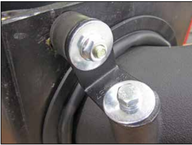
r. Install one flat washer, one split washer, and one M6 hex bolt through the "L" bracket slot and into the mounting boss in the lower intake tube. Tighten the bolt and the hex nut with a 10mm socket.