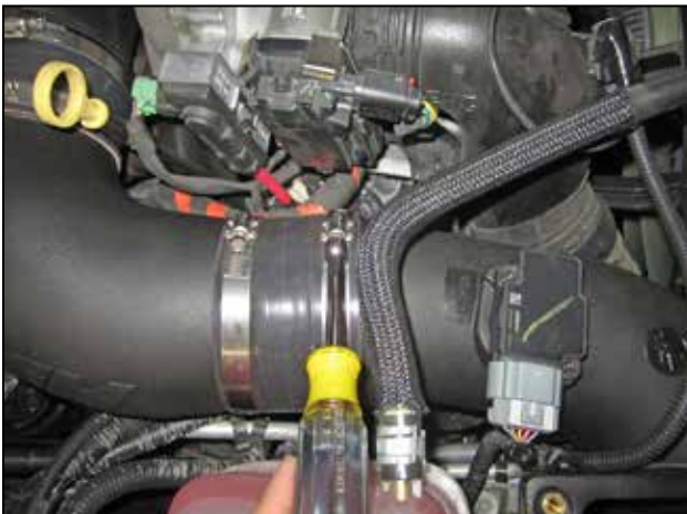
t. Tighten the hose clamp at the silicone hose connecting the lower intake tube to the intake elbow.