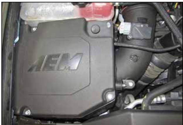
w. Install the air box lid onto the air box as shown using the M6 hex/flange bolts provided. Start all 4 bolts by hand first and then tighten them with a 10mm socket to seal the air box.