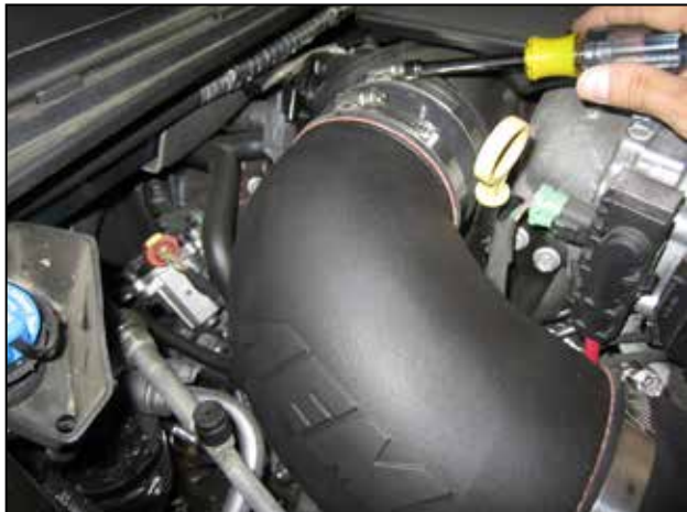
u. Fully seat the silicone hose at the engine intake port and tighten the hose clamp. The intake tube and filter installation is now complete. You are now ready to seal the air box.