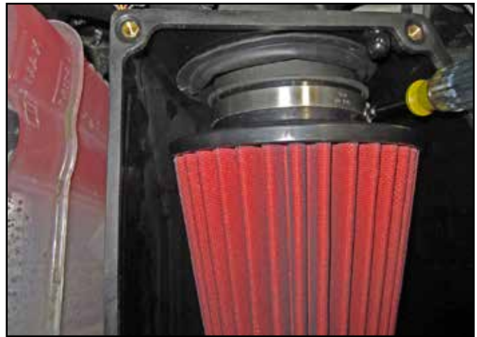
o. Fully seat the AEM® air filter onto the lower intake tube inlet and align it vertically as shown. Tighten the hose clamp at the air filter base.