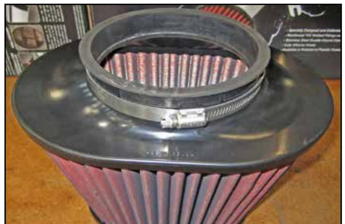
k. Install the large hose clamp provided onto the AEM® DRYFLOW® Air Filter; then, Install the air filter base adapter into the outlet of the AEM® DRYFLOW® Air Filter.