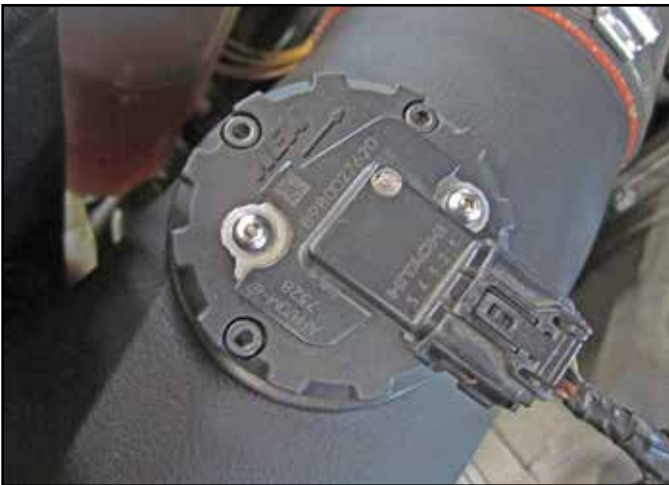
n. Re-connect the mass air sensor, fully seating the connector to lock it.