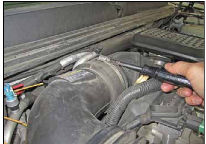
b. Loosen the two hose clamps retaining the stock intake tube, then remove the stock intake tube from the air box and the engine intake port.