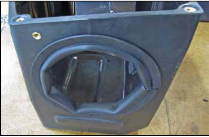
f. Install the bulb seal around the inside of the outlet hole on the 9-0406 air box as shown. Trim excess as needed.