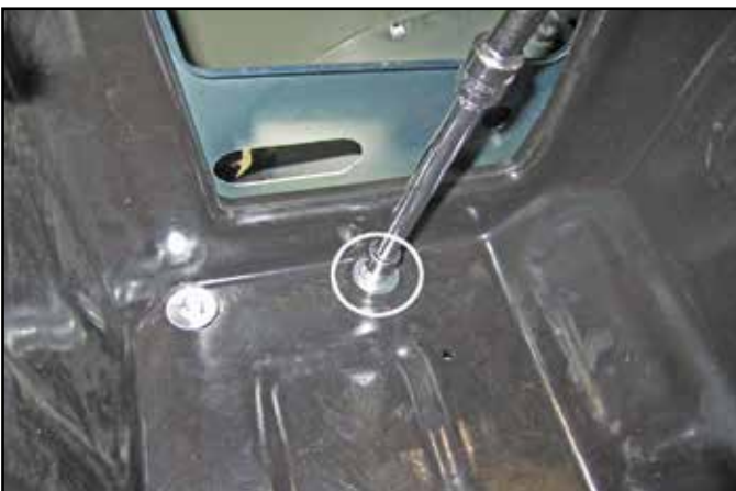
j. Install a M6 X 25mm bolt with a flat washer in the remaining mounting hole near the inlet window and tighten the bolt. Note that the large air inlet window is aligned with the smaller stock air inlet window in the vehicle fender.