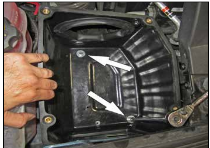
i. While pulling the air box toward the stock coolant reservoir to align the air box, install two M6 X 25mm bolts with two flat washers at the two mounting holes shown. Ensure the air box inlet window is aligned with the stock air inlet window in the sheet metal fender liner. Tighten the two bolts.