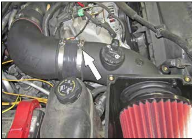
p. Install a #9472 hose clamp on the silicone hose already mounted on the intake tube elbow. Install the lower intake tube into the silicone hose. Do not fully tighten the hose clamp.