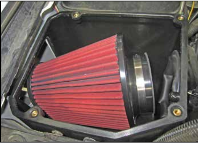
l. Place the AEM® Air Filter assembly into the air box as shown.