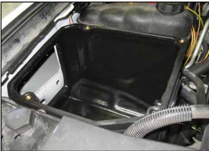
h. Place the air box into the engine bay into the stock location as shown. Ensure the new left front mounting grommet is lined up with the threaded hole in the engine bay.