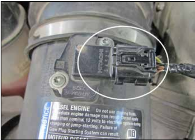
a. Depress the locking tab on the mass air sensor, then disconnect the mass air sensor.