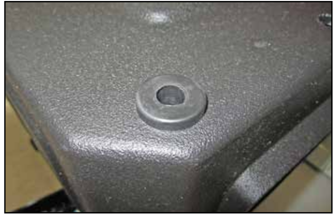
g. install the 784647 grommet into the larger left front mounting hole as shown.