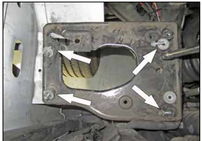
d. Using a 10mm socket, remove the four bolts retaining the stock air box mounting plate. Remove the mounting plate.