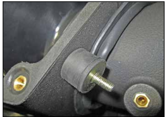
q. Install the rubber isolator stud mount into the 6mm insert on the side of the airbox as shown. Tighten by hand.