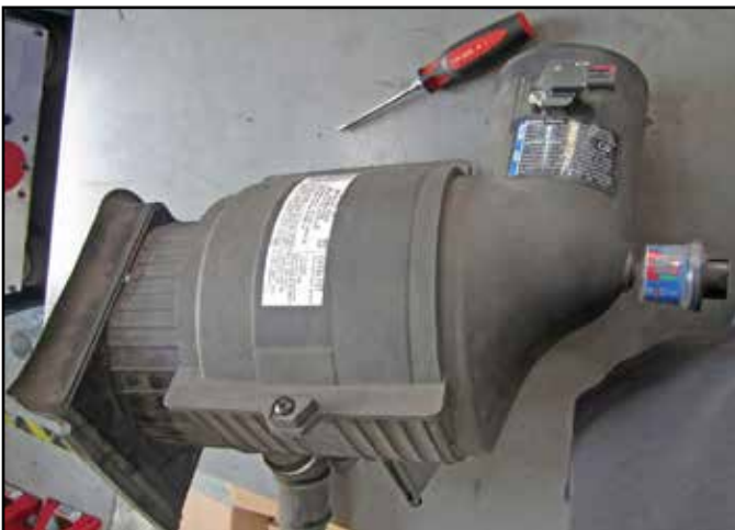
c. Pull up firmly on the stock air box starting on the side closest to the engine to dislodge it from the mounting grommets. Remove the air box from the engine bay.