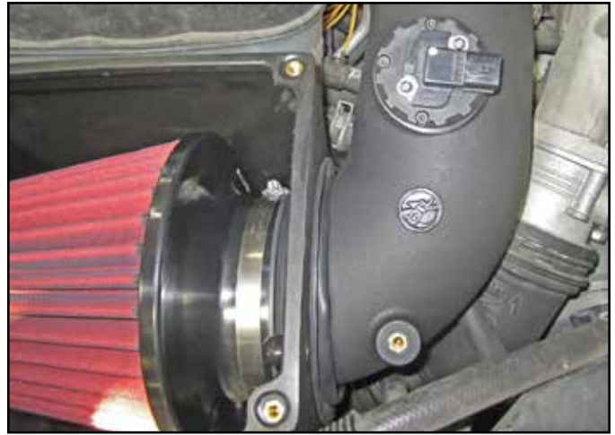
m. Loosely Install the lower intake tube through the bulb seal and into the air filter assembly as shown.