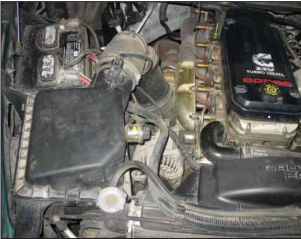
Factory air box system installed

t. Ensure the intake pipe is centered in the heat shield hole. Once proper fitment is achieved, tighten the nuts on the bracket and the hose clamps on the intake pipe and turbo.