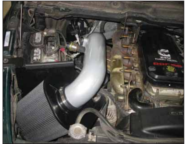
AEM® intake system installed