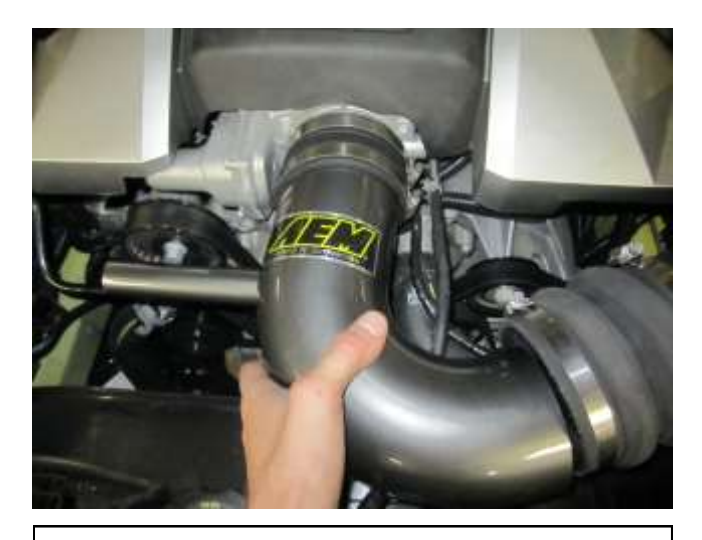
e. Install the intake tube into the throttle body coupler.