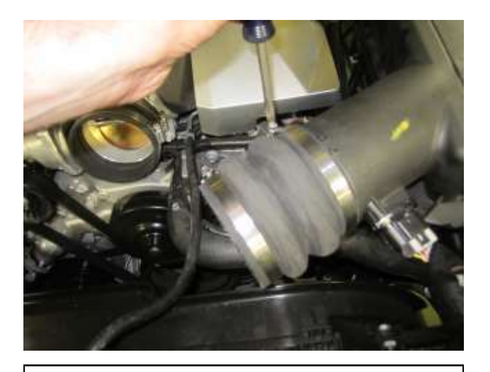
d. Install the hump hose (5-1090) with the two supplied hose clamps (9464) onto the air box inlet. Note: Some mild soap and water mixture may be used to ease installation \, .