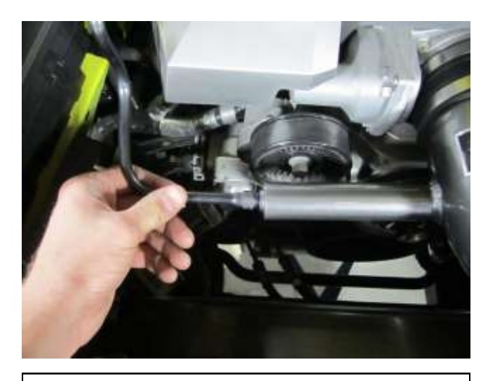
h. Install the plastic breather pipe that was disconnected in 2a. into the AEM intake.