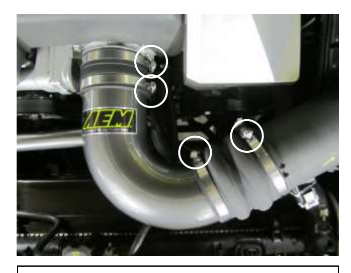
g. After proper intake tube orientation has been achieved, tighten all four hose clamps.