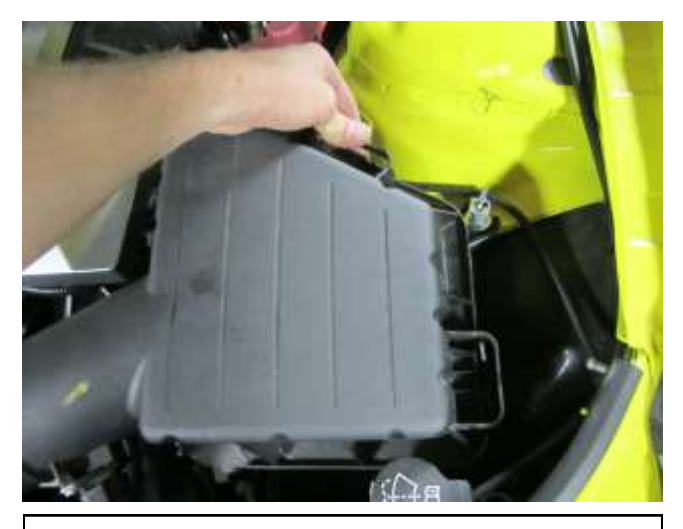
e. Unclip the two tabs retaining the air box lid and remove the lid to expose the stock air filter.