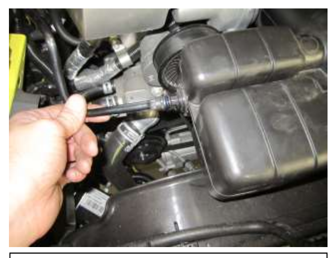
a. Disconnect the plastic breather pipe from the side of the factory intake resonator.