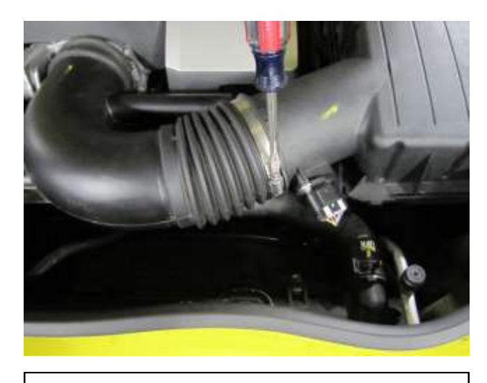
c. Loosen the hose clamp at the air box.