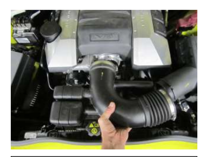
d. Remove the stock intake from the vehicle. NOTE: Do not discard any of the factory intake components.