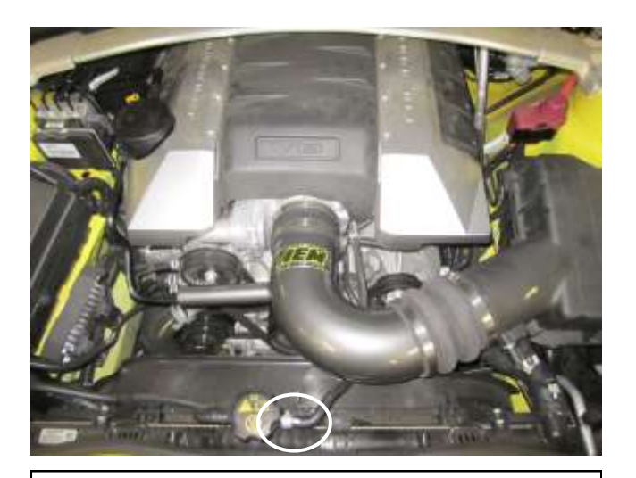
f. Install the other end of the intake tube into the hump hose coupler. Note: Due to factory tolerances, the coolant recovery hose may need to be adjusted to not interfere with intake tube.