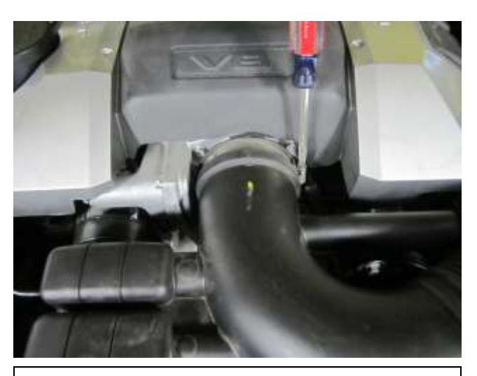
b. Loosen the hose clamp at the throttle body.