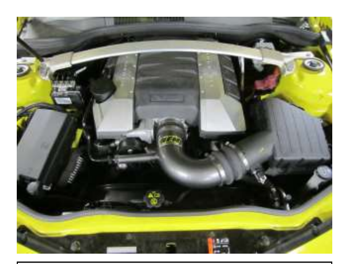
AEM® intake system installed