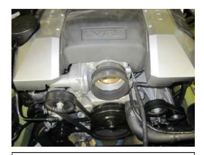
c. Install the coupler (341018) with the two provided hose clamps onto the throttle body. 9460 goes on the throttle body, 9464 goes on the AEM Intake tube.