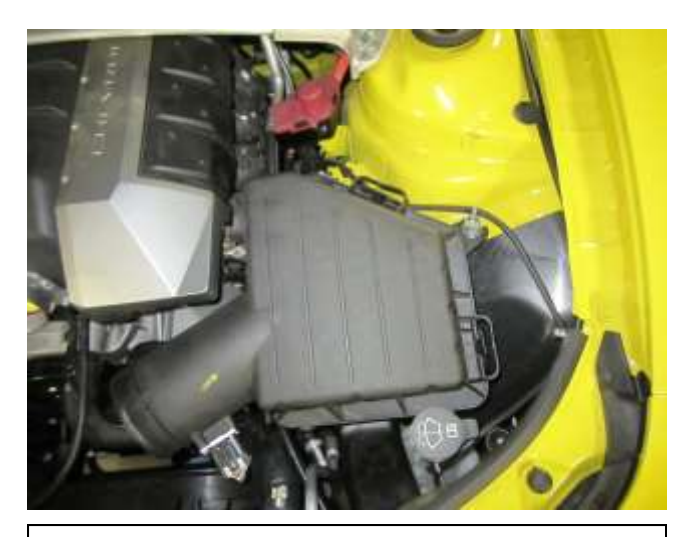
b. Install the air box lid back onto the air box base making sure the tabs latch.