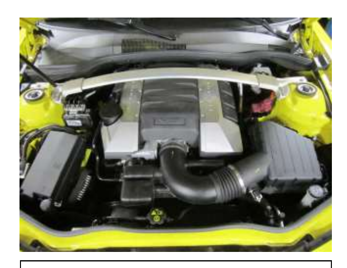
Factory air box system installed