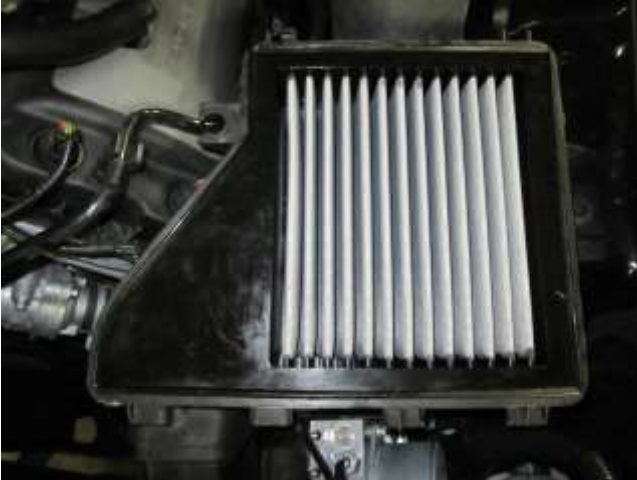
a) Install the AEM filter into the air box.