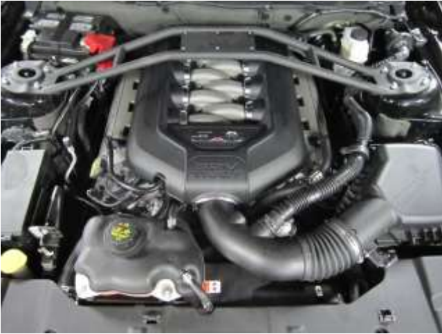
Factory air box system installed