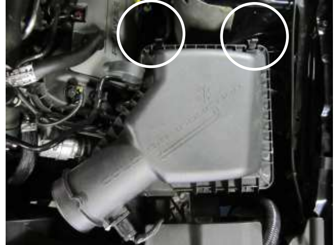
b) Re-install the air box lid and reattach the clips that were previously unclipped in 2f.