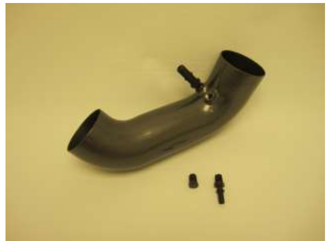
d) Screw in the fitting (082628) into the top port. For the bottom port reference your transmission below: Manual Transmission— Use the plug(08032). Automatic Transmission—Use fitting(08938). Note: Hand tighten fitting until tight, then add a quarter turn with a wrench.