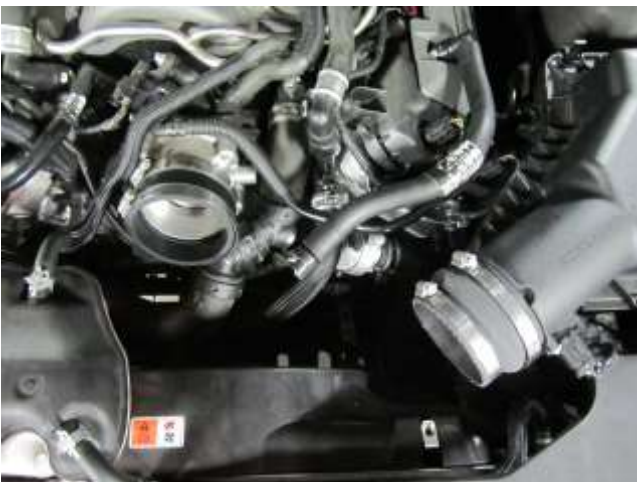
c) Install the couplers onto the throttle body (08654) and the air box (5-1083) with the provided hose clamps (9456).