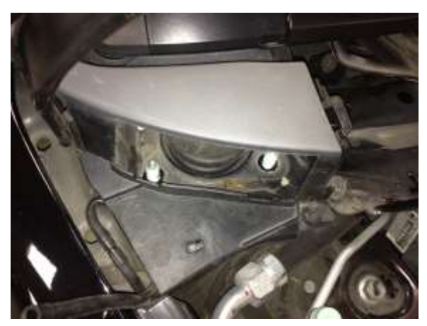
e. Using a 14mm socket, remove the (2) strut tower bolts, as shown.