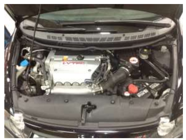
a. Always use care when removing plastic under hood fasteners and trim, as these pieces break easily.