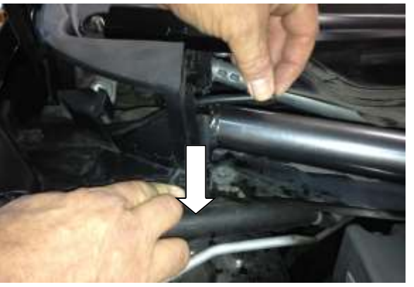
d. Make sure the windshield washer tubing is not pinched between the finisher and the strut tower bar.

c. Using a 14mm socket, replace the strut tower nuts.