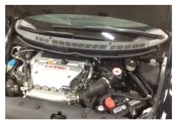
e. Replace the factory plastic finishers, in the opposite order as disassembly.