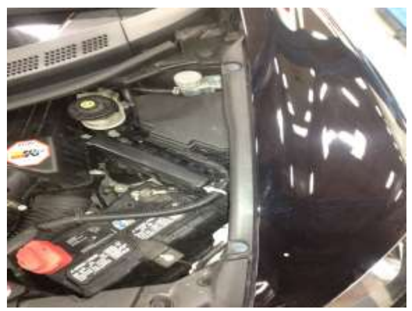
c. Pull the 3 plastic fasteners holding the passenger side fender finisher, and remove the finisher.