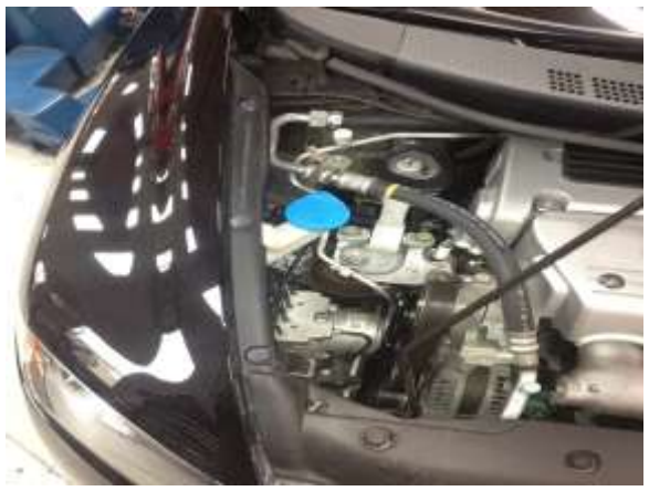
Pull the 3 plastic fasteners holding the drivers side fender finisher, and remove the finisher.