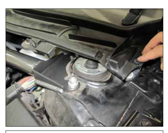
b. Reinstall the plastic clip and 10mm bolt to fasten down the upper plastic fascia.