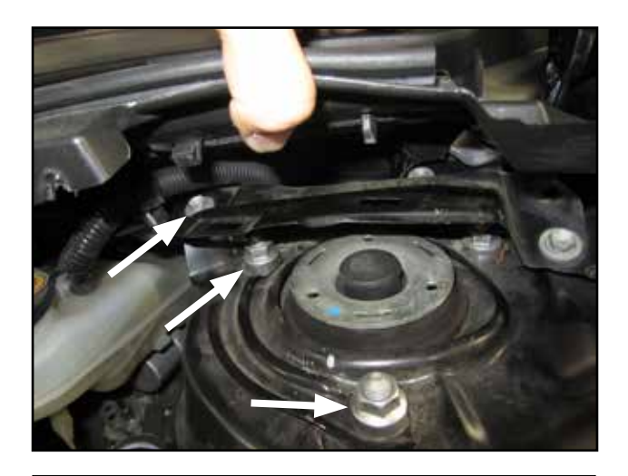
b. Remove the 10mm bolt and two 14mm nuts securing the strut bracket on both front strut tops