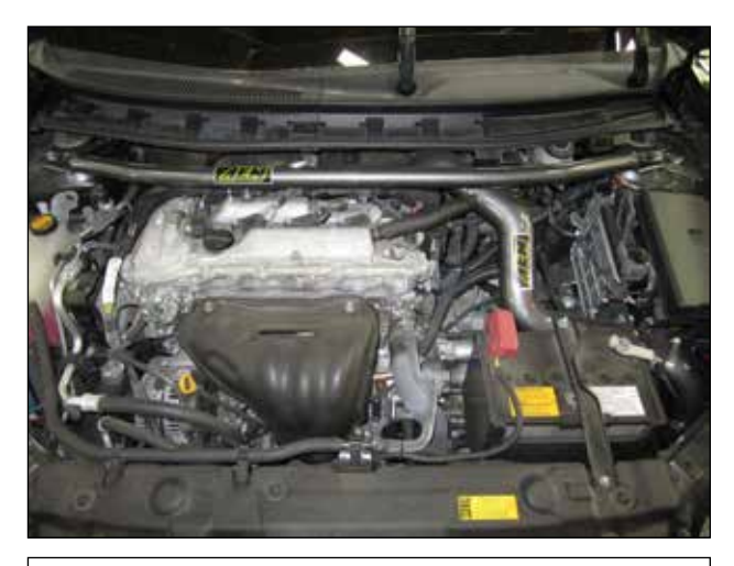
c. AEM Strut Bar installed.