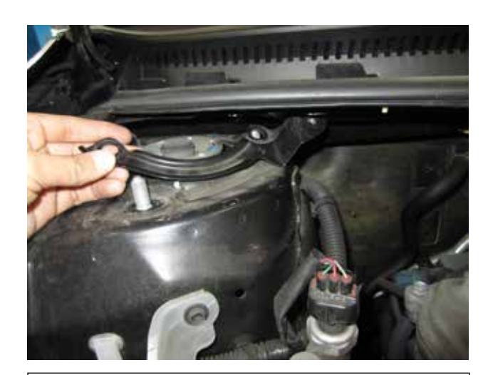
c. Remove the black mounting brackets on each strut top location.