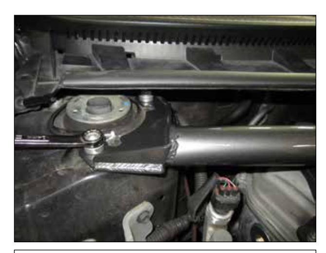
a. Use the two 14mm nuts previously removed to secure the AEM strut bar as shown.