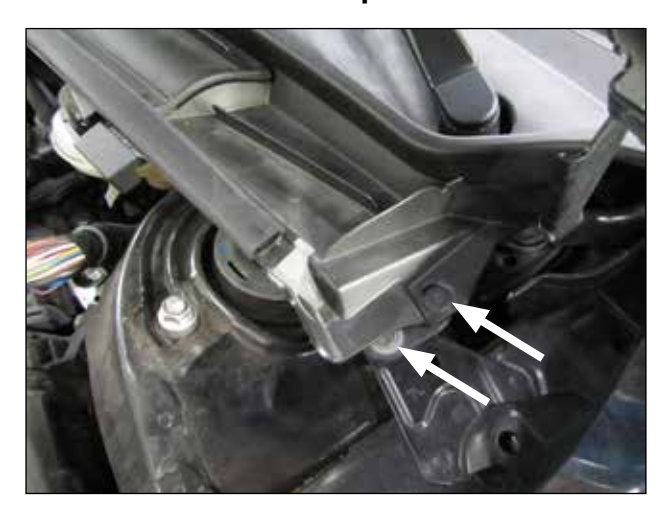
a. Remove the plastic clip and 10mm bolt shown on both the driver and passenger sides above the front strut tops.