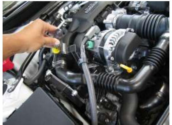
b. Loosen hose clamps on intake sound creator and throttle body. Disconnect plastic tube from sound creator.