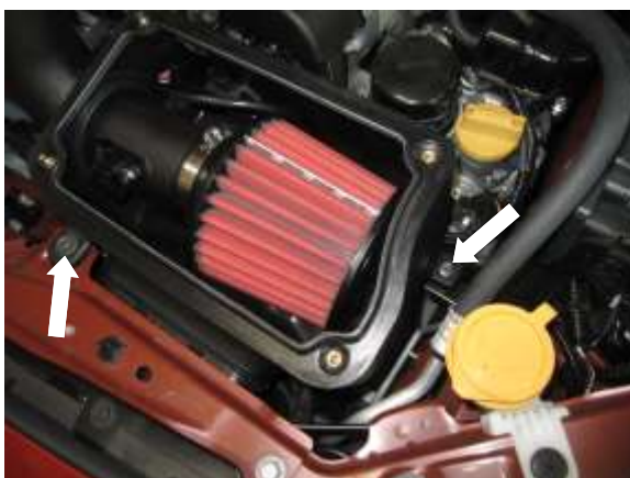
i. Fasten upper airbox mount with stock bolt removed in step 5 of removal instructions and use hex flange bolt(P) to secure lower right airbox mount.