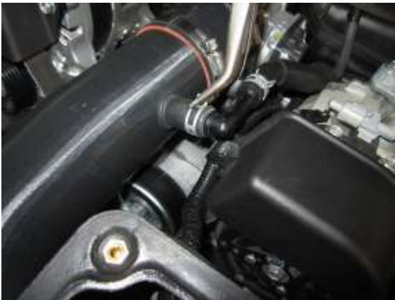
m. Install PCV adapter(H) onto intake tube hole located near AEM logo. Insert plastic elbow into adapter and fasten using stock spring clamp.