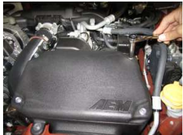
n. Line lid(C) up with airbox and fasten down with hex flange bolts(N) provided.