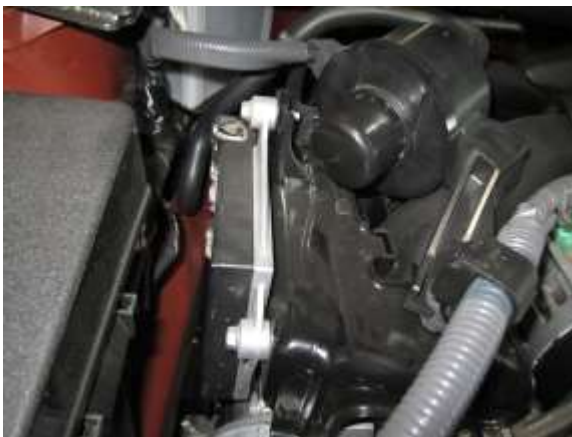
o. Install supplied vinyl cap(Q) over inlet of sound creator.