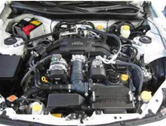
a. Stock intake system