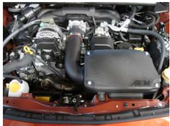
p. AEM intake installed.