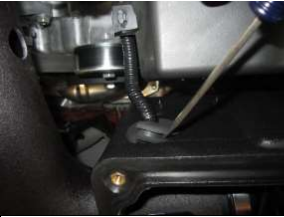
k. Insert MAF wire harness into slit grommet(M) provided and carefully install into rear side of airbox using flathead screwdriver. Relieve any excessive tension at MAF plug with additional wire slack inside airbox.