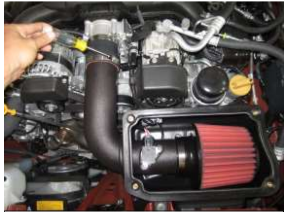
l. Rotate intake tube to line up with throttle body and slide coupler over throttle body. Ensure adequate clearance around cone filter and adjust tube position accordingly prior to tightening hose clamps on coupler. Connect ETI module plug to MAF sensor.