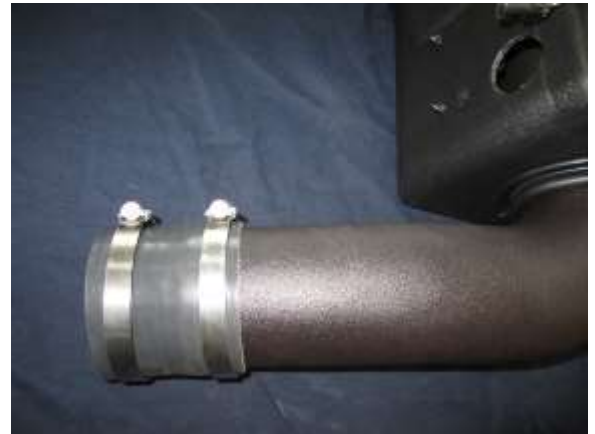
f. Use mild soap/water solution to slide coupler(E) over other end of intake tube along with 2 hose clamps(F) provided.