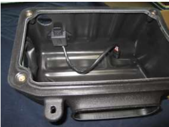
c. Use plastic tree mount clips(G) to secure ETI module(L) along inside of box making sure male end is pointed upwards as shown.