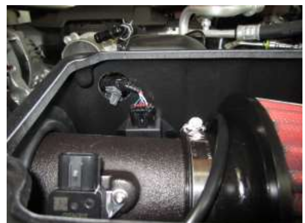
j. Insert MAF connector through rear hole of airbox and connect to ETI module.