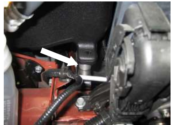
h. Slightly lift rear of airbox and insert spacer(O) between stock mounting stand and airbox mount feature.