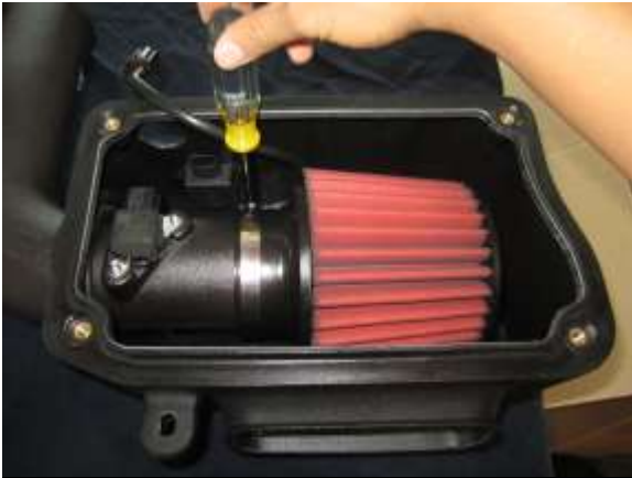
e. Place air filter element(D) inside airbox with hose clamp(J) and slide onto intake tube. Ensure tube is fully seated within filter base and fasten hose clamp.