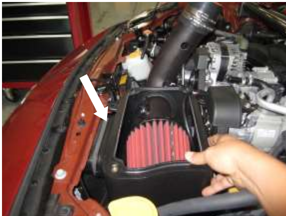
g. With intake tube pointing up, carefully install airbox, lining up stock inlet duct within AEM airbox inlet provision.