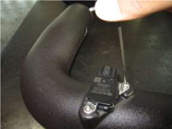
a. Install MAF sensor into intake tube(B) and secure with M4 button screws provided(K).