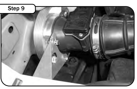
Position the intake assembly on to the support bracket and mount the assembly with the M6 screws.

Mount the air filter support bracket on the inside of the radiator core support. There is existing screw that support the wiring harness and a open hole next to it use the factory screw and the supplied M6 screw and nut. (If your truck does not have this extra hole you will need to drill a 1/4" hole in this location)