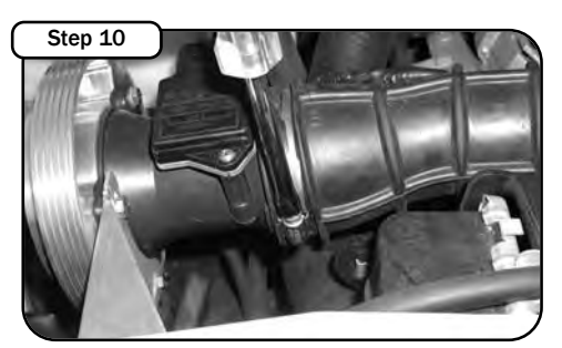
Reconnect the MAf sensor and tighten down the hose clamp.