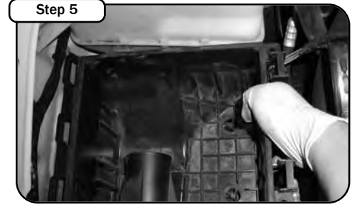
Lift up and remove bottom half of air box.