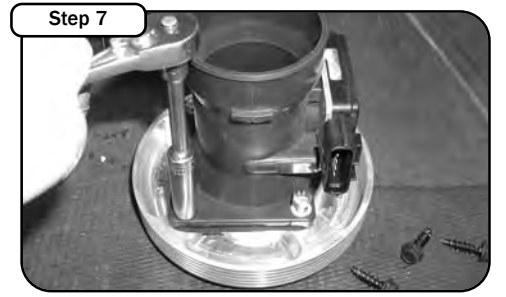
Mount the MAf sensor to the billet adapter using the four supplied M6 screws and washers.

Remove MAF sensor from the upper portion of the airbox by removing the four 10mm screws.