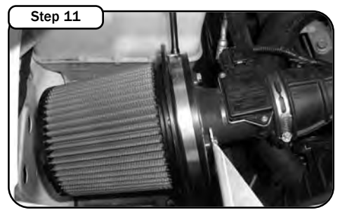
Install the pre-oiled filter in the housing and tighten down clamp. DO-NOT use any oil or grease. Install the housing trim seal on the sides of the panel.