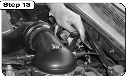
Slip vent breather hose onto cap nipple.