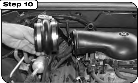
Install hump coupler to throttle body cap. Tighten clamp at cap side only.