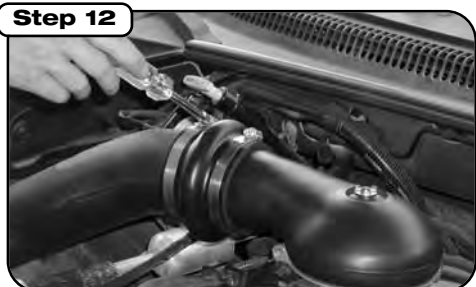
Tighten clamp at intake tube side of hump coupler. DO NOT OVER TIGHTEN.