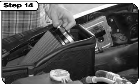
Install filter onto intake tube and tighten clamp. DO NOT OVER TIGHTEN.