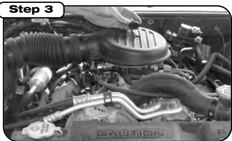
Remove cap nut from top of hat.