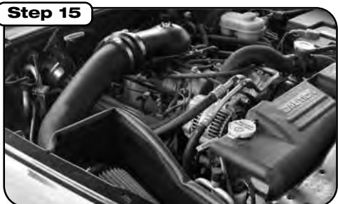
Place enclosed CARB EO sticker on a clean/smooth surface on or near the intake system. EO identification label is required in passing Smog Check inspection. Make sure all hoses and clamps are tight and that all electrical components are secure.