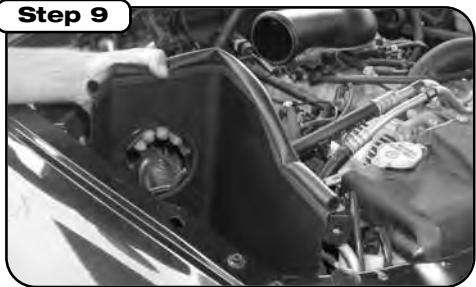
Before installing housing place large trim on top edge of filter housing and small trim on around small hole on housing. Mount filter housing using hardware A, B (supplied) and C from step 8.