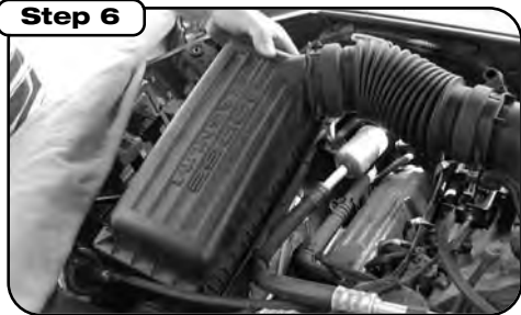
Pull out OE intake system from the rubber mounts. Pull upward.