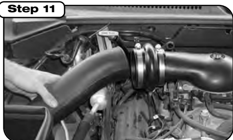
Install intake tube by sliding through housing first and then into hump coupler.