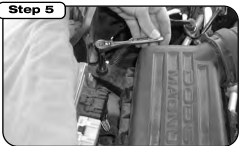
Loosen and remove bolt (one only) from OE filter box.