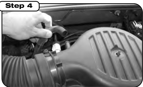
Remove vent hose from OE throttle body cap.