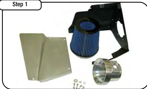
Complete kit with parts.