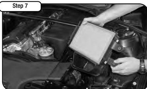
Using a 10mm socket remove the remaining bolt holding the factory intake in place, remove the lower half of the intake. Set the bolt aside for re-installation of heat shield.