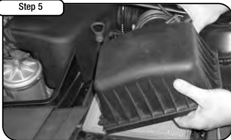
Using a standard screwdriver loosen the clamp securing intake track to factory airbox. Undo clamps securing top half of airbox and remove top half. Set aside for future removal of stock MAF sensor.