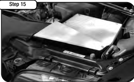
Place enclosed CARB EO sticker on a clean/smooth surface on or near the intake system. EO identification label is required in passing the Smog Check inspection. Your installation is now complete. Tighten all connections and clamps. Re-check after a few hours.