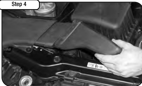
Remove front snorkel from ducting to stock airbox.