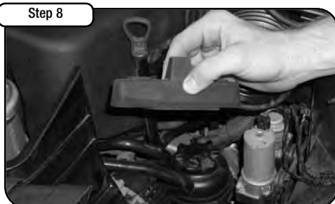
Remove rubber mount from tab beneath factory airbox.