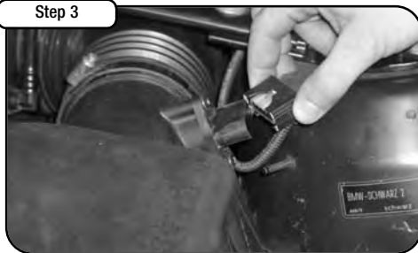
Remove factory harness from Mass Air Flow sensor and place out of the way until re-assembly.