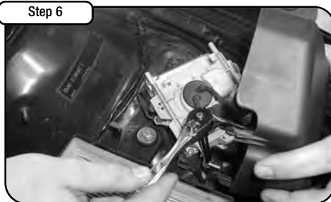
Remove plastic cover from headlight controller via locking tabs. Using a 10mm socket, remove the (2) bolts securing controller to allow for its movement and to release lower half of airbox.