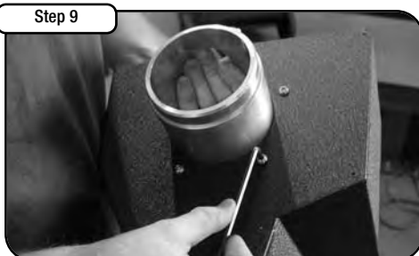
Using 4mm hex key, fasten aluminum adapter to heat shield using (4) provided M6 x 10mm button head screws.