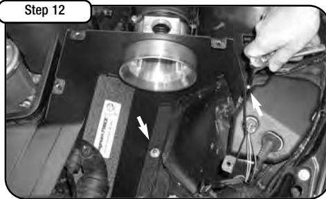
Using a 10mm socket and provided M6 nut and washer as well as original 10mm bolt, secure heat shield to engine compartment using now available mounting locations.