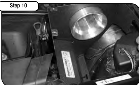
Using 10mm socket replace headlight controller using original bolts and provided spacer on lower tab. Place heat shield into engine compartment, placing slot over the bolt that originally secured the rubber mount.