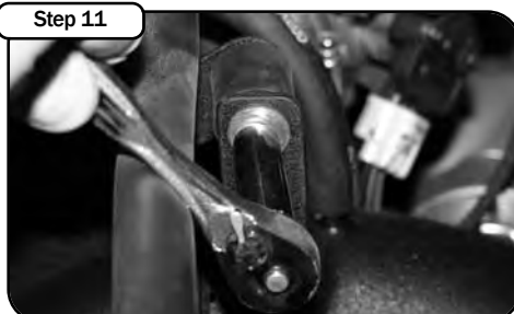
Step 11 Place the rubber vibration mount between the intake tube bracket and the housing. Tighten down with the supplied nuts and washers.