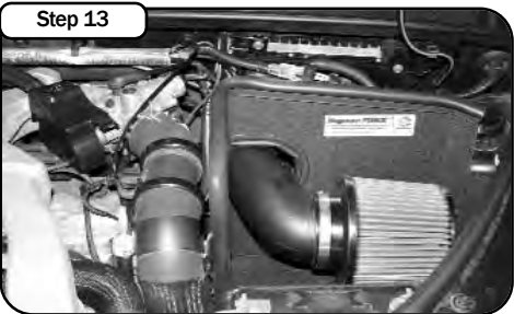
Step 13 Place enclosed CARB EO sticker on a clean/smooth surface on or near the intake system. EO identification label is required in passing the Smog Check inspection. Your installation is now complete. Tighten all connections and clamps. Re-check after a few hours.

Note: Filter Cleaning and Re-oiling: When cleaning your aFe filter, be sure to use only aFe's "Restore Kit" (aFe P/N: 90-50001 blue oil aerosol, or aFe P/N: 90-50501 blue squeeze bottle oil or aFe P/N: 90-50000 gold oil aerosol, or aFe P/N: 90-50500 gold squeeze oil). Filter Replacement: Magnum FLOW PN: 24-91016 (black w/ blue media).