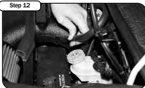
Step 12 Re-install the 15mm bolt removed in step 4. Tighten assembly down. Install new breather hose from valve cover to intake tube. Re-use the other existing vacuum tube.