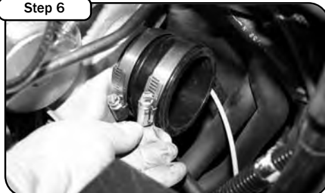
Step 6 Slide the coupler and clamps over the turbo inlet. Do not tighten the hose clamps at this time. *Warning* Make sure engine is cool when working around turbo components.