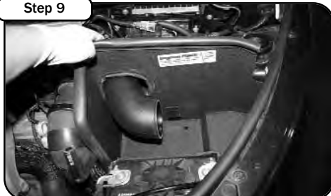
Step 9 Lower the intake assembly into the engine bay. Make sure the tab on the back of the housing lines up with the metal tab in the engine bay.