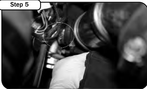
Step 5 Loosen the hose clamp connecting the intake duct to the turbo inlet. Remove the vent hose on the side of the intake tube and remove from engine bay.