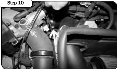
Step 10 Insert the intake tube into the coupler on the turbo inlet. Tighten the hose clamps.