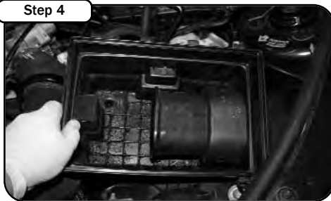
Step 4 Unfasten the upper half of the airbox and remove from engine bay. Grasp the lower portion of the airbox lift up and out to remove. Remove the 15mm bolt under the airbox.