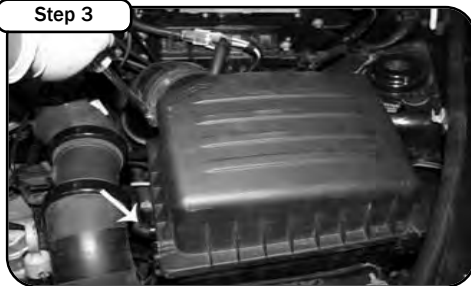
Step 3 Disconnect negative terminal from battery. Loosen the hose clamp on the intake tube. Remove the breather tube from the side of the airbox.