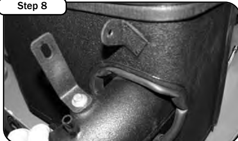
Step 8 Install the trim seal along the edge of the housing and inside the housing. Slide the intake tube inside the housing.