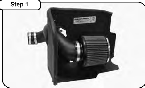
Step 1 Complete kit