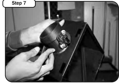
Transfer the MAF sensor to the intake tube. Use the supplied gasket,nylon spacers, and screws. Pay close attention to the flow of the MAF sensor when inserting the sensor into the tube.