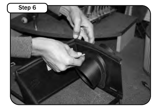
Place the intake tube into the housing and secure with the provided nuts, bolts, and washers. Place the trim seal along the edge of the housing.