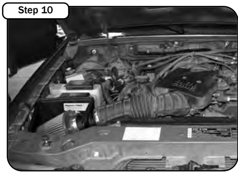
Place enclosed CARB EO sticker on a clean/smooth surface on or near the intake system. EO identification label is required in passing the Smog Check inspection. Your installation is now complete. Make sure all hoses and clamps are tight and that all electrical components are secure. Check and retighten connections and filte after a few hours of operation. Close hood slowly to verify hood clearance.