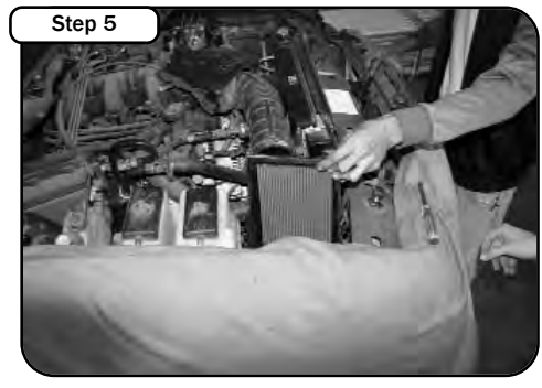
Remove the upper portion of the air box and remove the factory air filter.