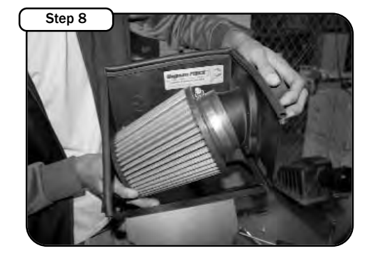
Insert the new air filter into the intake tube. Install the filter from the bottom of the housing for ease of instalation.