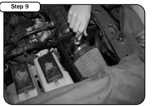
Tighten the clamp on the air filter and re-connect the MAF sensor .