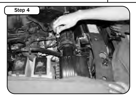
Loosen the factory hose clamp on the intake duct.