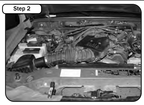
Complete stock intake.