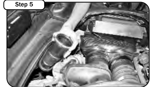
Step 5 Carefully remove intake tube out of the engine compartment.