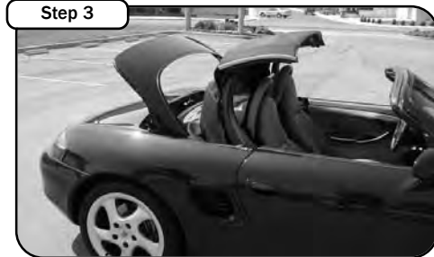
Step 3 In order to access engine compartment. Refer to your owner's manual for engine access instructions.