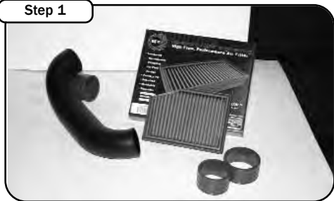
Step 1 Complete kit. Make sure all components are present prior to beginning installation.