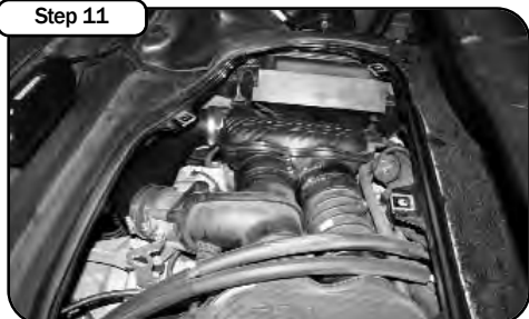
Step 11 Place enclosed CARB EO sticker on a clean/smooth surface on or near the intake system. EO identification label is required in passing the Smog Check inspection. Your installation is now complete. Make sure you tighten all clamps and check all electrical connections. Re check periodically