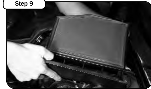
Step 9 Open the air filter access tray on the side of the air box and remove the OE air filter.