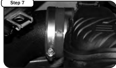
Step 7 Install the larger 3.25" coupler and clamps on the air box. Do not tighten clamps at this time.