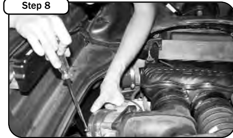
Step 8 Carefully install the new intake tube in the engine compartment. Tighten all four clamps securing intake tube.