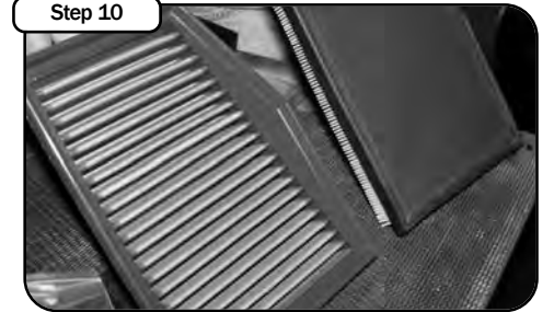
Step 10 Install the new aFe high flow air filter and reinstall the air filter access tray.