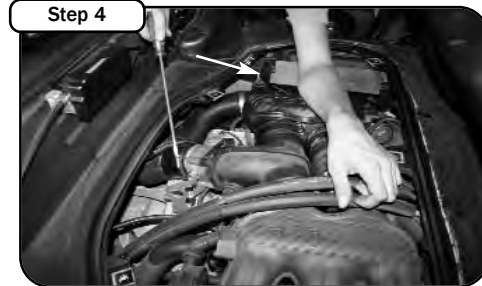
Step 4 Disconnect hose clamps on both ends of the intake tube.