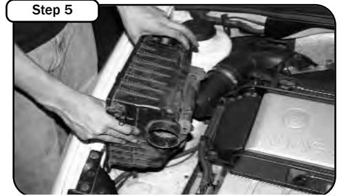
Step 5 Remove the bottom half factory air box by grabbing the air box by the sides and lift up and out.