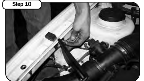
Step 10 Secure the side of the housing with the supplied self tapping screw and washer.