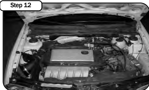
Step 12 Place enclosed CARB EO sticker on a clean/smooth surface on or near the intake system. EO identification label is required in passing the Smog Check inspection. Your installation is now complete. Make sure you tighten all clamps and check all electrical connections. Re check periodically.