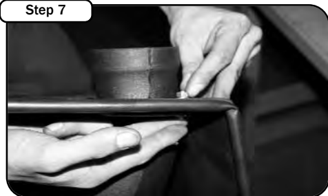
Step 7 Secure the new intake tube to the new housing using the supplied screws, washers and nuts.