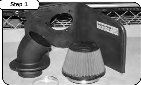
Step 1 Complete intake system. Verify all parts listed are present prior to beginning installation.