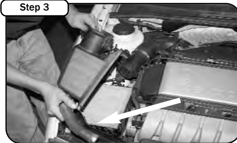
Step 3 Unclip the top portion of the air box and remove from the engine bay. Remove the breather hose at the valve cover.