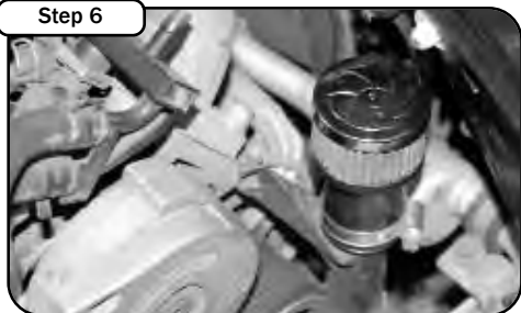
Step 6 Place the supplied breather air filter on the OE location. Secure with the supplied hose clamp.