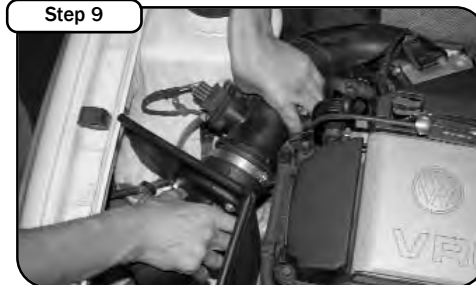
Step 9 Position the new intake into the engine bay. Slide the MAF unit into the intake tube. Secure with the provided hose clamp.