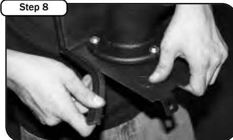
Step 8 Place the supplied trim seal along the edge of the housing.