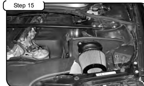
Make sure all hoses and clamps are tight and that all electrical components (if applicable) are secure. Check and retighten connections and filter after a few hours of operation.

Note: Filter Cleaning and Re-oiling: When cleaning your aFe filter, be sure to use only aFe's "Restore Kit" (aFe P/N: 90-50001 blue oil aerosol, or aFe P/N: 90-50501 blue squeeze bottle oil). Filter Replacement: PN: 24-91038 (black w/blue media). Pro Dry S™ P/N: 21-50505 Pro Dry S™ cleaning: see cleaning instruction sheet 06-00074