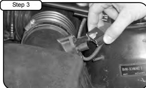
Remove factory harness from Mass Air Flow sensor and place out of the way until re-assembly.