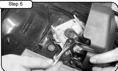
Remove plastic cover from headlight controller via locking tabs. Using a 10mm socket, remove the (2) bolts securing controller to allow for its movement and to release lower half of airbox.