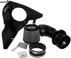
Complete kit with parts.