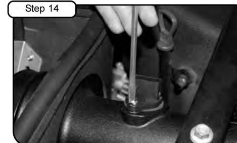
Install Mass air flow sensor onto tube using provided gaskets, spacers and screws.