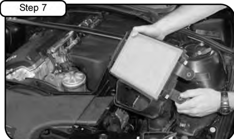
Using a 10mm socket remove the remaining bolt holding the factory intake in place, remove the lower half of the intake. Set the bolt aside for re-installation of heat shield.