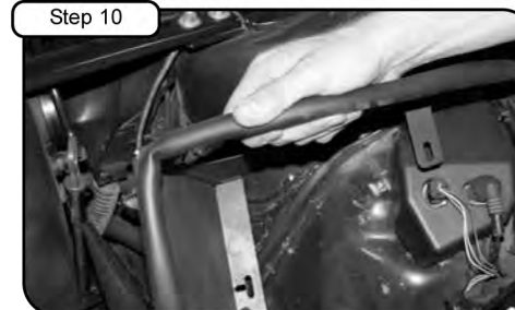
Install trim seal on housing and drop housing into vehicle. Do not tighten down housing.