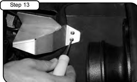
Install Flow divertor onto housing using provided button head screws.