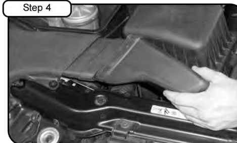
Remove front snorkel from ducting to stock airbox.