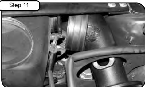
Slide coupler onto tube and place tube through housing hole.