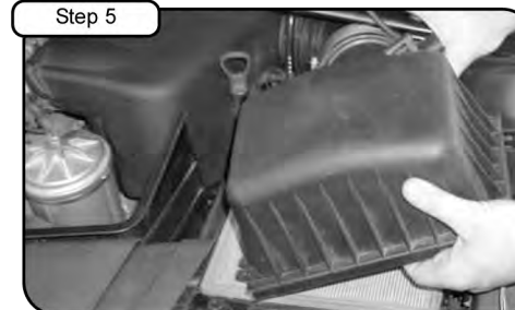
Using a standard screwdriver loosen the clamp securing intake track to factory airbox. Undo clamps securing top half of airbox and remove top half. Set aside for future removal of stock MAF sensor.