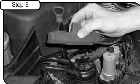
Remove rubber mount from tab beneath factory airbox.