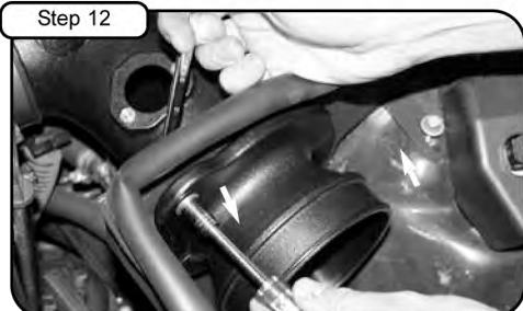
Align two holes on tube flange to holes on housing. Use provided M6 hardware to mount tube flange to housing.