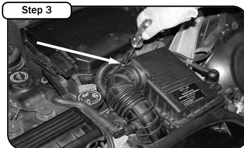
Remove the hose clamp connecting the air duct to the air box. Use a screwdriver to remove the clamp.