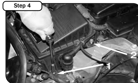
Loosen the two 10mm bolts that secure the air box on the right hand side of the engine bay. Set the bolts to the side you will be reusing these later.