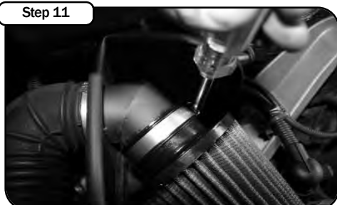
Install the new air filter into the housing secure the filter with the provided clamp. The air filter is pre oiled from the factory Do not use any grease or oil.