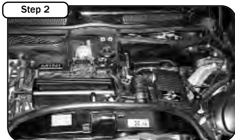
Stock intake system.