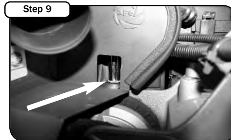
With 10mm socket w/ extension, Re install the rear air box bolt removed in step 5.