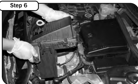
Remove the factory air box by grabbing the air box by the sides and lift up and out.