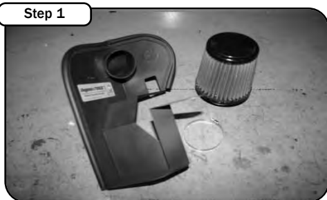
Complete intake system.