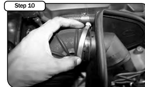
Place the new #044 clamp on the intake duct and tighten assembly to the housing inlet.