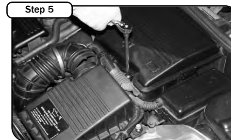
Remove the 10mm bolt that is located in the back of the air box securing the battery tray in place. Set the bolt to the side for later use.