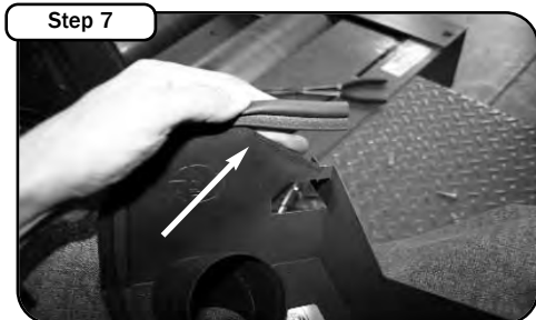
Place the trim seal along the edge of the housing. Position the new housing into the engine bay.