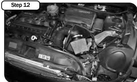
Your installation is now complete. Make sure you tighten all clamps and check all electrical connections. Re check periodically.

Note: Filter Cleaning and Re-oiling: When cleaning your aFe filter, be sure to use only aFe's "Restore Kit" (aFe P/N: 90-50001 blue oil aerosol, or aFe P/N: 90-50501 blue squeeze bottle oil or aFe P/N: 90-50000 gold oil aerosol, or aFe P/N: 90-50500 gold squeeze oil). Filter Replacement: Magnum FLOW PN: 24-90031 (black w/ blue media). Pro Dry S™ P/N: 21-90031 (black w/ white media) Pro Dry S™ cleaning: see cleaning instruction sheet 06-00074