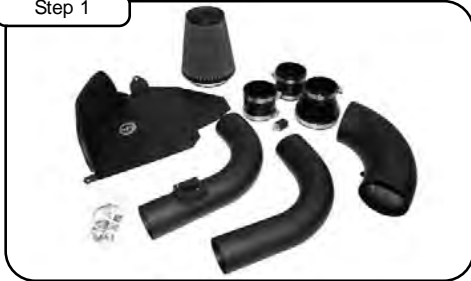
Complete kit with parts.