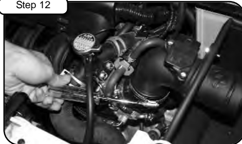
Attach other side of crank case line to 1/2" hose fitting with mini clamp and tighten. With 5/16" nut driver tighten clamps at elbow coupler.