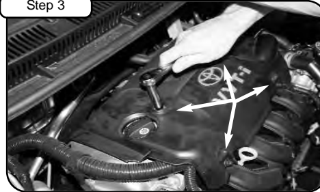
Remove engine cover with 10mm socket.