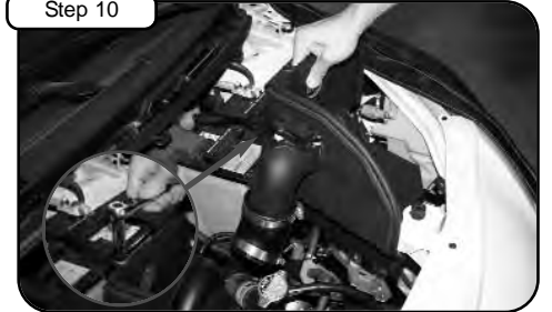
Install 2-1/4" elbow with clamps provided to intake tube. Now install intake system into vehicle. Re-install 10mm nut on battery bracket and tighten.