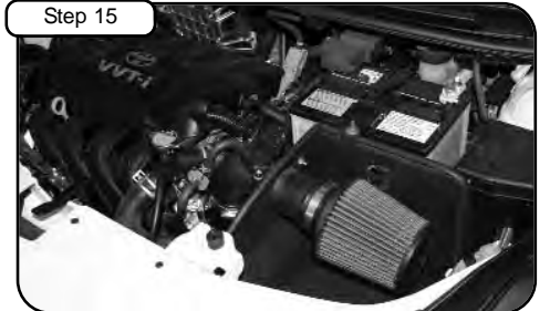
Your installation is now complete. Check all clamps and hoses periodically. Thank you for choosing aFe!

Note: Filter Cleaning and Re-oiling: When cleaning your aFe filter, be sure to use only aFe's "Restore Kit" (aFe P/N: 90-50001 blue oil aerosol, or aFe P/N: 90-50501 blue squeeze bottle oil) Filter Replacement: Magnum FLOW PN: 24-90031 (black w/blue media) or Pro Dry S P/N 21-90031 (black w/white media) Pro Dry S cleaning: see cleaning instruction sheet 06-00074