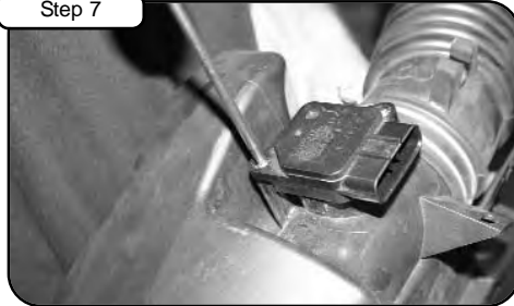
With phillips screwdriver, remove MAF sensor. Install both 7/16" trim seal to new aFe housing. (as shown in step 8)