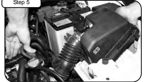
Loosen intake clamp with 10mm socket and un-clip the upper half of stock air box. Remove OE intake out of vehicle.