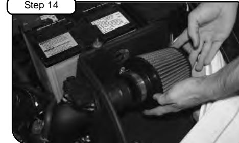
Re-connect MAF sensor. Place high FLOW filter into housing and tighten using 5/16" nut driver.