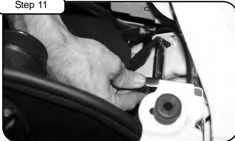
Using M6 nut and wavy washer provided tighten front of housing to headlight assembly using 10mm socket.