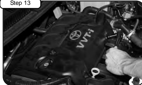
Install engine cover and use the 4 cover nuts from step 3 and tighten using 10mm socket.