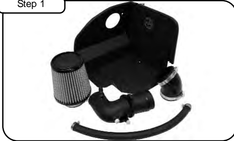
Complete kit with parts.