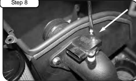
Re-install MAF sensor to new aFe tube with hardware provided (make sure gasket and nylon spacers are between tube and sensor) using flat head screwdriver. Install tube to outside of housing and tighten using M6 screw, wavy & flat washer with M6 nut and tighten.