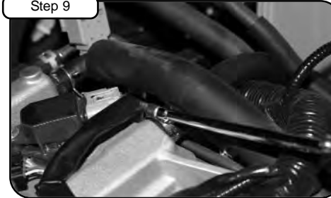
Install new 5/8" line to crank case with mini clamps and tighten using 1/4" nut driver. Loosen 10mm nut holding battery bracket and save for later install. Install 1/2" elbow fitting with grommet in to new intake tube.