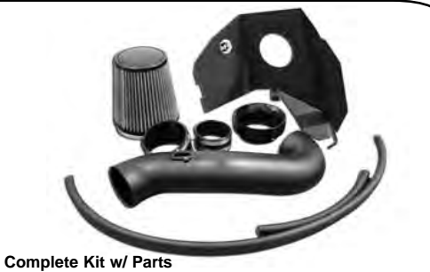
Complete Kit w/ Parts