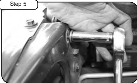
With 13mm socket or wrench remove top bolt on inner fender next to air inlet hole.