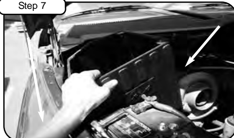
Install housing into vehicle and position.