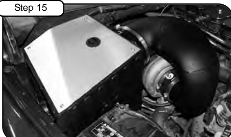
Place the included CARB EO Sticker on or near the intake system on a smooth, clean surface. E.O. identification label is required in passing the Smog Check Inspection. Your installation is now complete. Please check all clamps and hoses periodically and tighten.

Note: Filter Cleaning and Re-oiling: When cleaning your aFe filter, be sure to use only aFe's "Restore Kit" aFe P/N: 90-50000 gold aerosol oil, aFe P/N: 90-50500 gold squeeze oil. Filter Replacement Pro-GUARD 7™ P/N: 72-90040 (black w/gold media). For replacement part(s) or "Restore Kit" please call aFe sales/tech support @ 951-493-7100.