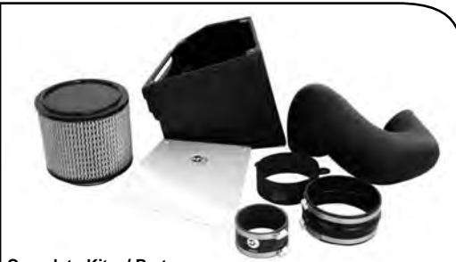
Complete Kit w/ Parts