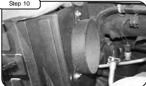
Install filter adaptor to outside of housing using supplied screws, washers, and nuts. Tighten with 7/16" socket or wrench.