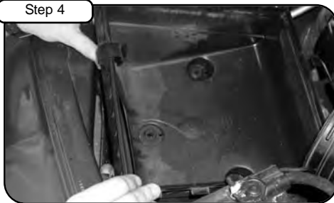
Carefully lift and pull bottom half of air box to remove from vehicle.