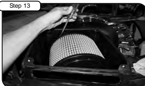
Install air filter and tighten with 5/16" nut driver.