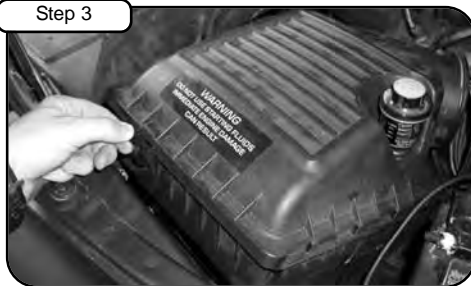
Un-clip upper half of air box and remove.