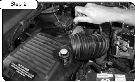
Use 5/16" nut driver to loosen clamps on OE tube at turbo/air box and remove.