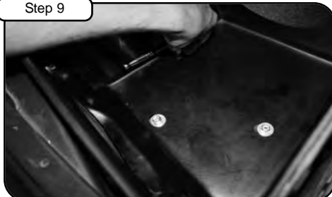
Secure housing using fender washers and nuts provided. Tighten using 7/16" socket or wrench.