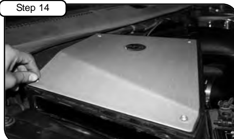
Install cover and tighten using button head screws provided. Tighten with 5/32" allen key.