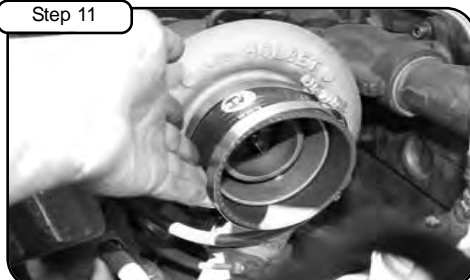
Install high temp coupler to turbo using clamps provided. Do not tighten.