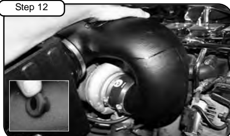
Attach 6" hump coupler with clamps provided to tube and install tube to turbo and filter adaptor. Adjust and tighten all clamps with 5/16" nut driver. Install filter minder grommet in hole provided and install filter minder.