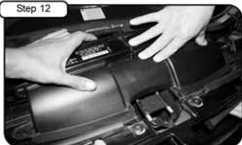
Have person B re-install the cover and secure with plastic pin clips that were removed earlier. (See steps 4-6)