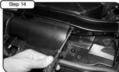
Re-position ram air duct from step 3. Secure using the 2 screws from step 2 and tighten using T25 torx bit.