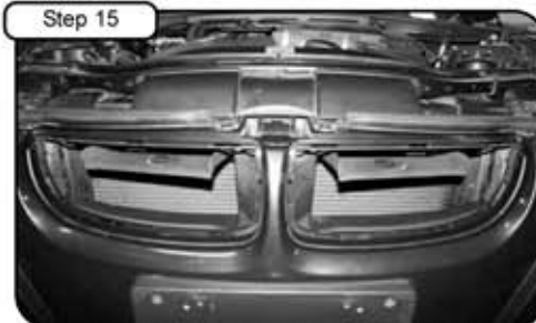
Your completed D.A.S. installation will look like this. Check and make sure they are secure. Re-install grills by lining up tabs and pushing them in until they snap into place. Thank you for choosing aFe!