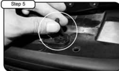
Remove plastic pin.