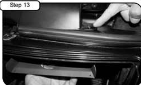
Detail of properly installed plastic pin clips. Make sure pin clips are through hole on scoops allowing to secure and hold in place!