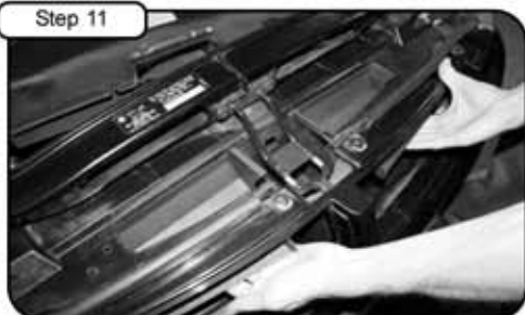
For easier installation, the next three steps will require an assistant. Have person A hold the scoops in position as shown. With BMW 320i, only the passenger side (p/n 05-01017) is installed.