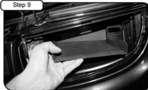
Install 05-01016 Driver side D.A.S.