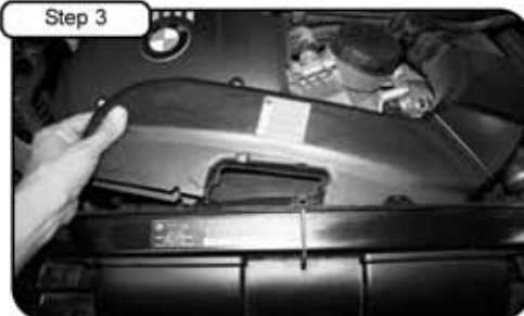
Pull back ram air duct and remove.