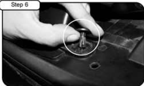
Remove plastic clip. Repeat steps 4-6 for remaining clip. (Save for later installation)