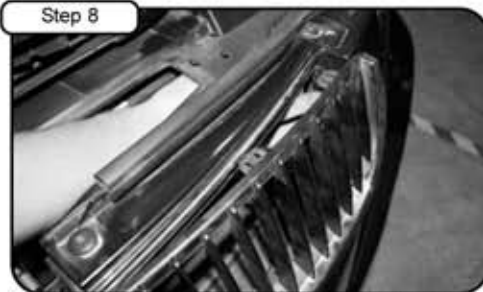
The grills are held in place with push clips. To remove, reach in behind each grill and push forward.