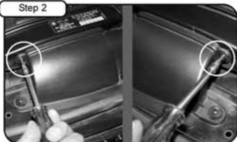
Remove screws on ram air duct using T25 torx bit. (Save for later installation)