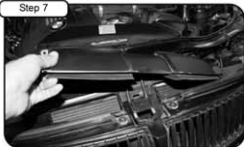
Lift and pull out cover.