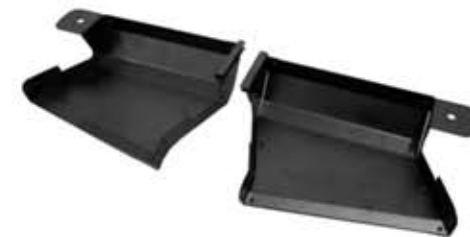
Complete Kit w/ Parts for 54-11478.