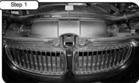
Complete Stock Configuration. (BMW 335i model shown above. Also fits M3 model)