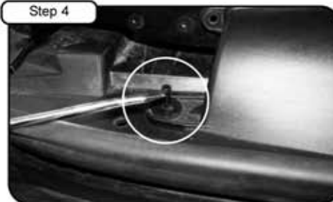
With flat head screwdriver, carefully pry and push up plastic pin.