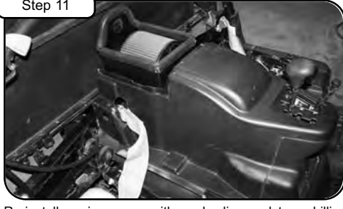
Re-install engine cover with push clips and two philips screws.