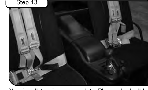
Your installation is now complete. Please check all bolts and clamps periodically. Re-tighten if necessary. Thank you for choosing aFe!