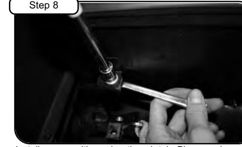
Install screws with washer through tab. Place washer and M6 nut on other side of screw.