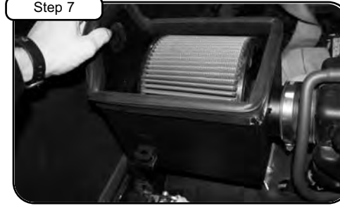
Install housing using stock coupling and clamp. Use provided screws, washers and nuts to attach bracket on bottom of housing to vehicle.