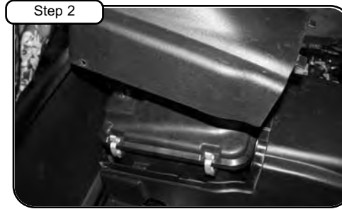
Remove top half of engine cover. Un-clip upper half of engine cover and remove.