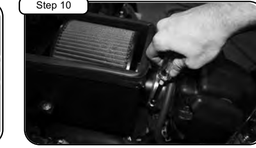
Tighten clamp to housing using 5/16" nut driver or flat head screwdriver.