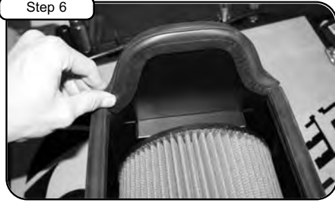
Install 7/16" trim seal on housing.