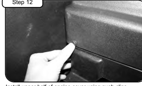
Install upper half of engine cover using push clips.