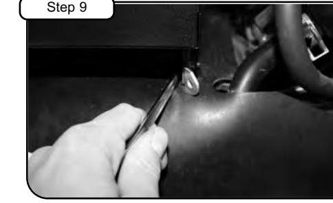
Tighten all screws with 10mm socket and wrench.