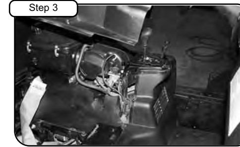
Remove engine cover. Remove plastic push clips using flat head screwdriver and remove two front screws with a philips screw driver.