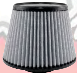
Replacement Filter P/N: TF-9010D