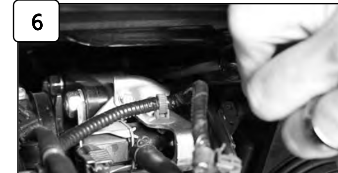
Loosen the clamp on throttle body using phillips screw driver.