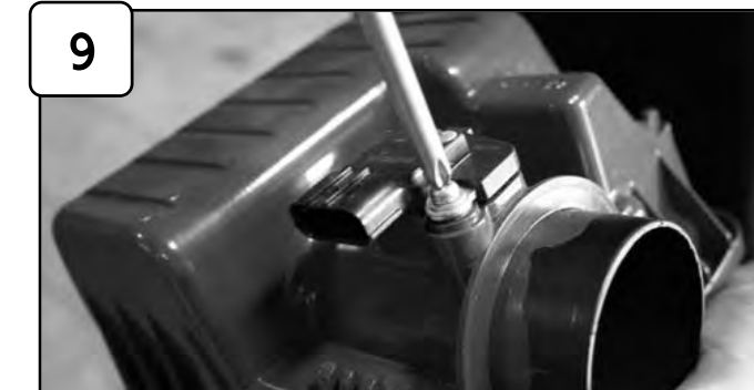
Remove MAF sensor from stock air box using phillips screwdriver.