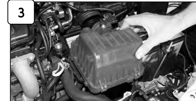
Disconnect MAF sensor harness and remove upper half of air box.