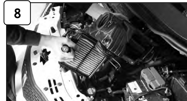
Pull vacuum line away from air box and remove complete air box.