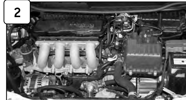
Complete Stock intake. Please disconnect battery terminals before installation.