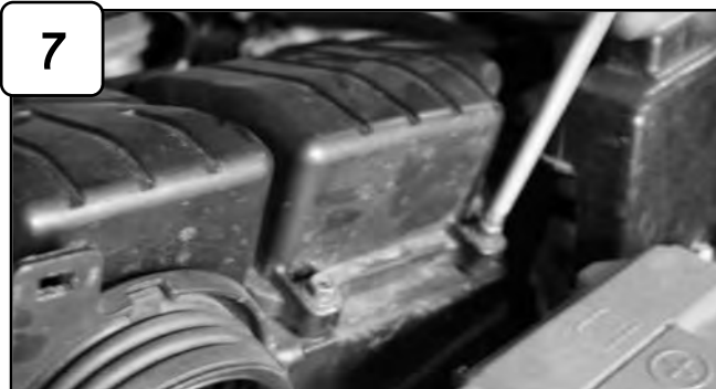
Remove air box cover lid using phillips screw driver.