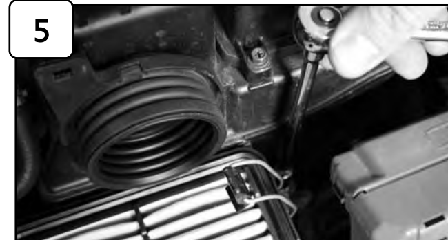
Loosen the 2nd bolt behind the battery mounting the air box, use 10mm socket or wrench.