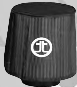
Pre Filter P/N: TP-7011B

Note: Filter Cleaning: When cleaning your Pro Dry S™ filter, be sure to use only "Restore Kit" (Takeda P/N: TP-7016C Pro Dry S™ cleaner only.)