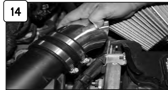
14 Install cold air duct using coupler with clamps provided. Using screw, nut and washer provided, tighten tab on duct to bracket using 10mm socket or wrench. Tighten clamps using 5/16" nut driver.