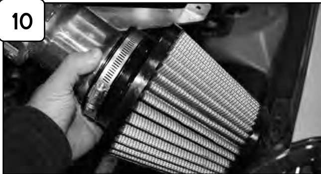
10 Attach air filter to intake tube and tighten clamp using 5/16" nut driver.

For replacement part(s) or "Restore Kit" please log on to takedausa.com P.O. Box 1719 Corona CA, 92878