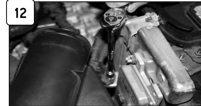
12 Loosen screw holding ECU wire harness. See step 13.