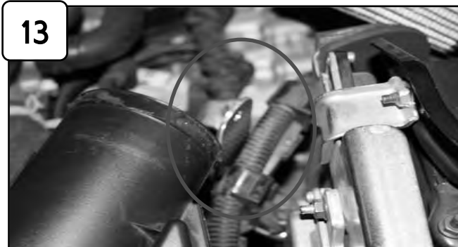
13 Now Install bracket and secure with screw from step 12 and tighten.