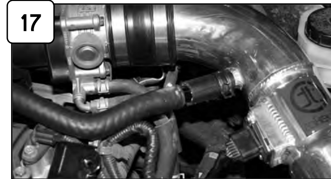
17 Connect factory and new hose together using provided 5/8" barb fitting. Re-connect battery terminals. Re-install engine cover.