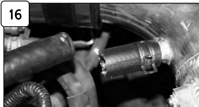
16 Install 5/8" hose provided to intake tube with factory clamp.