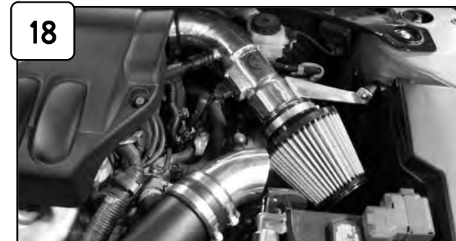
18 The installation of your Takeda performance intake is now complete. Please check all components and re-tighten if necessary. Thank you for choosing Takeda!