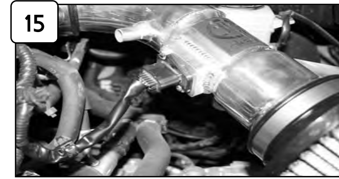
15 Re-connect MAF sensor harness.