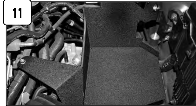
11 Install housing into vehicle and position. Re-secure tab on housing with bolt from step 10.