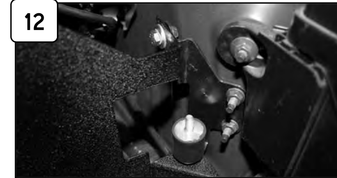
12 Secure housing with isolation mount. Secure small tab using M6 screw, wavy washer and nut. Tighten all screws and bolts using 10mm socket or wrench.