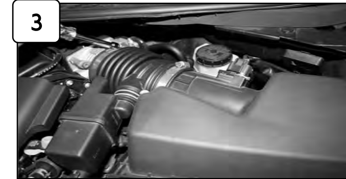
With 5/16" nut driver loosen clamps on stock intake.