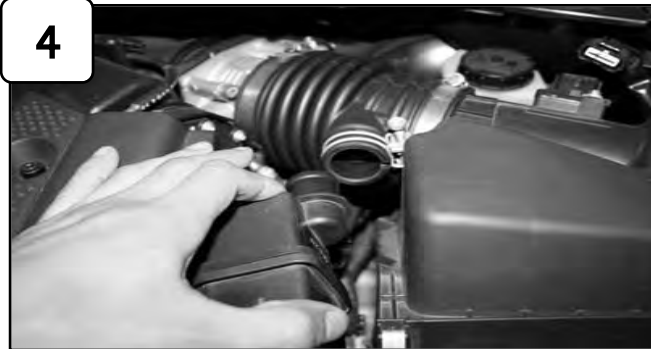
With 10mm socket or wrench loosen crank case line. Disconnect MAF sensor harness.