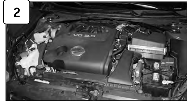
Complete Stock intake. Please disconnect battery terminals before installation.