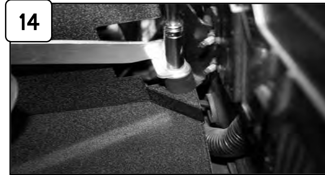
14 Tighten tab using provided Flat washer, wavy washer and nut.