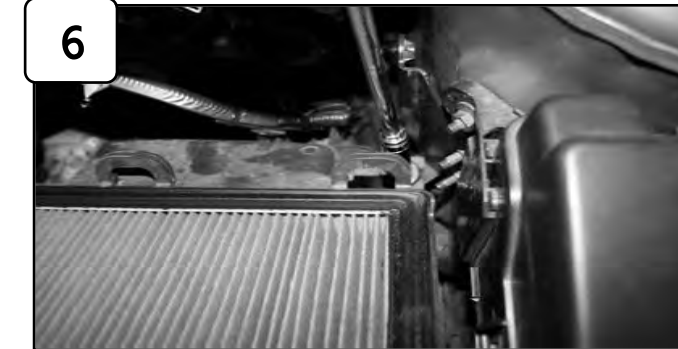
With 10mm socket or wrench loosen the bolt securing bottom half of air box. Carefully remove stock air box assembly out of vehicle.