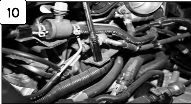
10 With 10mm socket or wrench loosen bolt on engine.

For replacement part(s) or "Restore Kit" please log on to takedausa.com P.O. Box 1719 Corona CA, 92878