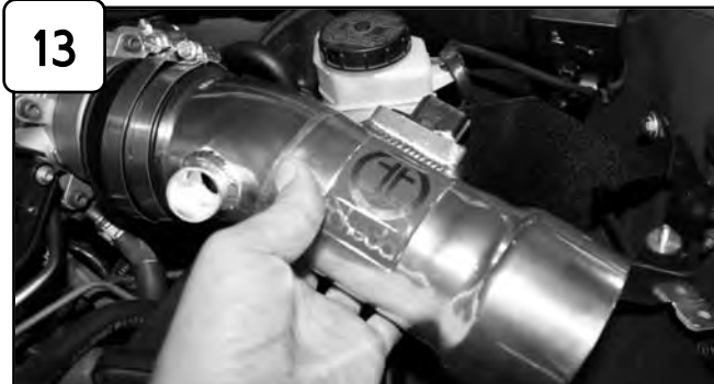
13 Install intake assembly and position tab to isolation mount. Do not tighten.