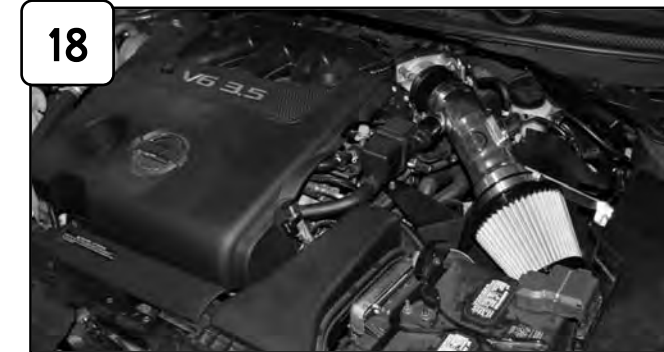
18 The installation of your Takeda performance intake is now complete. Please check all components and re-tighten if necessary. Thank you for choosing Takeda!