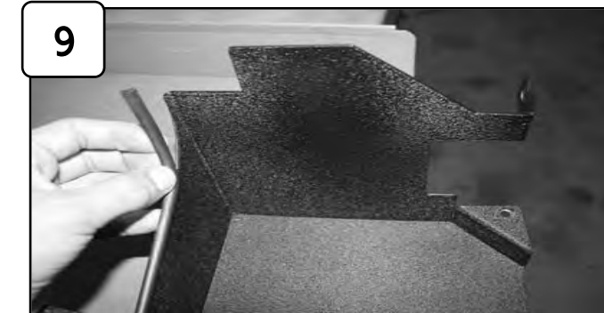
Attach rubber trim to housing.