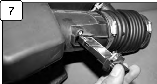
Remove MAF sensor using phillips screwdriver.