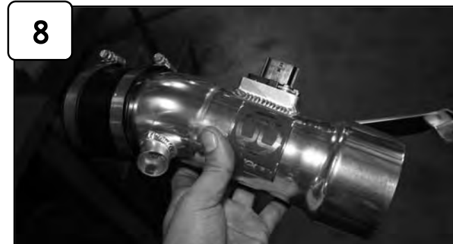
With provided M4 screws, install MAF sensor to new intake tube. Attach 05-00305 coupler to tube with clamps provided. Do not tighten.