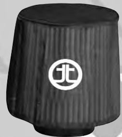
Pre Filter P/N: TP-7011B

Note: Filter Cleaning: When cleaning your Pro Dry S™ filter, be sure to use only "Restore Kit" (Takeda P/N: TP-7015C Pro Dry S™ cleaner only.)