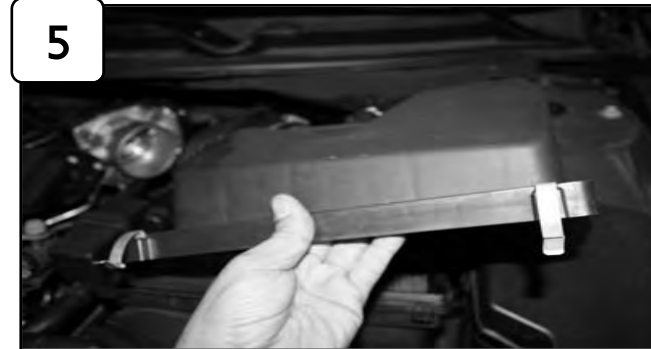
Remove upper half of air box and stock tube assembly.