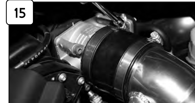
15 Tighten all clamps using 5/16" nut driver.