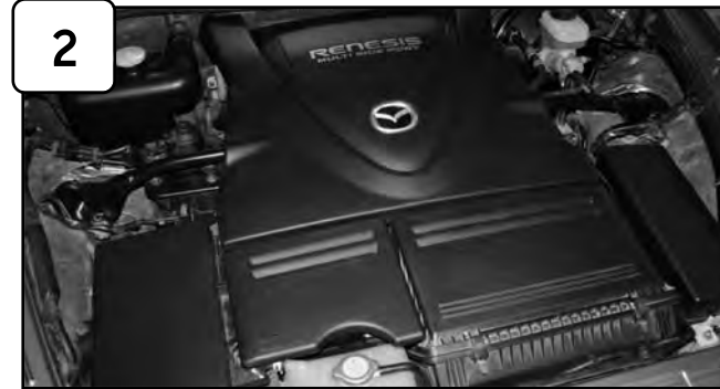
Complete Stock intake. Please disconnect battery terminals before installation.