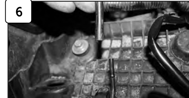
Pull back vacuum line.