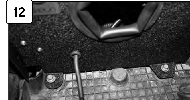
12 Re-install screws from step 9 to secure housing. Do not tighten.