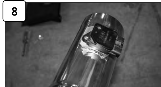
With provided M4 screws, install MAF sensor to new intake tube.