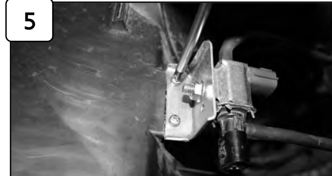
Loosen VSV sensor using phillips screwdriver on back of air box. Carefully remove. Remove air box out of vehicle.