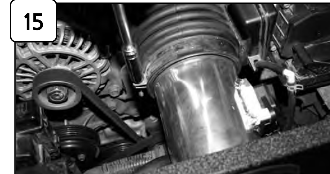
15 Tighten clamp using 10mm socket or wrench. Re-connect MAF sensor harness.