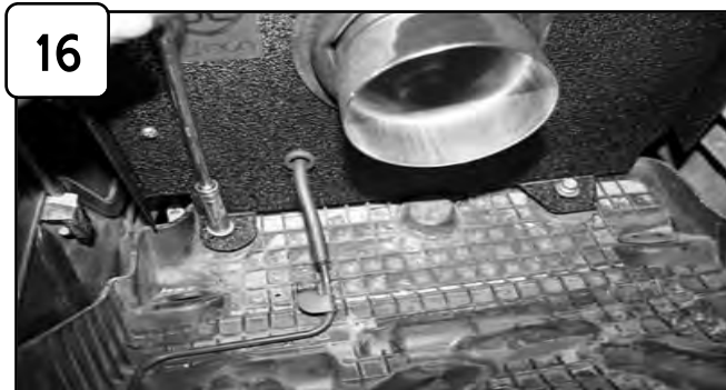
16 Tighten screws using 10mm socket or wrench.