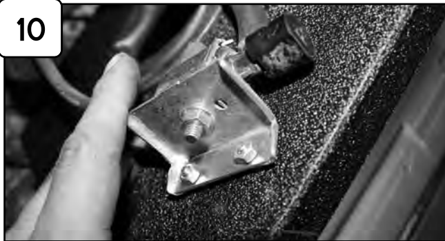
10 Attach VSV sensor to back of housing and secure using provided M4 screws and nuts.