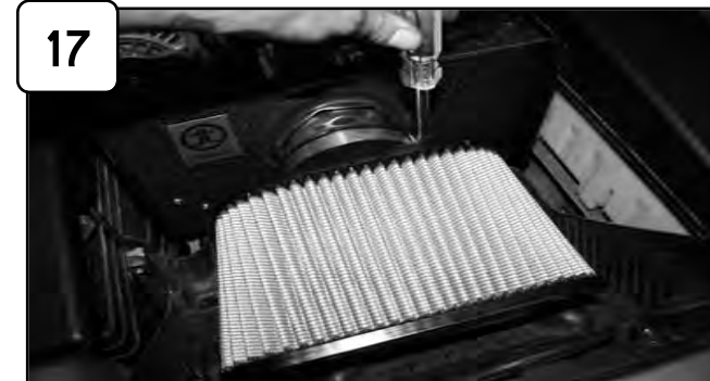
17 Install filter and tighten using 5/16" nut driver. Re-install engine cover. Re-connect battery terminals.