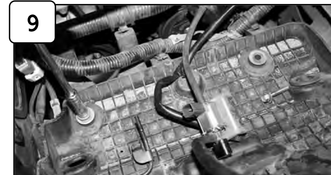
Loosen the 2 OE screws holding in air box bracket. Save for later install.