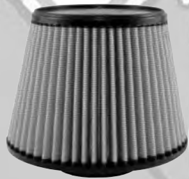
Replacement Filter P/N: TF-9008D

Note: Filter Cleaning: When cleaning your Pro Dry S™ filter, be sure to use only "Restore Kit" (Takeda P/N: TP-7015C Pro Dry S™ cleaner only.)