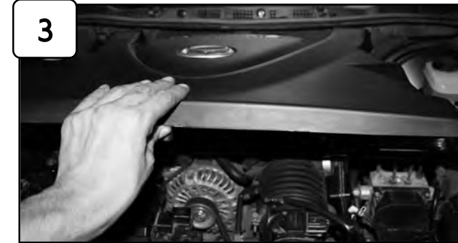
Remove engine cover.