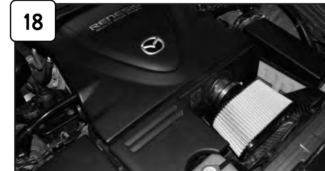
18 The installation of your Takeda performance intake is now complete. Please check all components and re-tighten if necessary. Thank you for choosing Takeda!