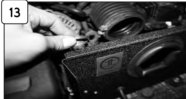
13 Remove OE grommets from air box and install to hole cut outs on top of housing.