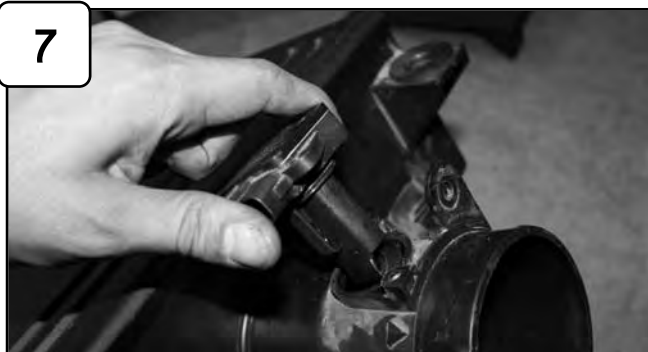
Remove MAF sensor.