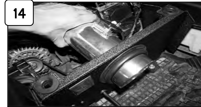
14 Install tube through back of housing and position.