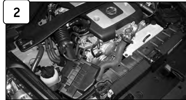
2 Complete Stock passenger side intake. Please disconnect battery terminals before installation.