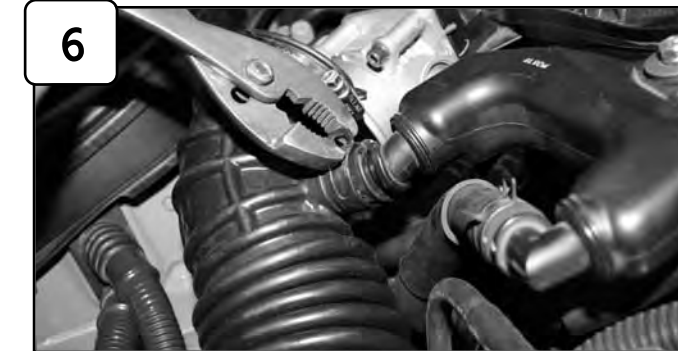
6 With pliers pull back crank case line from intake.