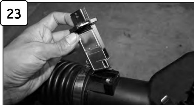
Remove MAF sensor from stock intake.