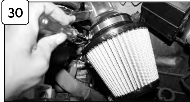
Tighten all clamps using 5/16" nut driver. Install air filter and tighten using 5/16" nut driver.