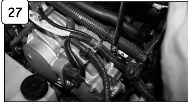
Loosen bolt on engine securing harness bracket.