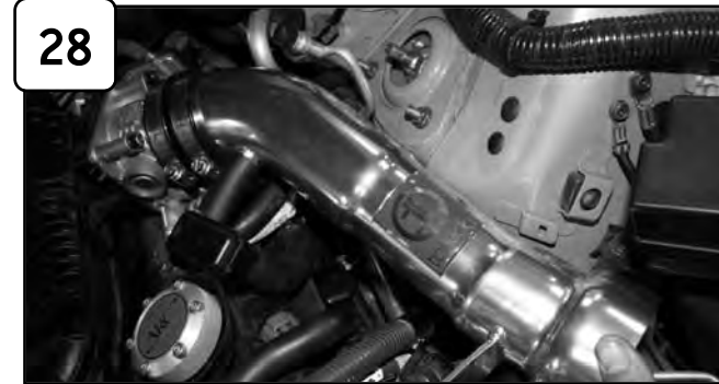
First re-connect MAF sensor harness. Install into vehicle and position. Do not tighten clamps.