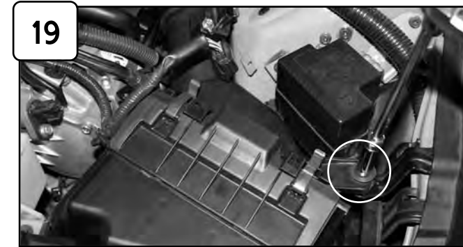
With 10mm socket or wrench, loosen the bolt holding in air box.