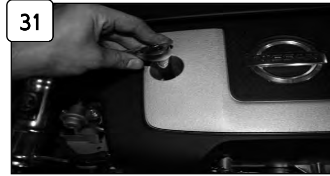
Re-install engine cover and tighten using 10mm socket or wrench.