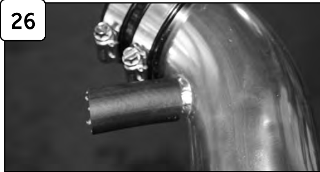
Attach 5/8" hose to tube.