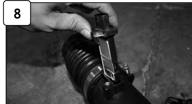
8 Remove MAF sensor from stock intake.