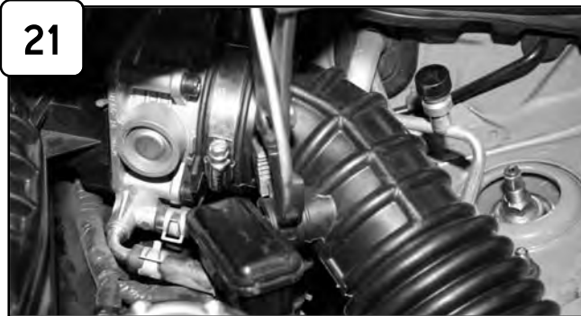
With pliers pull back stock intake tube from vent box.