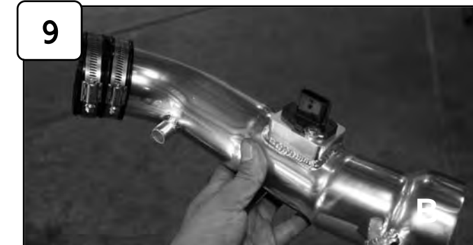
9 Install MAF sensor to new tube using provided M4 screws. Attach coupler with clamps to tube.