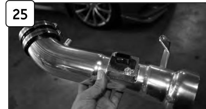
Attach coupling with clamps to tube.