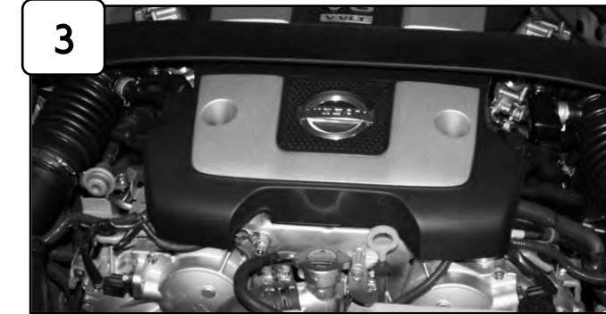
3 With 10mm socket or wrench, loosen the 2 bolts holding in lower engine cover and remove.