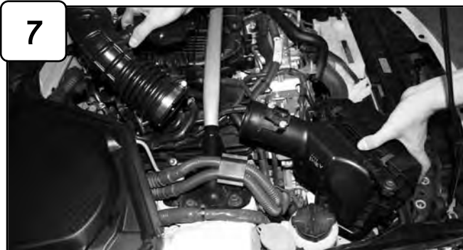
7 Remove complete intake out of vehicle.