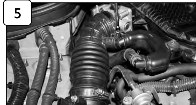
5 Loosen clamps on intake using 5/16" nut driver.