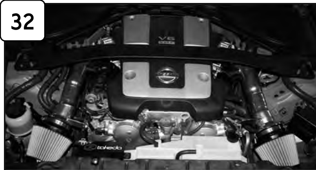
Your installation of your Takeda performance intake is now complete. Please check all components and re-tighten if necessary. Thank you for choosing Takeda!