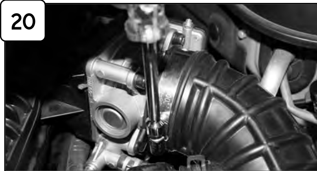
Disconnect MAF sensor harness. Loosen clamps using 5/16" nut driver.