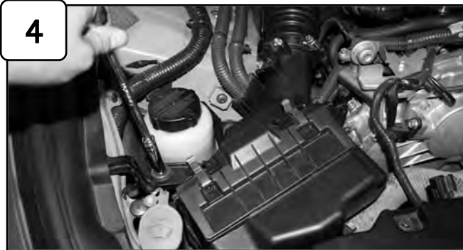
4 Disconnect MAF sensor harness. With 10mm socket or wrench loosen bolt holding in air box.