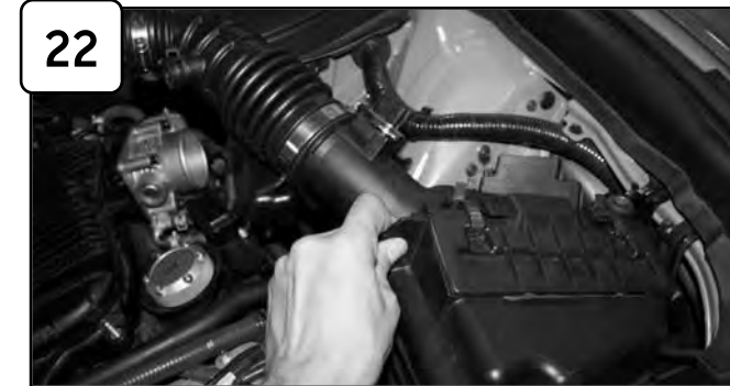
Remove complete intake out of vehicle.