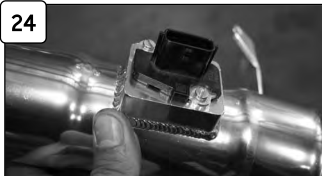
Install MAF sensor to new tube using provided M4 screws.