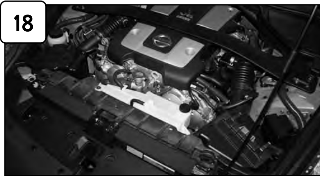
Complete Stock driver side intake.