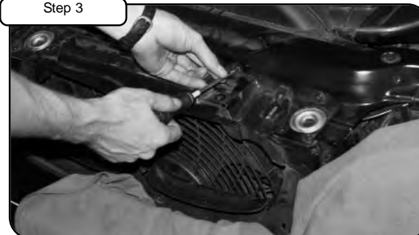
Remove retaining screws. (2)