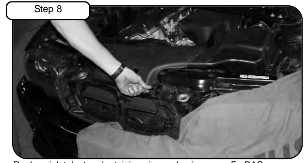
Replace inlet duct and retaining pins and enjoy your aFe DAS.