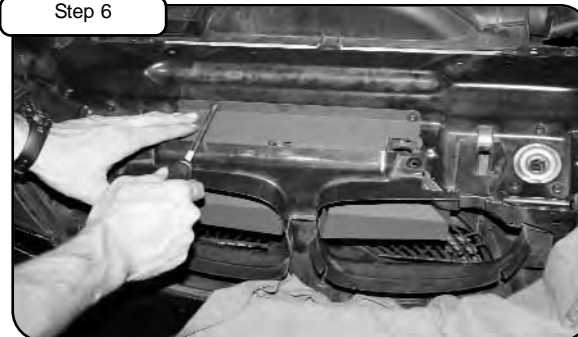
Replace the screws removed in step 3.