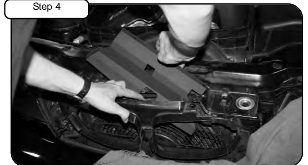
Gently pull grill forward to insert the aFe DAS.