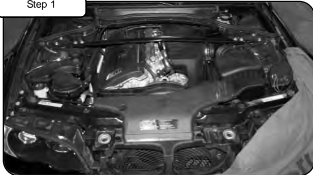
Complete Stock Configuration.