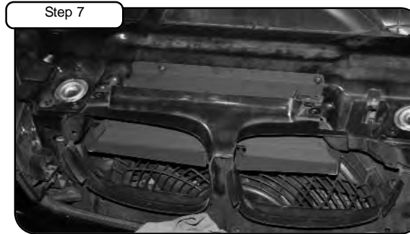
Scoops with screw installed.