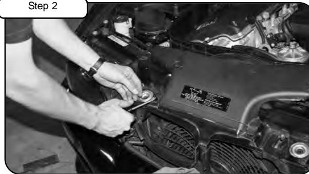
Remove inlet duct retaining pins and inlet duct.