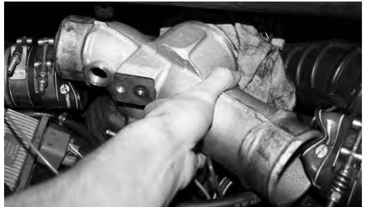
15- Pull the manifold out of the vehicle and be careful not to let anything fall into the plenum openings.