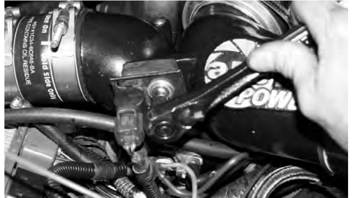
31- Now reinstall the boost control module. Reconnect battery.