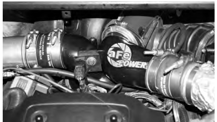
32- Your installation is now complete. Please check all components and retighten if necessary. Thank you for choosing aFe Power!