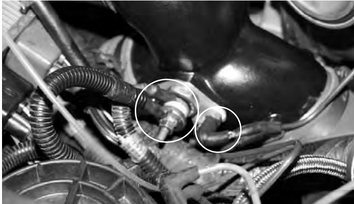
27- Now reinstall the lower manifold wires and hoses that you disconnected in steps #3, #5, and #9.