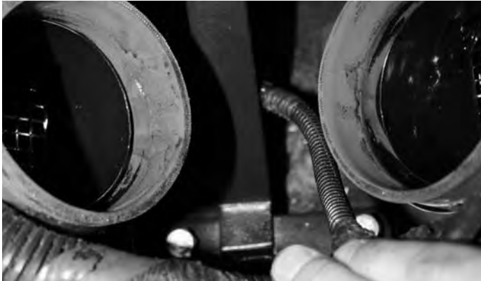
18- Install the manifold support bracket onto the top of the motor with 3/8 - 16 hex head cap screws supplied. Torque screws to 18 Ft. Lbs.