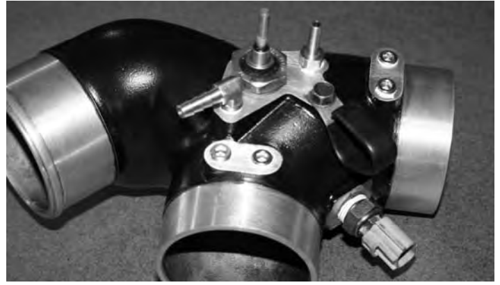
21- Install the heating element and temp sensor into the manifold and, last install the brass hose nipple. Torque all items to 16 Ft. Lbs.