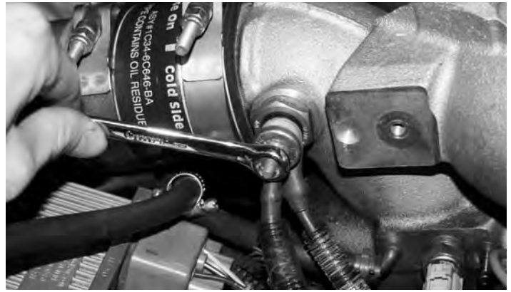
5- Using a 10mm wrench, remove the heating element wires.