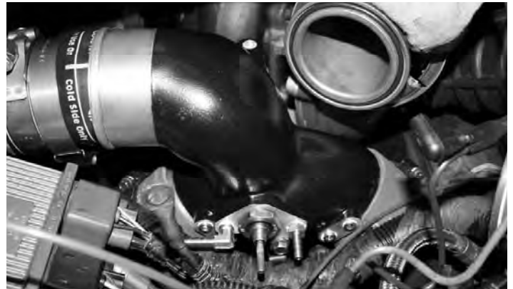
23- Once the manifold is in position, adjust the clamps to the desired location that makes them easiest to access.