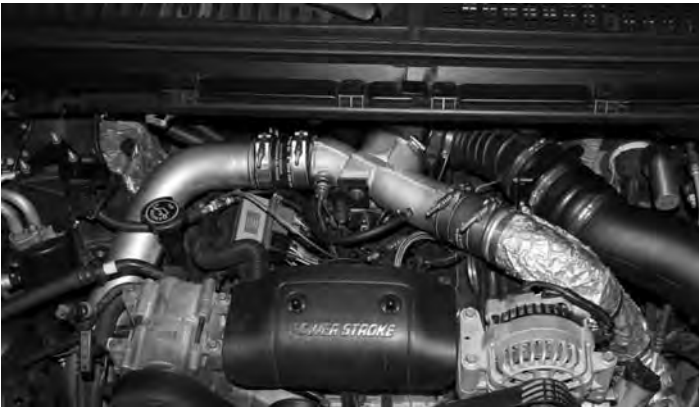
1- View of stock turbo outlet/ intake manifold. Disconnect the negative (-) battery terminals before installation.