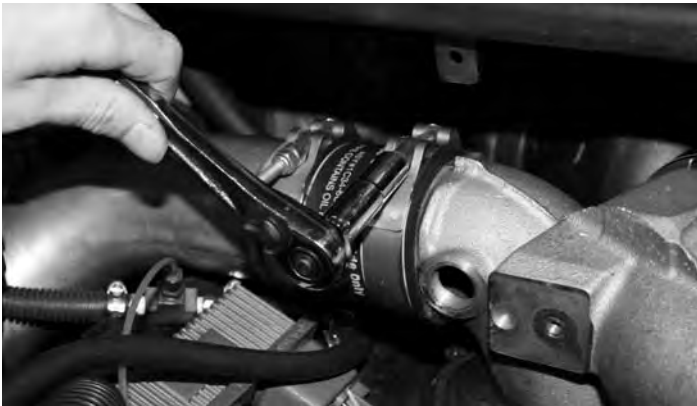
11- Loosen the clamp holding the manifold to the intercooler tube return side using a 7/16" deep socket.