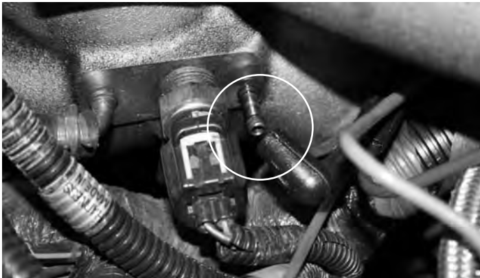
3- Disconnect the rubber boot/ hose.