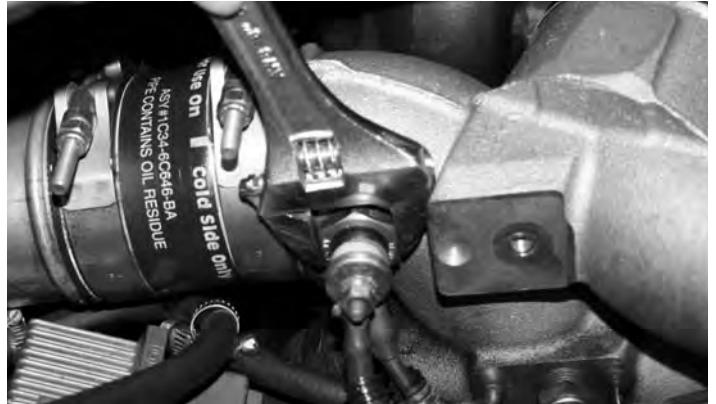
6- With an adjustable wrench, remove the heating element.