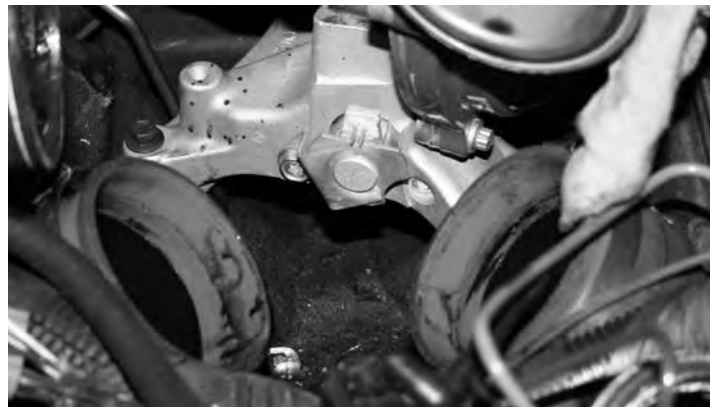
16- Locate the bracket mounting holes that are located directly under these two intake couplings. The holes are on the top of the motor as shown in Step 17.