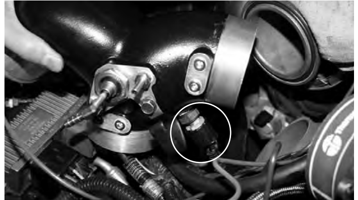
22- Connect the temp sensor before setting the manifold into the couplings.