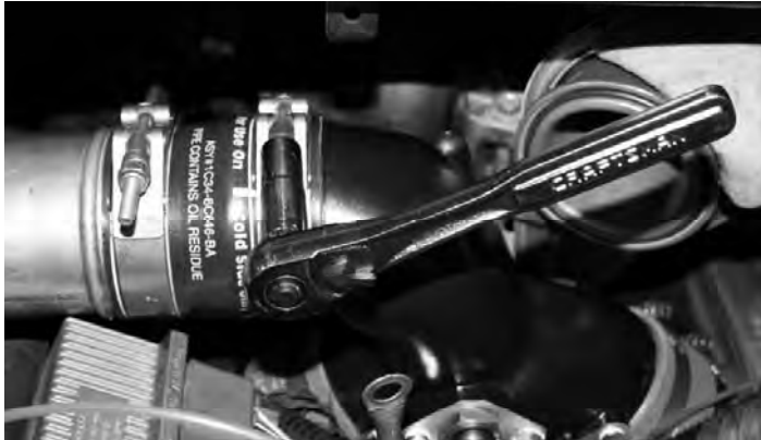
26- Slide the intercooler tube coupling onto the manifold, then tighten clamp. Torque to 9 Ft. Lbs.