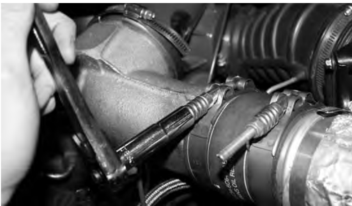
12- Loosen the clamp holding the turbo outlet coupling to the intercooler tube using a 7/16" deep socket.