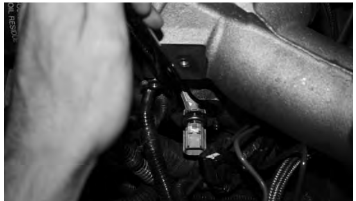
8- Remove the temp sensor from the lower manifold using a 13mm wrench and put aside for later install.