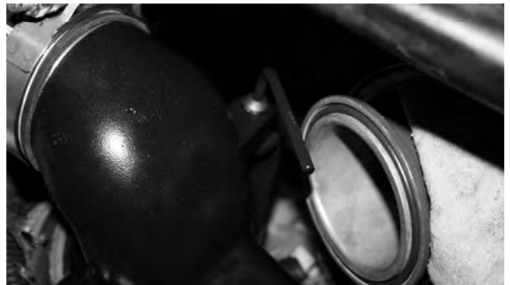
24- Line up the lower manifold with the support bracket and install the hex flange head screw supplied.