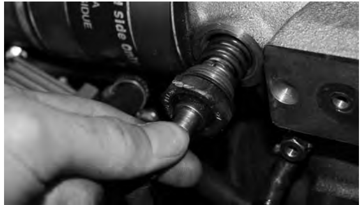
7- Once removed, put the heating element to the side for later install.