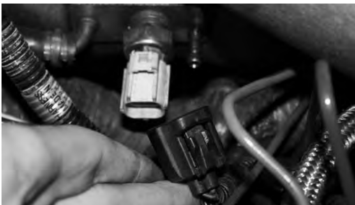
4- Disconnect the temp sensor.