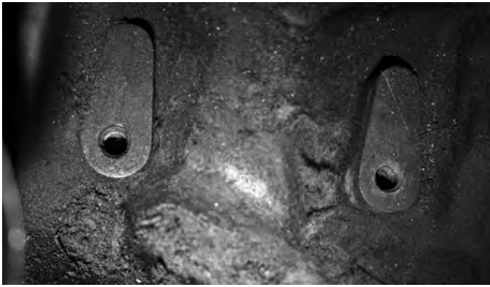
17- Use 3/8 - 16 tapped holes on the motor for the mounting support bracket.