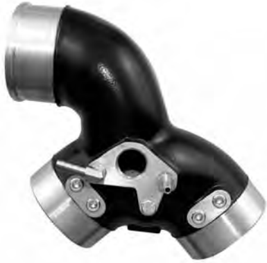
Turbo Outlet Manifold