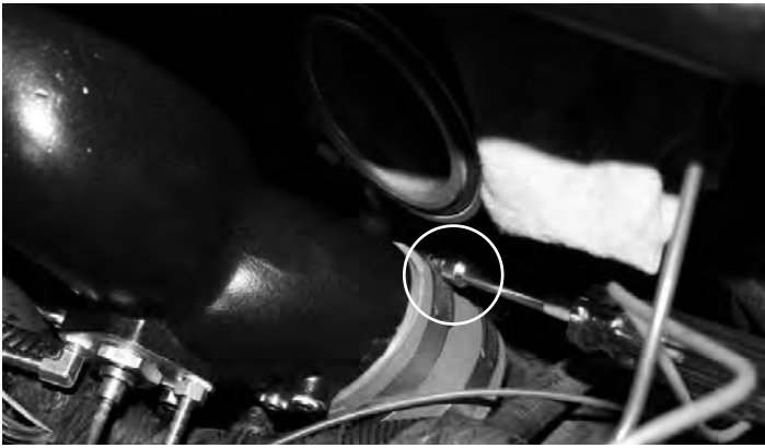
25- Now that you have the manifold in its desired location, tighten both sides of the lower manifold coupling clamps.