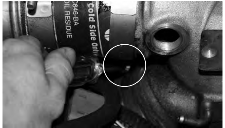
13- Loosen both upper clamps on the Y-inlets of the stock intake manifold as seen in this photo and also in step 14.