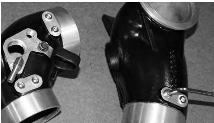
20- Install all 6 plugs and the 90 degree fitting elbow into the manifolds, then install the band clamp from the stock Y-inlet manifold.