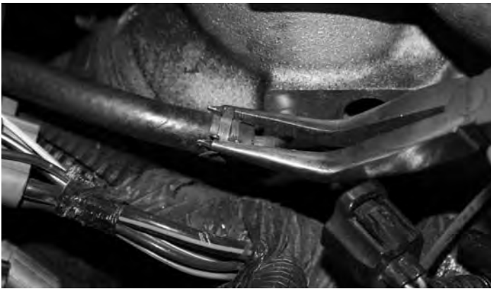
9- Using pliers to squeeze the clamp tabs, remove the rubber hose from the lower intake manifold fitting.