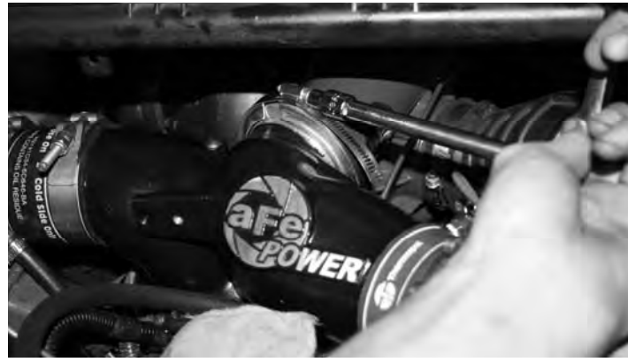
29- Once the manifold is in its desired position, firmly tighten down the turbo V-band clamp.