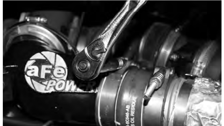
30- Install the hot side intercooler tube coupling onto the turbo manifold. Torque clamp to 9 Ft. Lbs.