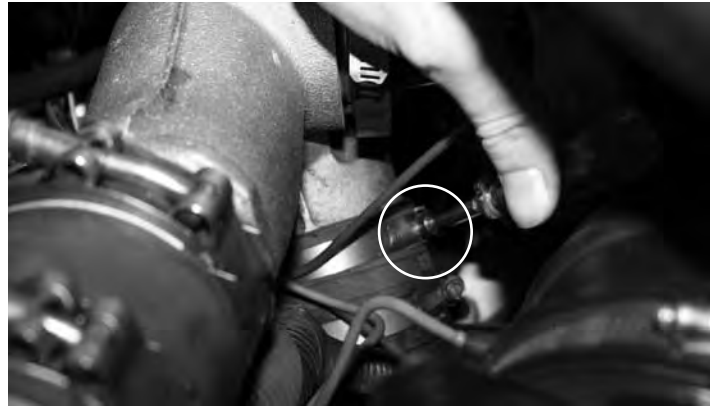
14- If needed, replace the couplings with Ford part number F81Z 6C640- FA available from your local dealer.