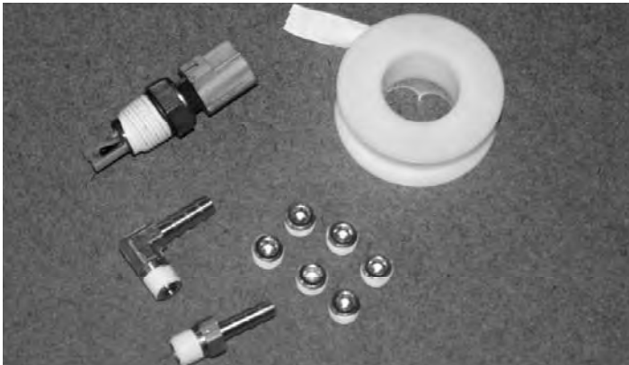
19- Using teflon pipe sealant tape, wrap a thin layer around the threads of each component.