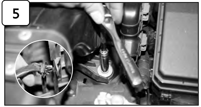
With 10mm socket or wrench loosen bottom half of air box. Pull back harness clip from air box.