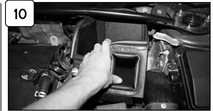
Install housing and position grommets on housing to factory fittings.