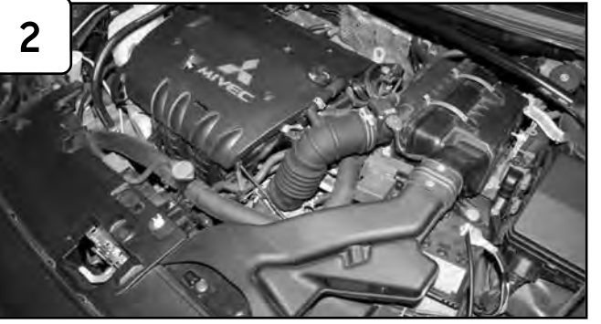
Complete stock intake. Please disconnect battery terminals before installation.