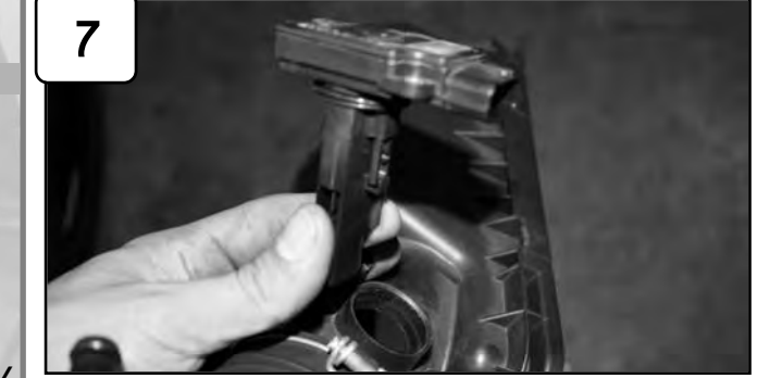
With t20 torx bit screwdriver remove MAF sensor from air box.