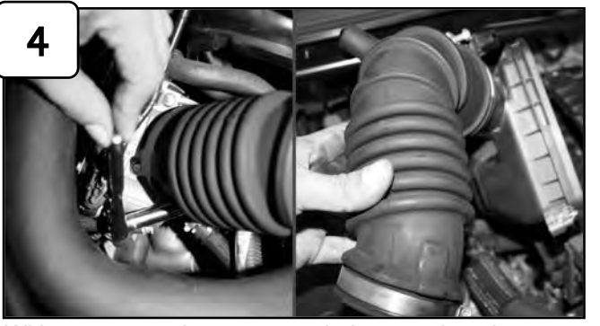
With 10mm socket or wrench loosen the clamp on throttle body. Unclip upper half air box and remove intake assembly.