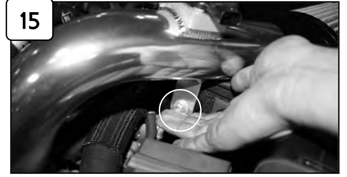
With M6 nut, wavy and flat washer provided, secure tab and tighten suing 10mm socket or wrench.