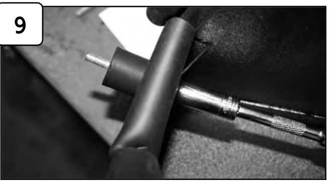
Tighten isolation mount provided on housing using 10mm socket or wrench.