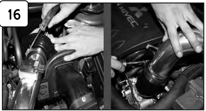
Install filter and tighten using 5/16" nut driver. Tighten all remaining clamps using 5/16" nut driver.

For replacement part(s) or "Restore Kit" please log on to takedausa.com P.O. Box 1719 Corona CA, 92878