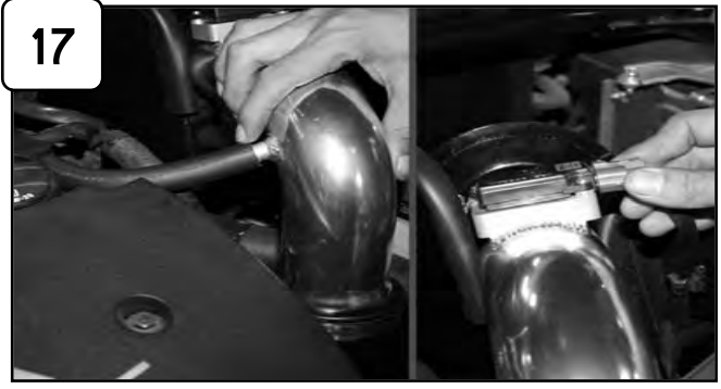
Install provided 5/8" hose to engine and tube. Reconnect MAF sensor harness. Reconnect battery terminals.