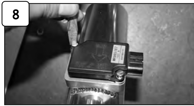
Install MAF sensor to new tube and secure using M4 screws provided.