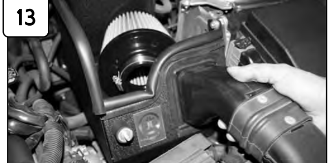
Place filter in housing. Attach ram air assembly to housing.