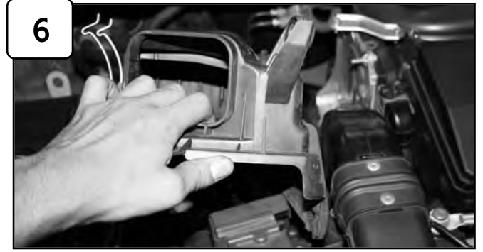
Pull back ram air assembly from air box and remove.