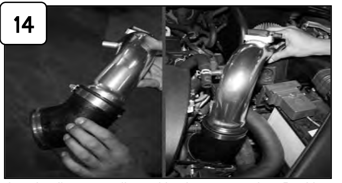
Attach elbow coupling with clamps to tube. Position tube to throttle body and tab on tube to isolation mount.