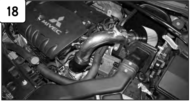
The installation of your Takeda performance intake is now complete. Please check all components and retighten if necessary. Thank you for choosing Takeda!