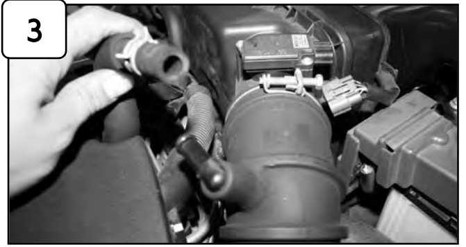
Disconnect MAF sensor and pull back crank case line and remove from engine.