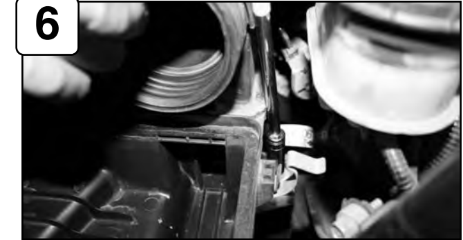
Using a 10mm socket or wrench, remove the mounting bolt on the back of the lower intake box.