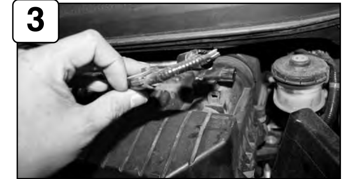
Unplug the MAF sensor harness.