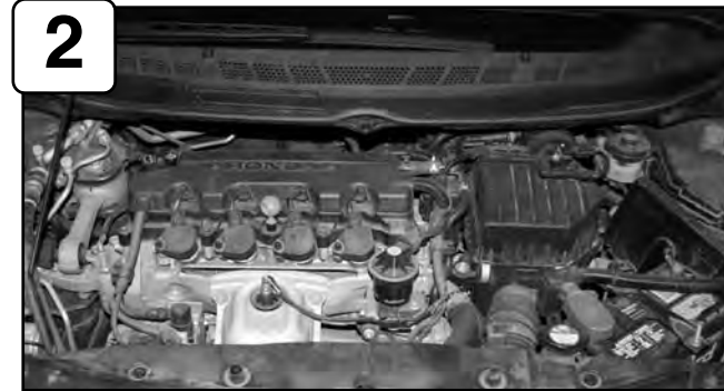
Complete stock intake. Please disconnect battery terminals before installation. Be sure to have your radio security code (if applicable) in order to access your previous settings. Remove the battery and battery tray before install.