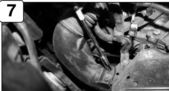
With a 10mm socket or wrench remove both bolts securing the ram air duct to the vehicle