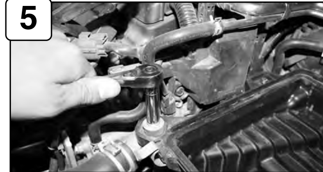
Using 10mm socket or wrench, remove the lower intake box's mounting bolt.