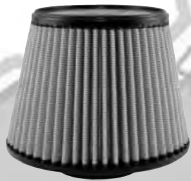
Replacement Filter P/N: TF-9011D