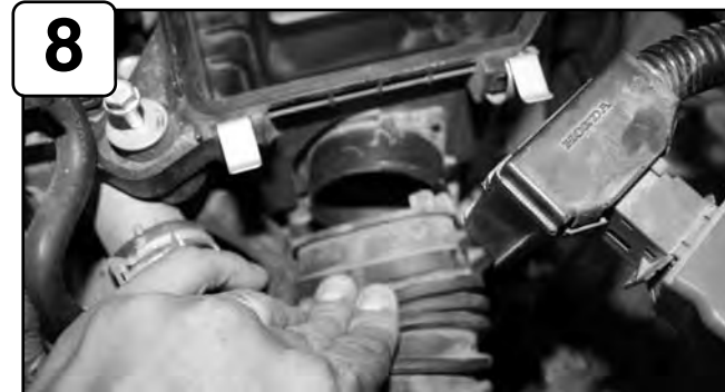
Pull the ram air duct tube off of the lower intake box.