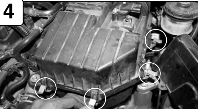
Disconnect all retainer clips and remove the upper intake box.