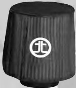
Pre Filter P/N: TP-7011B

Note: Filter Cleaning: When cleaning your Pro Dry S™ filter, be sure to use only "Restore Kit" (Takeda P/N: TP-7016C Pro Dry S™ cleaner only.)