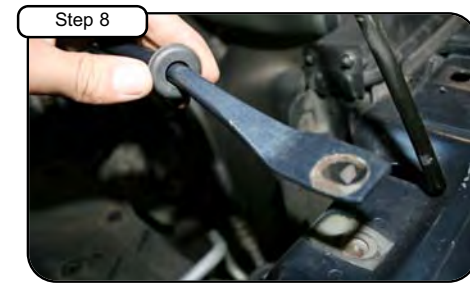
Step 8 Attach grommet provided and install on core support bracket.