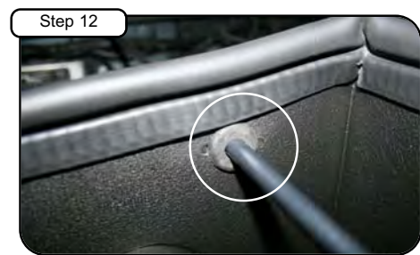
Step 12 Align grommet from step 8 and position in hole to prevent core support bracket from vibration.