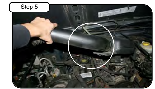
Step 5 Pull crank case line away from stock intake and remove from vehicle.