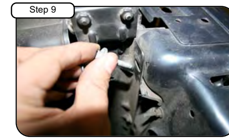
Step 9 Loosen bolt on core support using 10mm wrench. Save bolt for later install.