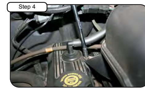
Step 4 Loosen bolts holding in stock intake tube on valve cover using 8mm socket or wrench and remove.