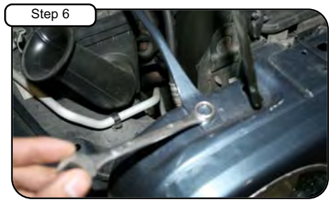
Step 6 Loosen bolt on core support bracket using 13mm socket or wrench.