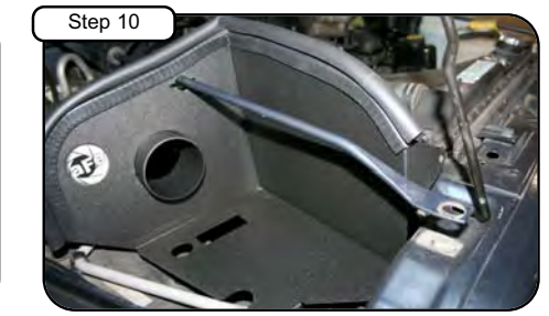
Step 10 Attach trim seal to housing and install. Make sure core support bracket slides through hole on housing.