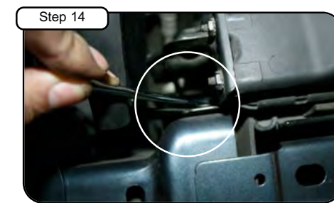
Step 14 Secure bracket on housing using screw from step 9 using 10mm wrench.