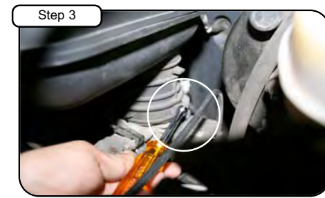
Step 3 Loosen clamp on throttle body using 5/16" nut driver.