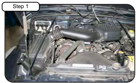
Step 1 Complete Stock Intake. Disconnect battery before install.