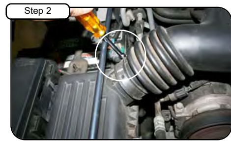
Step 2 Loosen clamp on stock intake using 5/16" nut driver.