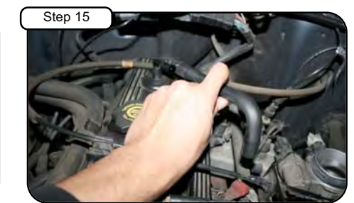
Step 15 Remove crank case line from engine.