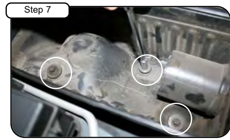
Step 7 Remove upper half of air box. Loosen the 3 bolts on bottom of air box using 8mm socket or wrench and remove.