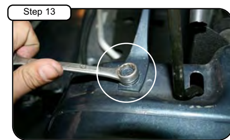
Step 13 Secure core support bracket using 13mm.