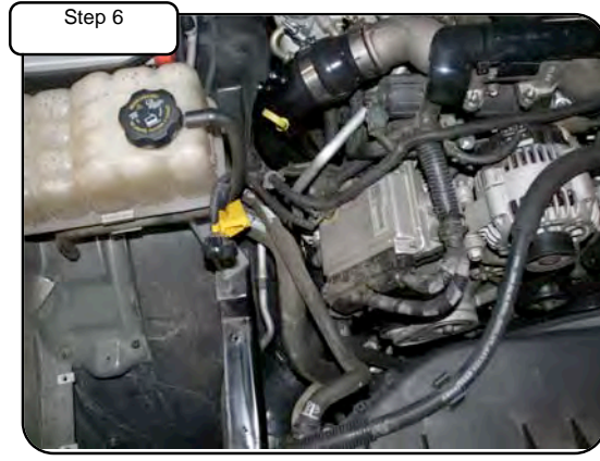
Install new tube and position into coupler on intercooler. Tighten and torque all clamps to 75 in-lbs.. Reinstall the air intake system and your intercooler tube installation is now complete. Thank you for choosing aFe power!