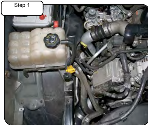
Complete Stock Intercooler tube. (Note: the air intake system has been removed)