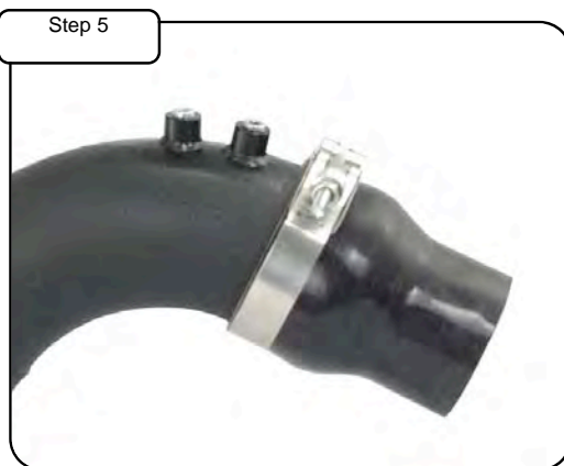
Install reducer coupler with clamp provided to new tube.