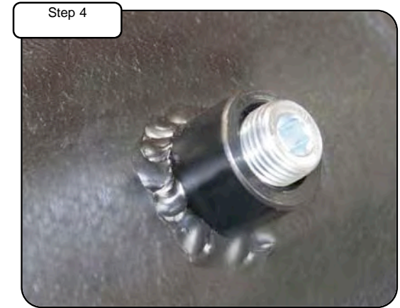
Install plugs in to 1/8" NPT ports with 3/16" hex key. Use teflon pipe sealant tape for leak tight fit.