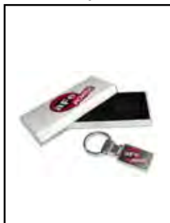
aFe Key Chain