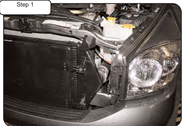
Stock Intercooler. NOTE: Disconnect battery before install. Remove stock air box or intake system from vehicle for easier installation.