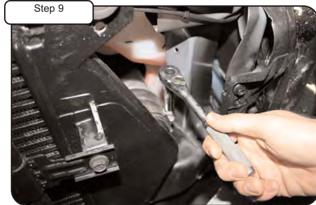
Step 9 Loosen clamps on intercooler tubes using 7/16" deep socket.