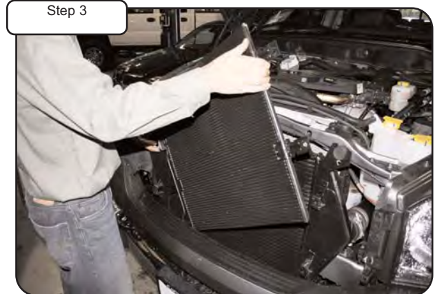
Rotate the A/C condenser up and out away from vehicle. Take care to prevent damage to A/C lines.