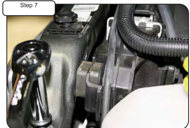
Loosen and remove the 4 bolts holding in upper radiator support using 13mm socket or wrench.