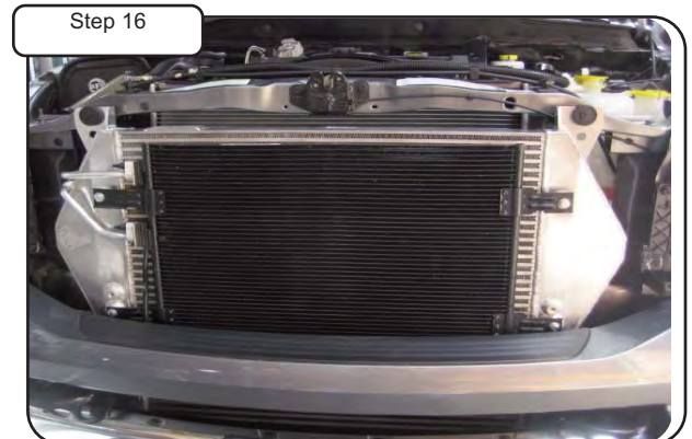
Step 16 Re-attach A/C condenser with supplied screws and lock washers. Re-install intake/ stock air box & re-connect battery. Your installation is now complete. Please check all screws and clamps periodically. Re-tighten if necessary. Thank you for choosing aFepower!