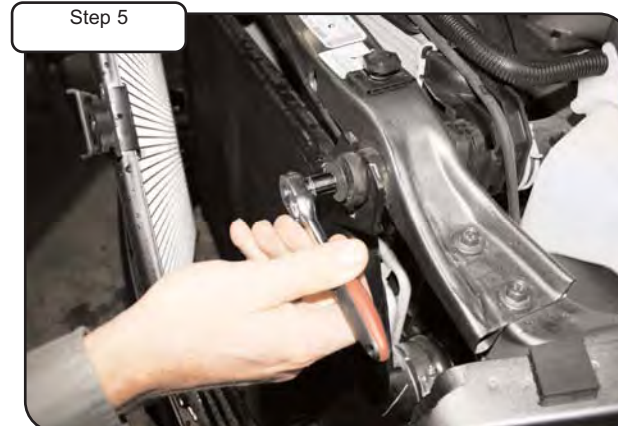
With 10mm socket or wrench remove the 2 top intercooler attachment bolts connected to upper radiator support.