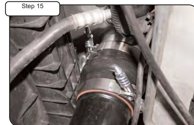
Step 15 INTERCOOLER MAY NEED ALIGNMENT, TIGHTEN WHEN IN CORRECT POSITION & PROPER CLEARANCE. Re-install Radiator support (See reverse steps 5 through 8). Tighten and torque all clamps to 5 ft. lbs.