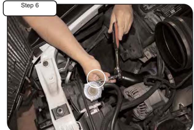
With 10mm socket and extension loosen the two bolts holding in radiator on back of upper radiator support.