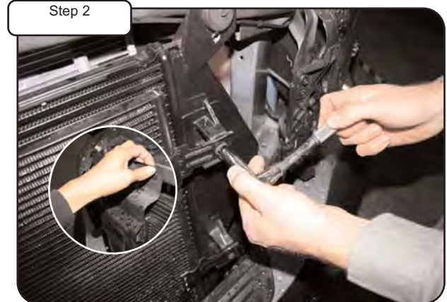
Remove plastic A/C line protector on passenger side. With 13mm socket or wrench. Now loosen the 4 bolts holding in A/C condenser.