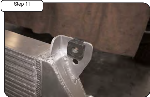
Step 11 Remove the two upper-rubber isolators with spacers from stock intercooler and install to new BladeRunner® intercooler.