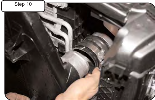
Step 10 Pull back coupler from intercooler. Now remove stock intercooler out of vehicle.