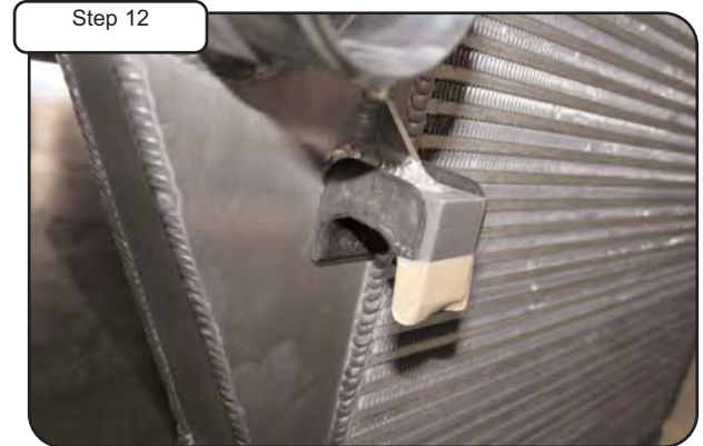
Step 12 Remove the 2 U-shaped rubber isolators from stock intercooler and install to new BladeRunner® intercooler. NOTE: Tape isolators in place for easier installation.