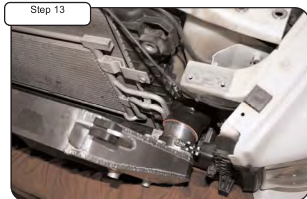
Step 13 Now install BladeRunner® intercooler into vehicle.