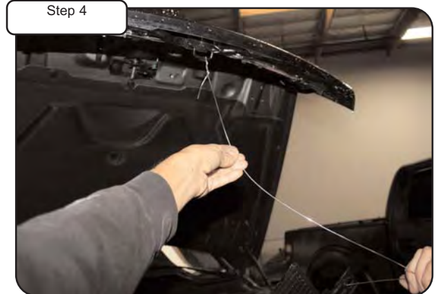
With A/C condenser turned 90 degrees, secure to the vehicles lifted hood using steel wire.