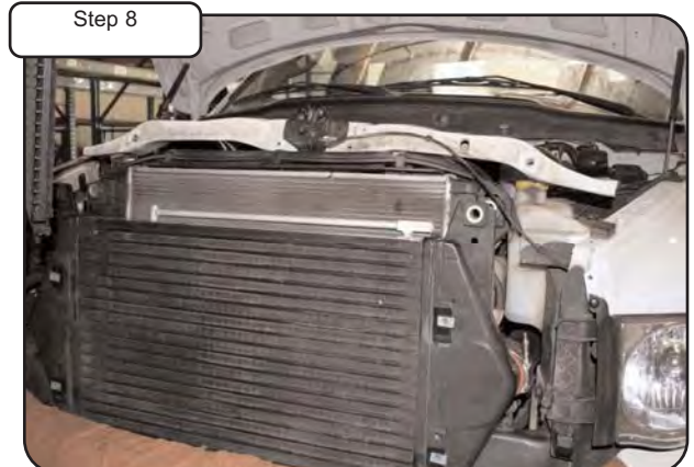
Remove the upper radiator support and set aside on top of fan shroud.