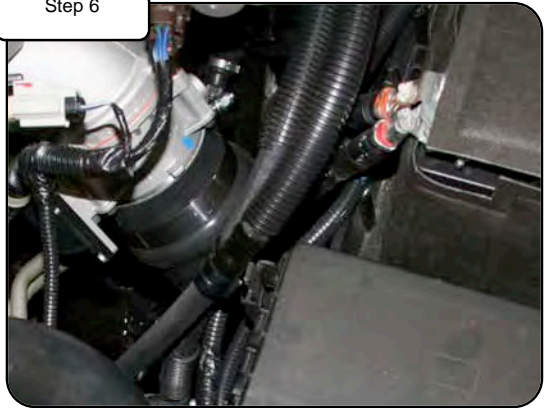
Install 3-1/2" hump coupler to manifold with clamps provided.