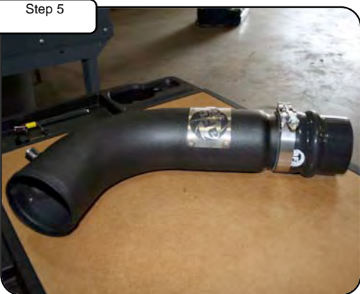
Install 3" hump coupler with clamps provided to new tube.