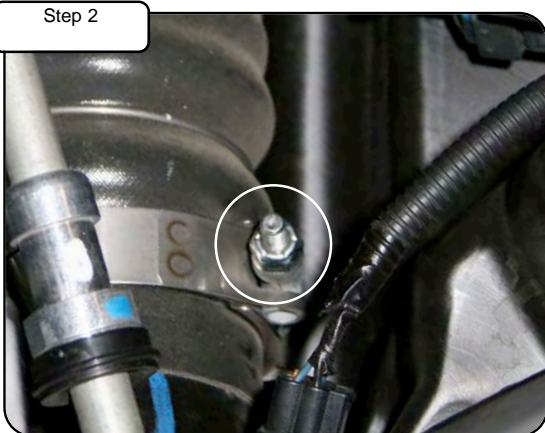
With 7/16" deep socket, loosen clamp on intercooler.