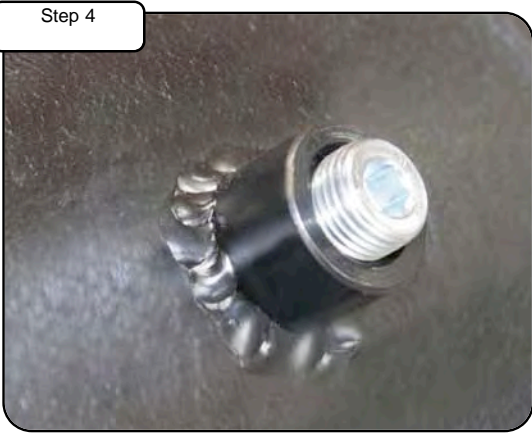
Install plugs in to 1/8" NPT ports with 3/16" hex key.