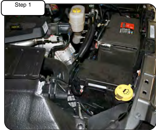
Complete Stock Intercooler tube.