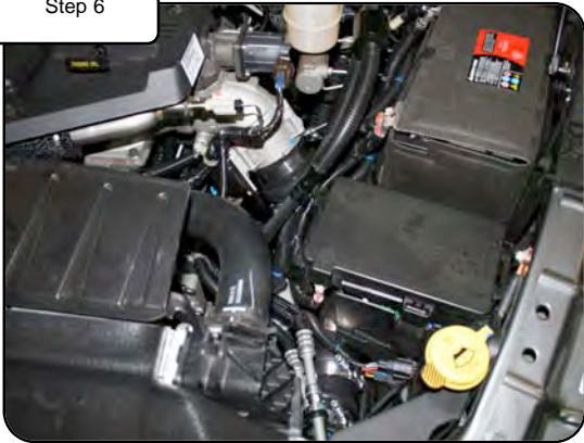
Install new tube and position into coupler on manifold. Tighten and torque all four clamps to 75 in-lbs. Check and tighten after 50 miles! Your Intercooler tube installation is now complete. Thank you for choosing aFe power!