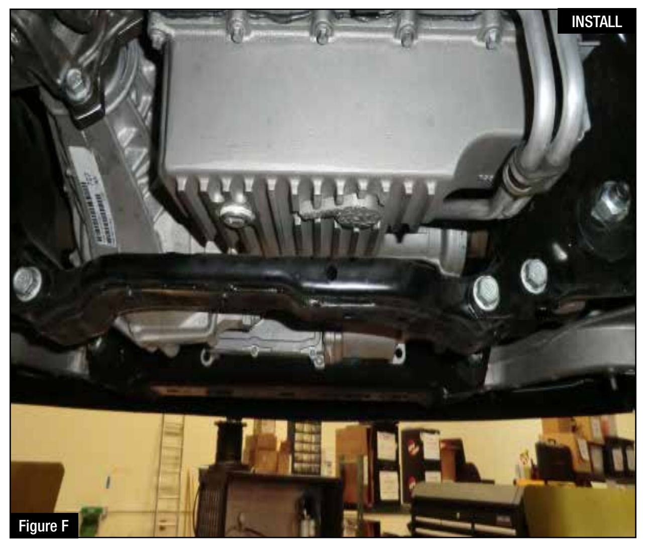
Refer to Figure F for steps 14-16

Step 14: Using an 18mm socket and wrench, reinstall the crossmember and the factory hardware and tighten.