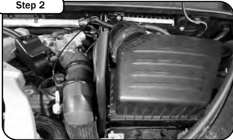
Complete stock intake.