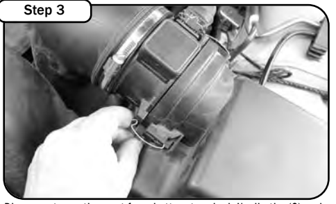
Disconnect negative post from battery terminal. Unclip the (2) spring clips that secure the MAF sensor to the air box.