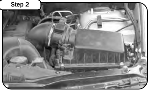
Complete stock intake.