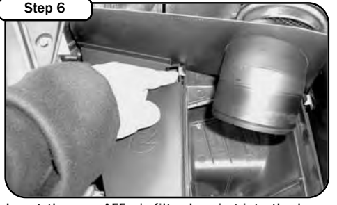
Insert the new AFE air filter housing into the lower portion of the OEM air box. Make sure the housing is placed inside the groove of the OEM box. Fasten the (4) spring clips into the new housing