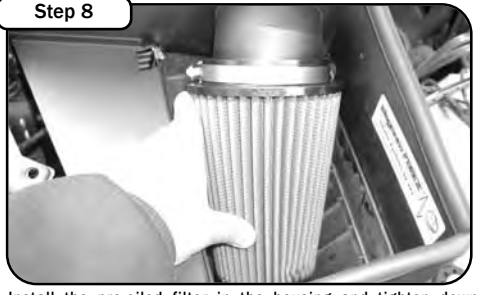
Install the pre-oiled filter in the housing and tighten down clamp. DO-NOT use any oil or grease. Install the housing trim seal around the sides of the housing.