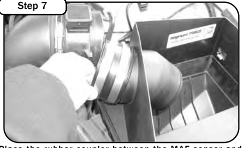
Place the rubber coupler between the MAF sensor and the intake pipe and slip the (2) #56 hose clamps over the connection and tighten the hose clamps.