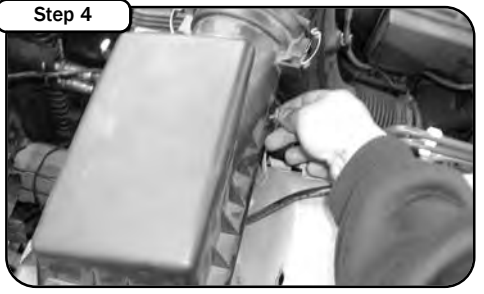
Unclip the (4) spring clips located around the air box by pulling back on the clip