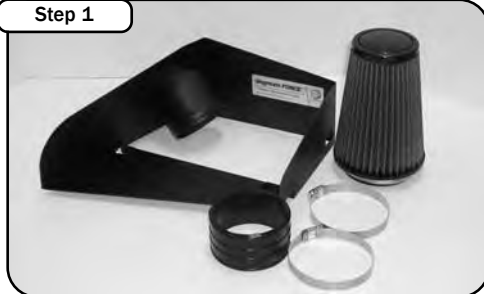
Complete kit with parts.