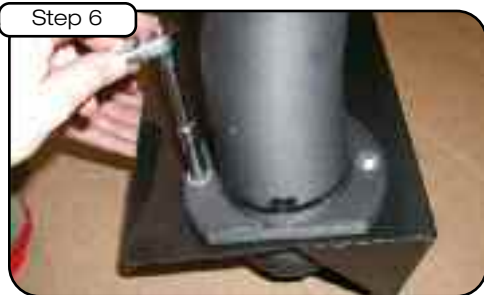
Insert tube into heat shield with flange on outside. The longer side of the tube should be facing outside of the heat shield. Secure using provided M6 hardware; be sure to use one washer for each side of each bolt, DON'T over-tighten.