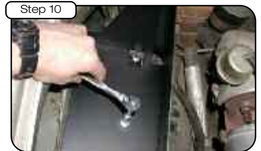
Using remaining M8 hardware and the existing holes in the fenderwell, secure the heat shield to the fender well. Tighten the hardware.