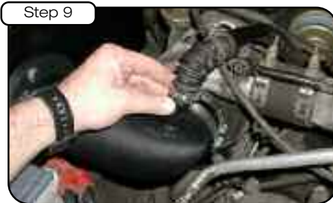
Place crankcase breather elbow onto the nipple of the plastic tube and re-tighten the coupler, be sure to not over-tighten the coupler.