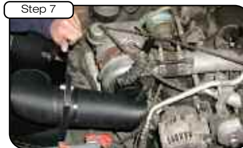
Before placing the heat shield into the engine compartment, slide the remaining clamp over the turbo coupler. Insert turbo end of the plastic tube into the coupler and rotate the assembly to seat the heat shield.