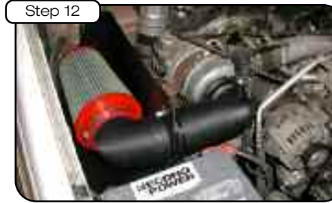
Complete aFe kit installed. Check and retighten all connections after first few hours of operation.