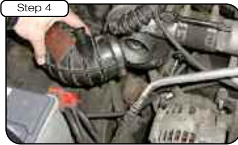
Remove factory rubber elbow at turbo.