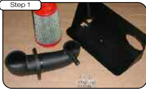
Complete kit components