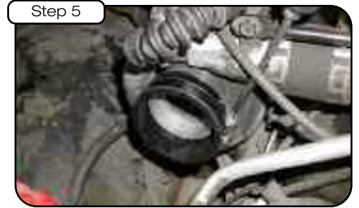
Place provided coupler onto turbo and secure the turbo end by tightening provided clamp.