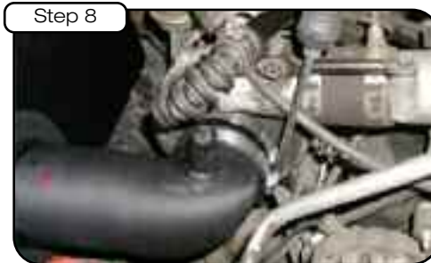
Tighten the remaining clamp securing the tube to the turbo coupler.