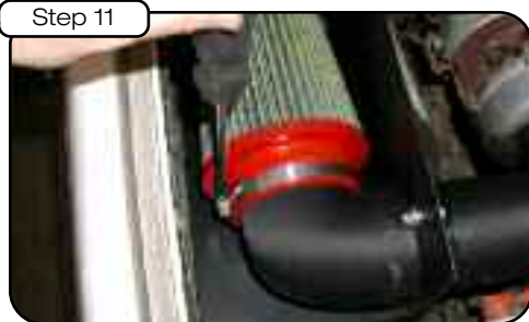
Install provided aFe filter onto the plastic tube and tighten.